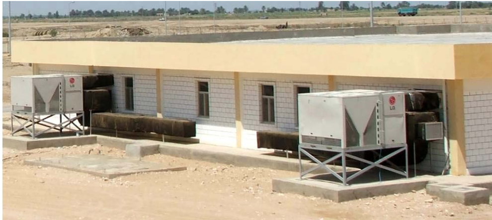
Site Photo 11. One side of the dining facility with the two central HVAC units

The dining facility interior design included aluminum frame windows, metal exterior doors, and terrazzo tile floors. In the kitchen, the design required glazed ceramic tile on the wall up to the door height. Beyond that height, the wall was to be plastered and painted. In the two dining rooms, the original design required plastered and painted walls and ceiling. Prior to construction, the contractor requested, and received approval to install a suspended acoustical ceiling in the dining areas, which included the recessed fluorescent lights and the diffusers for the HVAC system. In addition, the contractor installed glazed ceramic tile on the lower portion of the walls in the dining rooms and on the columns in the enlisted dining room. Site Photo 12 illustrates the enlisted dining room and its interior finishes including the suspended ceiling, floor tile, and wall coverings. To augment the HVAC system, the contractor installed fans in the dining rooms as required by the design. The contractor also installed in compliance with the design, eight pedestal style washbasins in the enlisted dining room and four in the officer dining room.