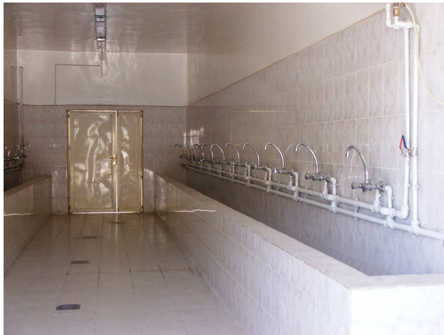
Site Photo 9. Hand washing station in one of the shower and toilet buildings

The interior design for each building required 20 water closets with eastern style toilets, 20 individual shower stalls, and 28 hand washing stations. The interior finishes included ceramic tile floors and walls. The design also required individual wood doors for each water closet and shower stall. Site Photo 9 provides an example of the hand washing stations in one of the shower and toilet buildings.