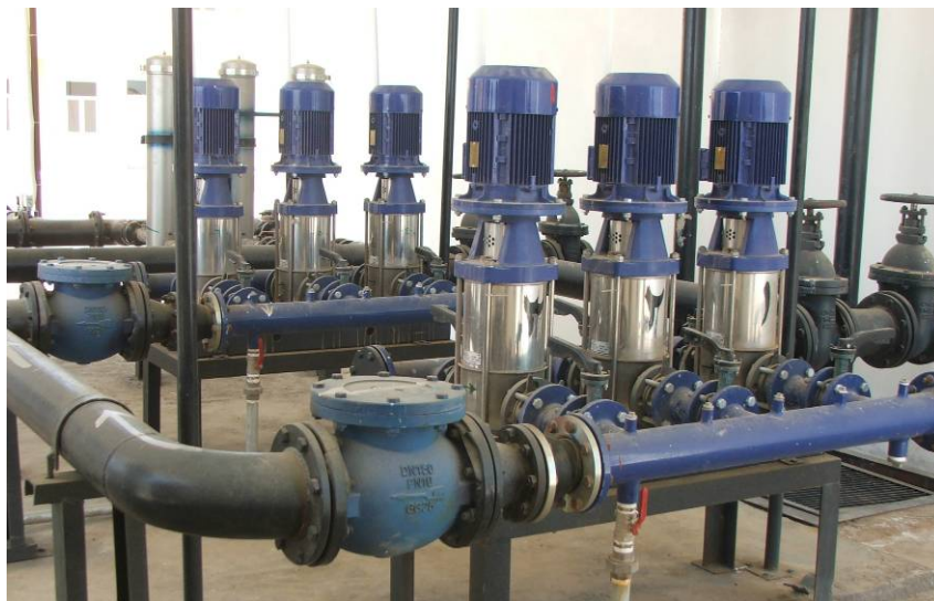
Site Photo 20. Two sets of booster pumps, and cartridge filters are in the background

The pumping facility design included two sets of three booster pumps (one set to serve in standby mode). Each pump, rated at 24 cubic meters per hour at 50 m of head, is designed to pump water from the storage tanks to the garrison buildings. The design also included three, 5 micron cartridge filters inside stainless steel housings to filter out sediments prior to the water entering the service line to the garrison buildings. Site photo 20 shows the booster pumps. During the site visit, we did not observe any deficiencies associated with the pumps, filters, piping, and valves, including any evidence of leaks or loose connections.