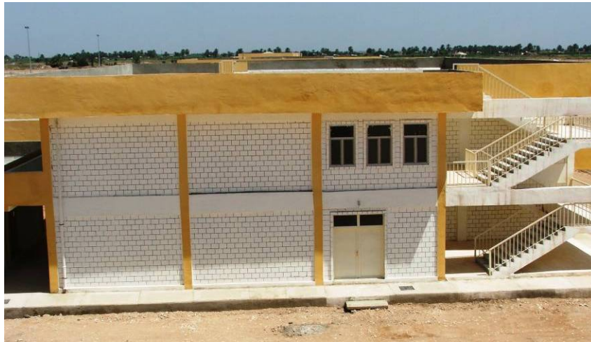
Site Photo 2. Exterior view of one of the three barracks

We inspected each of the three barracks buildings. Site Photo 2 shows the exterior of one of the three buildings.