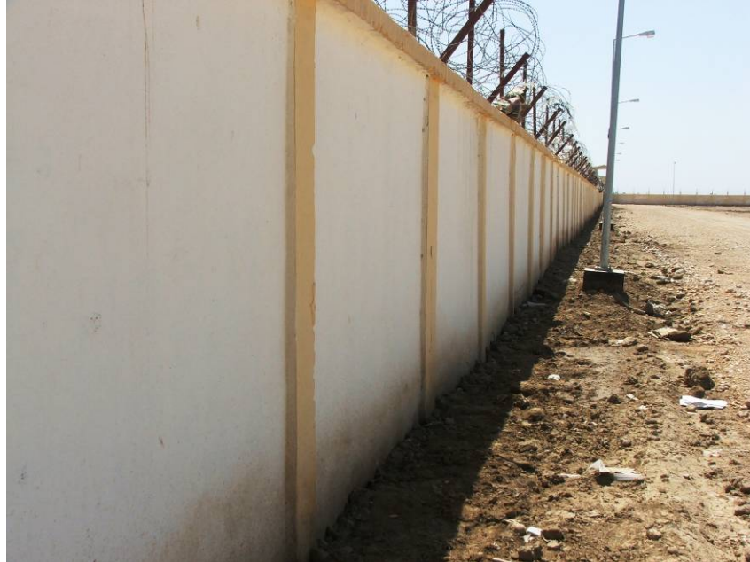
Site Photo 21. One section of the perimeter wall

During the site visit, we verified that the perimeter wall was in place around the garrison compound. A survey of the entire perimeter was not conducted. However, we did look at portions of the wall along the south part of the compound, which is shown in Site Photo 21.