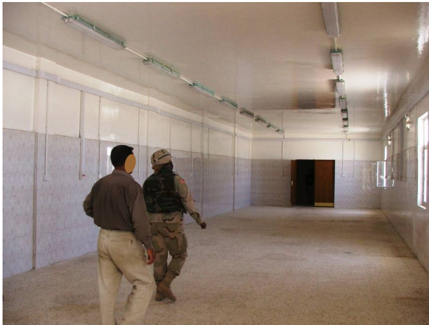
Site Photo 13. One side of the kitchen area in the dining facility

Based on the review of the contract requirements, the design, and our observations on site, the construction of the dining facility met the requirements of the design. When the Iraqi Army moves into the garrison, they should be able to establish a functional dining facility in this building.