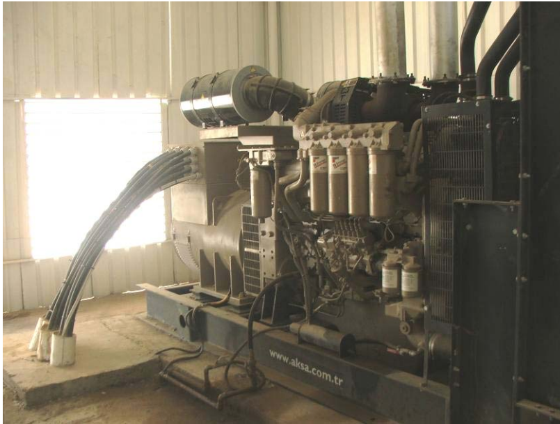
Site Photo 17. One of the two electrical generators installed at the garrison

The design required housing the two generators in a reinforced concrete structure with sand lime block-walls similar to the others constructed at the garrison. However, with the shift in site generator locations, a decision was made by USACE to use a pre-engineered metal building to house the generators instead of the reinforced concrete structure. Site Photo 17 provided by USACE, shows the metal building while under construction prior to painting.