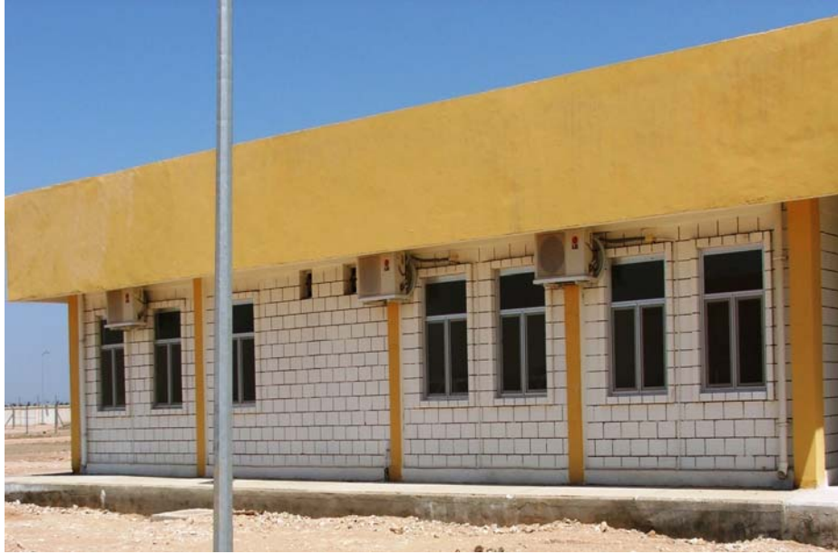
Site Photo 6. Company headquarters building

Based on the review of the design, and our observations on site, the construction of the company headquarters buildings met the requirements of the design.