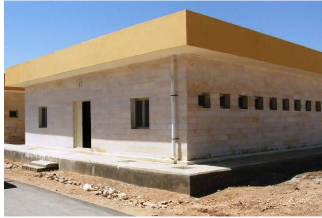
Site Photo 8. Completed shower and toilet building

The interior design for each building required 20 water closets with eastern style toilets, 20 individual shower stalls, and 28 hand washing stations. The interior finishes included ceramic tile floors and walls. The design also required individual wood doors for each water closet and shower stall. Site Photo 9 provides an example of the hand washing stations in one of the shower and toilet buildings.