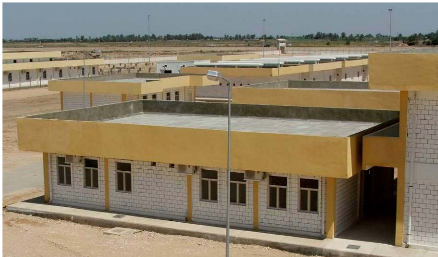
Site Photo 1. Buildings at the 609 th ING Battalion Garrison

The 609 th ING Battalion garrison buildings were designed with the same architectural style. The majority of the buildings are reinforced concrete structures infilled with exterior masonry walls. Site Photo 1 shows the style of construction that was utilized at the 609 th ING garrison.