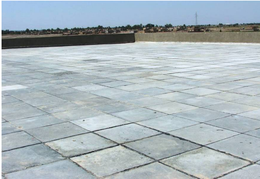
Site Photo 5. Roof on one of the barracks buildings

150 mm of clean soil compacted and sloped for drainage to the roof drains. The surface layer of the roof consisted of 800 millimeter (mm) x 800 mm x 40 mm precast concrete tiles. Based on our observations and a through review of the construction progress photos provided by the USACE PE, we verified the roof of the barracks building was constructed as designed. Site Photo 5 shows the roof system consisting of a top layer of concrete tiles, with sealed joints between the tiles. In addition to the tiles, roof drains (100 mm in diameter) were in place at the corners of the roof as required by the design, and connected to drain pipes hung along the exterior walls.