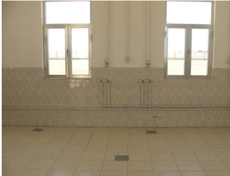
Site Photo 16. Interior of the officer laundry

The washers and dryers were not part of the scope of work and were to be provided by the Iraqi military. The laundry's required interior finishes included ceramic tile floors, ceramic tile walls (on the lower half with the upper half plastered and painted), as well as plastered and painted ceilings. Site Photo 16 shows the interior of the laundry, including some of the piping, connections and power outlets for the washers. Our observations indicated the laundry construction satisfied the design requirements.