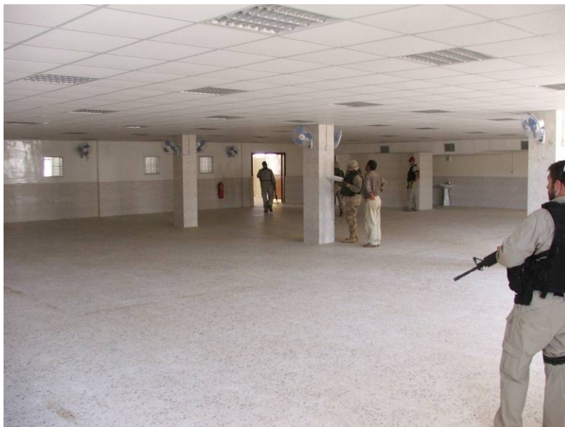
Site Photo 12. Enlisted dining area

The dining facility interior design included aluminum frame windows, metal exterior doors, and terrazzo tile floors. In the kitchen, the design required glazed ceramic tile on the wall up to the door height. Beyond that height, the wall was to be plastered and painted. In the two dining rooms, the original design required plastered and painted walls and ceiling. Prior to construction, the contractor requested, and received approval to install a suspended acoustical ceiling in the dining areas, which included the recessed fluorescent lights and the diffusers for the HVAC system. In addition, the contractor installed glazed ceramic tile on the lower portion of the walls in the dining rooms and on the columns in the enlisted dining room. Site Photo 12 illustrates the enlisted dining room and its interior finishes including the suspended ceiling, floor tile, and wall coverings. To augment the HVAC system, the contractor installed fans in the dining rooms as required by the design. The contractor also installed in compliance with the design, eight pedestal style washbasins in the enlisted dining room and four in the officer dining room.