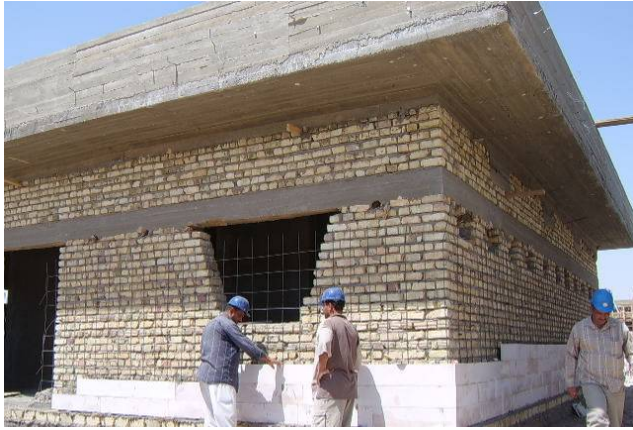
Site Photo 7. Shower and toilet building under construction