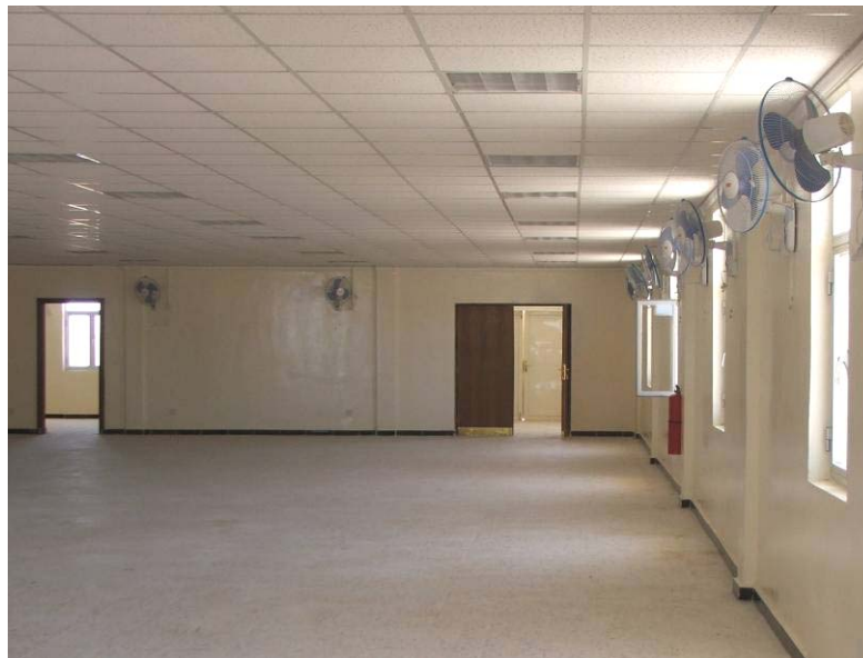
Site Photo 14. Sport room with adjoining office and store room

The design for the 11.8 m x 30 m sport room, which included an office and a storeroom, required plastered and painted walls and ceilings, terrazzo floors, aluminum frame windows, wood interior doors, and metal exterior doors. The original design required window air conditioning units, but the air conditioning units were de-scoped from the project prior to construction. Site Photo 14 shows the sport room. In the absence of air conditioning, the contractor had placed fans along the walls. In addition, instead of a plastered and painted ceiling, the contractor installed a suspended acoustical ceiling after requesting and receiving approval from the USACE Area Office. Based on our observations of the sport room construction, the facility as constructed, met the requirements of the design.