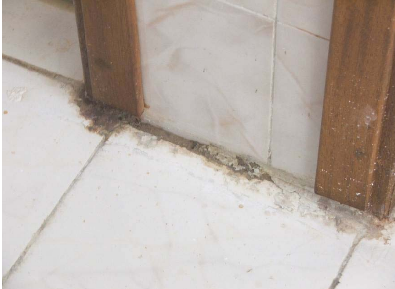
Site Photo 10. Dirty and excess grout material left on ceramic tiles

listed as a deficiency on the USACE Quality Assurance Representative's deficiency tracking log. Additionally, in some areas, particularly near the walls or corners of the showers or water closets, we found the quality of workmanship associated with the ceramic floor tile grouting to be poor. Site Photo 10 provides an example of grouting workmanship, showing excess material left on the floor tile and dirty grout. One factor affecting the quality of workmanship, especially with finish work activities, was the requirement to utilize local labor. The USACE PE informed us that in order to maintain good relations with the local Iraqi leaders, the contractor was compelled to hire local labor, the majority of which were unskilled. The use of unskilled labor on this project directly influenced the quality of workmanship.