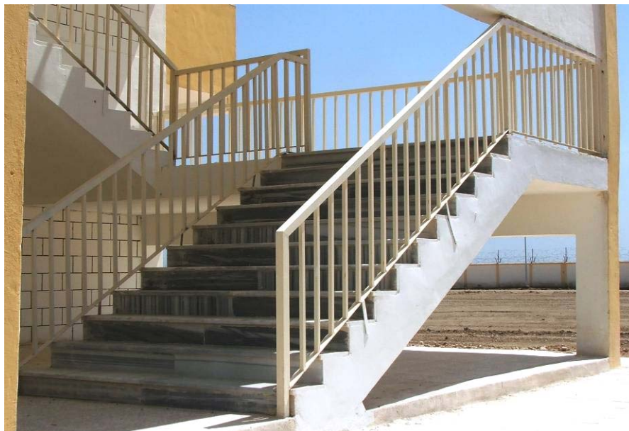
Site Photo 4. Exterior stairs in the barracks finished with marble tiles

The design for each barracks building required two external stairways to access the second story and the roof. The design called for concrete steps, with no finish to the step other than painting. However, marble tile had been placed as the finish for each step in all six sets of stairs in the three buildings. According to the USACE PE, the contractor installed the marble tile at no additional cost to the Government. Site Photo 4 provides an example of one of the sets of stairs finished with the marble tile.