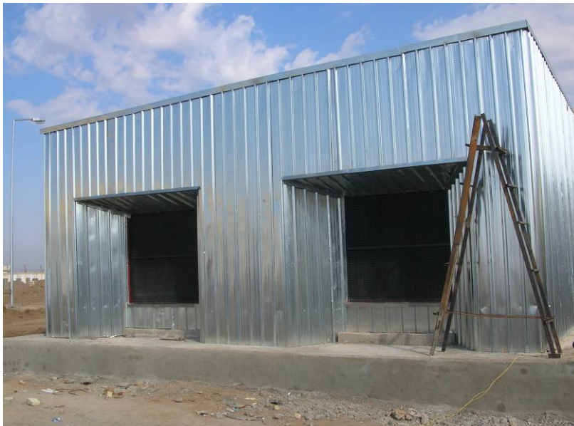
Site Photo 18. Generator building while under construction

The design required housing the two generators in a reinforced concrete structure with sand lime block-walls similar to the others constructed at the garrison. However, with the shift in site generator locations, a decision was made by USACE to use a pre-engineered metal building to house the generators instead of the reinforced concrete structure. Site Photo 17 provided by USACE, shows the metal building while under construction prior to painting.