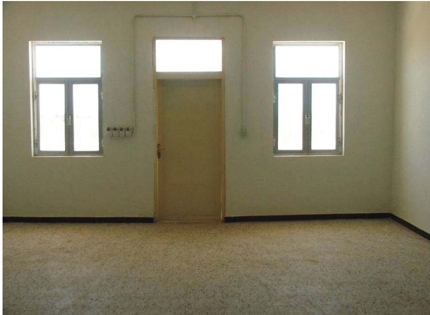
Site Photo 3. One side of a typical barracks room

The design for each barracks building required two external stairways to access the second story and the roof. The design called for concrete steps, with no finish to the step other than painting. However, marble tile had been placed as the finish for each step in all six sets of stairs in the three buildings. According to the USACE PE, the contractor installed the marble tile at no additional cost to the Government. Site Photo 4 provides an example of one of the sets of stairs finished with the marble tile.