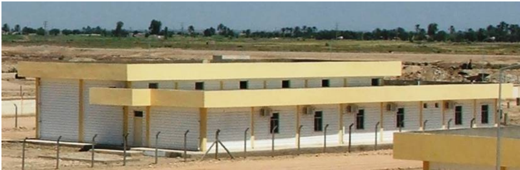
Site Photo 19. Logistics building

The design required a 623 m 2 reinforced concrete structure infilled with sand lime block walls. Site Photo 19 provides an exterior view of the logistics building.