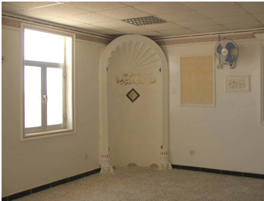
Site Photo 15. View of the Mihrab in the mosque

Similar to the sport room, the architectural design for the 10 m x 10 m Mosque included terrazzo-tiled floors, plastered and painted walls, and aluminum frame windows. The contractor installed a suspended acoustical ceiling in lieu of a plastered and painted ceiling. In addition, the original design required window HVAC units, but as mentioned earlier, the contractor substituted split system units after receiving approval from the USACE Area Office. In constructing the Mosque, the contractor included several enhancements. The contractor provided a “mihrab” 3 as shown in site Photo 15. In addition, the contractor hung framed inspirational verses from the Koran on the walls, and the contractor installed patterned window and wall coverings.