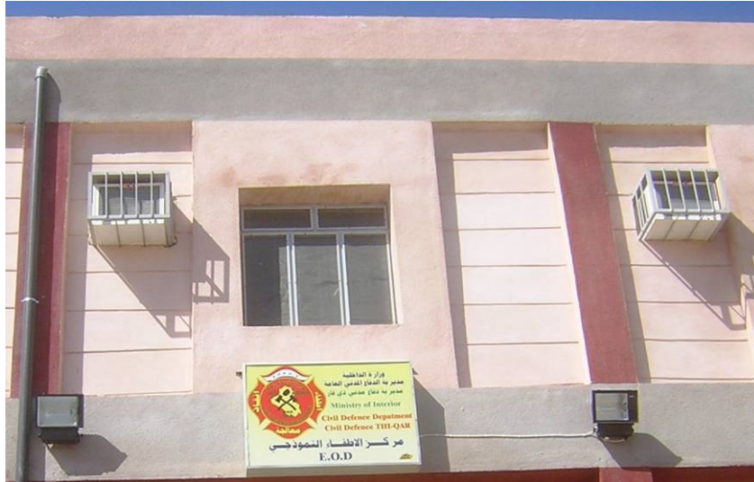
Site Photo 15. Window type HVAC units on third level of the fire station