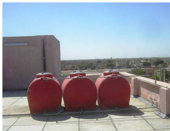
Site Photo 14. Roof top water tanks

The design drawings showed a third level locker room for males with space for lockers, as well as five toilets, five wash basins, and five showers. In addition, the design included a mezzanine level female locker room that included lockers, two washbasins, and two toilets. On the third level, the fire chief's bedroom contained a bathroom with a washbasin and toilet. Based on the review of the QA reports and the QA deficiency log, there were no issues regarding the construction of the bathroom and shower facilities, including the plumbing and installation of the bathroom fixtures.