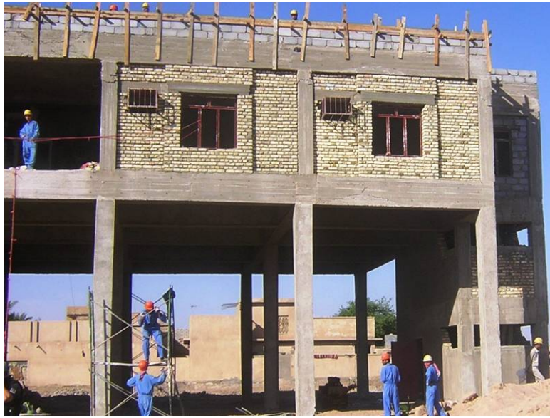
Site Photo 8. Exterior brick walls on third level

construction progress photos, the contractor utilized bricks (Site Photo 8) and block (Site Photo 9) to construct masonry walls. The drawings did not specify the type of bricks required for the construction of the block walls.