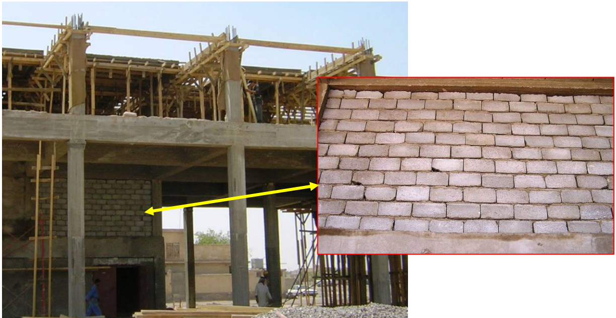
Site Photo 9. Block wall on mezzanine level

During the course of construction, the USACE QAR did identify poor workmanship in constructing one of the exterior walls. According to the Quality Assurance (QA) Deficiency Log, the wall shown in Site Photo 10 was identified as a problem in December 2005. Two weeks later, the deficiency had been corrected and the wall replaced.