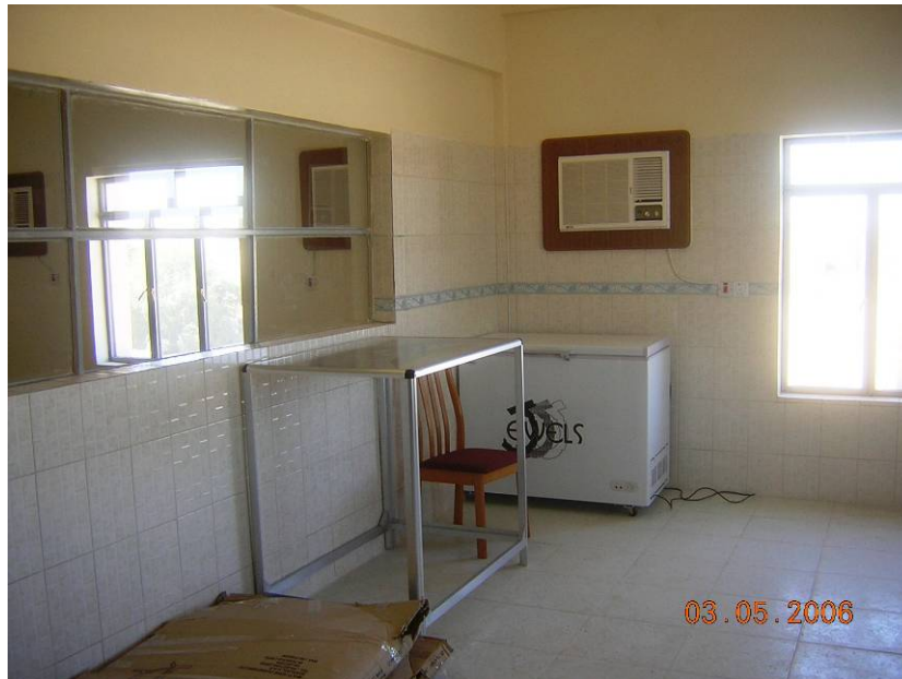
Site Photo 11. Kitchen with ceramic tile wall covering

For finishing the exterior and interior walls and ceilings, the bill of quantities listed plastering and painting. The bill of quantities required the plastering of exterior walls with a sand cement mortar and the interior walls and ceilings with a gypsum plaster. For flooring, the contractor installed terrazzo floor tile in all areas except for the kitchen and bathroom areas, where ceramic tile was utilized. In addition, ceramic tile was used on the showers and water closet walls, as well as on the other wall surfaces in the bathrooms. In the kitchen, as shown in Site Photo 11, the contractor placed ceramic tile on the walls to a height equal to the top of the window.