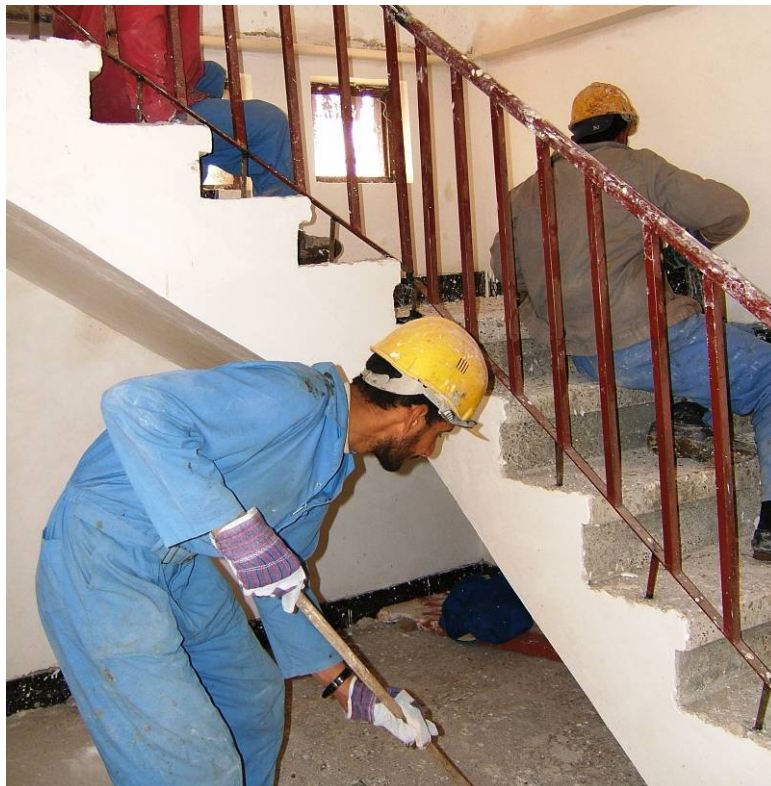
Site Photo 7. Concrete stairs at ground level