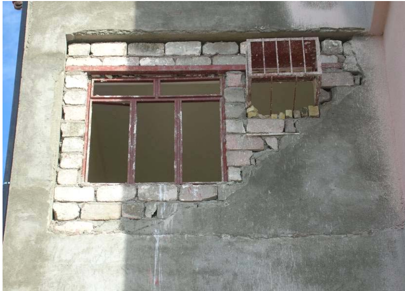
Site Photo 10. Poorly constructed wall reconstructed after direction from USACE

Also, the contractor failed to construct exterior walls at ground level on each side of the fire station. The USACE QAR discussed the missing non-load bearing walls with representatives of the ICDD, and the ICDD reported that the walls were not necessary. Since the walls were not load bearing, the walls were omitted from the contract requirements. The omitted walls on each side of the building are shown in Diagram 1.