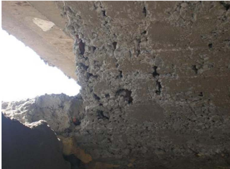
Site Photo 3. Segregated concrete on stairs due to improper placement