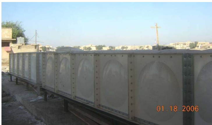
Site Photo 13. Surface level 10 m^3 water tanks

The contract design required two water storage tanks, each with a capacity of 10 cubic meters ( m^3 ) to be constructed at the ground level on one side of the station. In addition, the design included eight, one m^3 roof top water tanks. Through a review of the construction progress photos, we verified the installation of the two ground level tanks, and five roof top tanks, although we could not determine their capacity. Site Photos 13 and 14 show the two types of water tanks installed at the fire station.