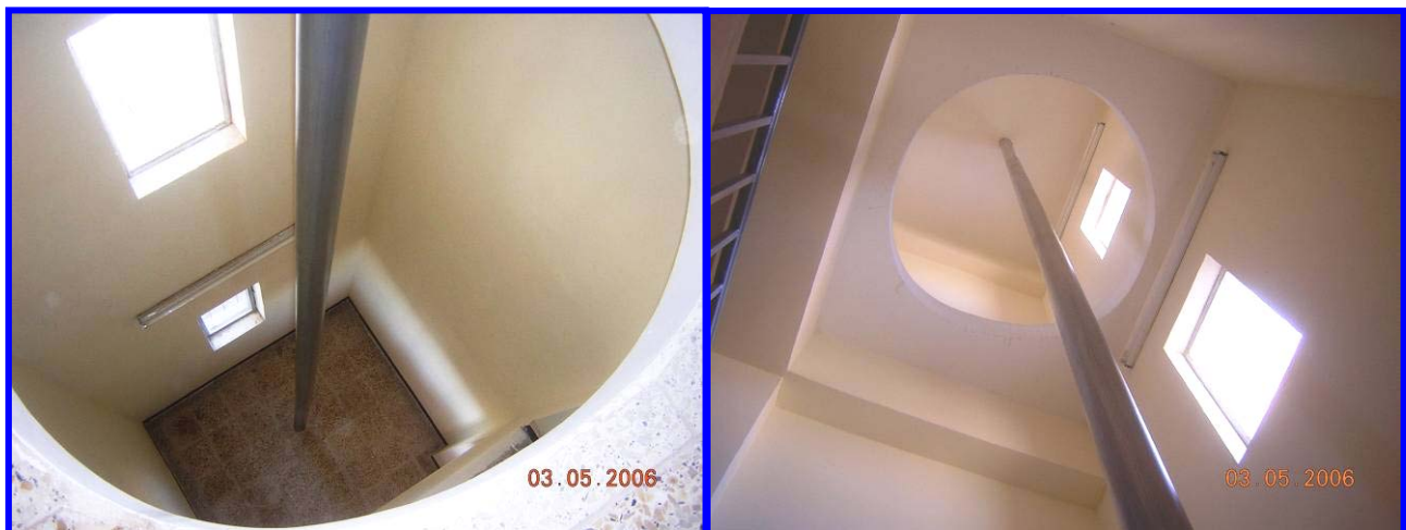
Site Photo 12. Top and bottom perspective of the fireman's pole

Another architectural feature in the building inherent with fire stations is the fireman's pole. The contractor's design showed a four inch diameter steel pole to provide direct access to the ground floor level from the living areas on the third level. Site Photo 12 shows two perspectives of the completed fireman's pole and the opening through the floor slab.