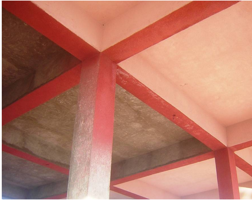
Site Photo 6. Reinforced columns and beams supporting level 3