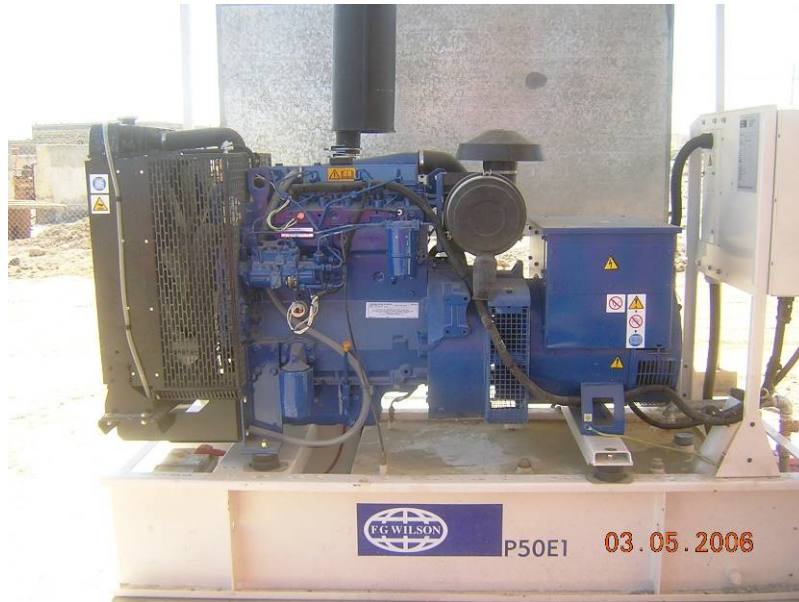
Site Photo 16. Generator installed at the fire station

The design drawings required a 50 kilovolt amp generator to be located adjacent to the building on a concrete pad. Site Photo 16 shows an “F. G. Wilson” generator, model P50E1 installed at the fire station. The assessment team reviewed the catalog cut information provided by the USACE PE, and verified the generator met the contract requirements.