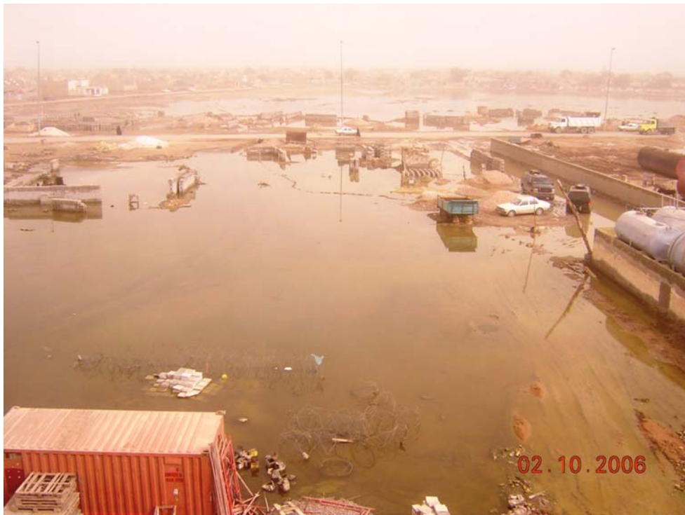
Site Photo 17. Standing water – Photo provided by USACE

Another issue that could impact sustainability is the poor drainage around the fire station. The Nasiriyah Fire Station site is level. The site does not drain well since it is relatively flat, and the city street is located approximately 125 meters (m) away from the fire station. Site Photo 17 shows standing storm water runoff in front of the fire station site. During an interview, the USACE stated that the contractor provided the fire station with an entryway that has sub-base materials, but the project did not address drainage.