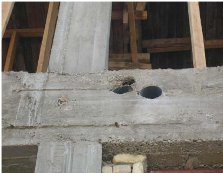
Site Photo 4. Hole in concrete beam above pipe sleeve; also segregated concrete on bottom of beam