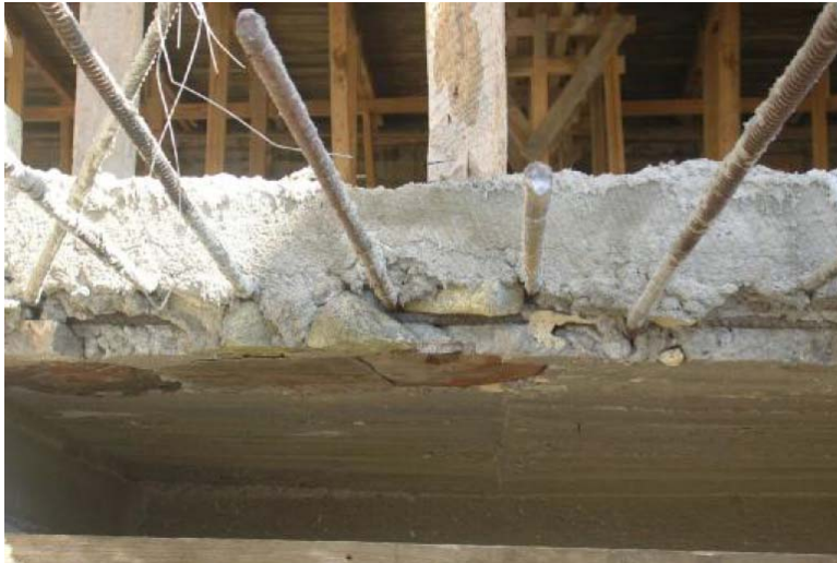
Site Photo 5. Improper placement of reinforcing steel with insufficient length along a stair landing

Subsequent to the inspection, the USACE GRS contracting officer issued a stop work order, dated 2 September 2005, because of the concerns regarding the structural integrity of the fire station.