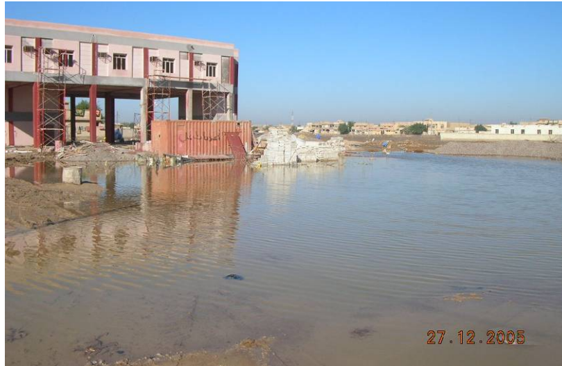
Site Photo 1. Standing water on the front side of the of the fire station

plain and the topography of the fire station site is level. The site does not drain very well since it is relatively flat. Site Photo 1 shows standing storm water runoff in front of the fire station site. The city street is located approximately 125 meters (m) away from the fire station.