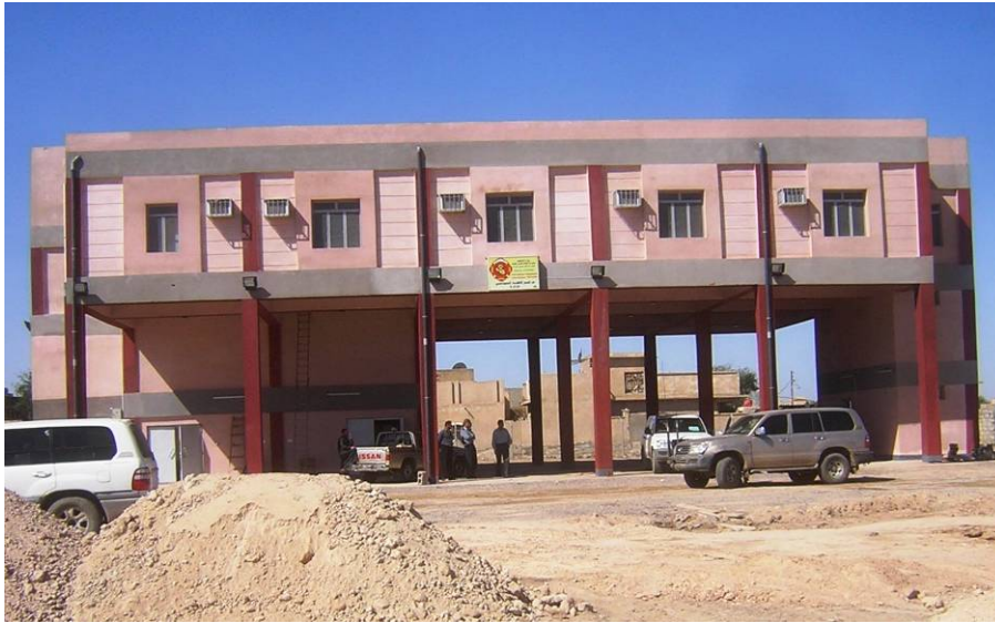
Site Photo 2. Fire station one month before turnover to Iraq Civil Defense Directorate

truck and SUV parking areas. However, based on the preferences expressed by the ICDD to remove the doors from the scope of work, the USACE opted for an “open” parking area as seen in Site Photo 2.