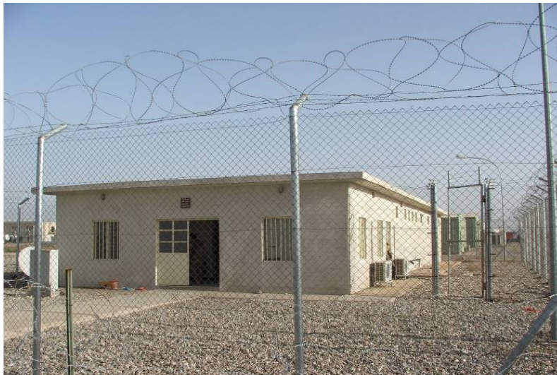
Site Photo 24. Jail facility

During the assessment, we visually observed the outside of the jail facility (Site Photo 24). The design and the construction of the jail were complete. The jail was in-use at the time of the assessment and therefore the assessment team did not have the opportunity to examine the inside or outside of the facility close-up. Instead, the assessment team reviewed the contractor's during and after construction photographs to determine whether the jail met the intent of the contract's requirements. It appears the jail did meet the specifications of the design.