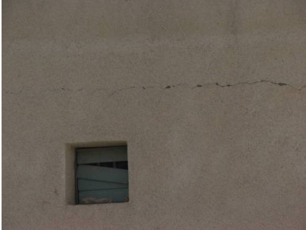
Site Photo 32. Crack in exterior stucco wall