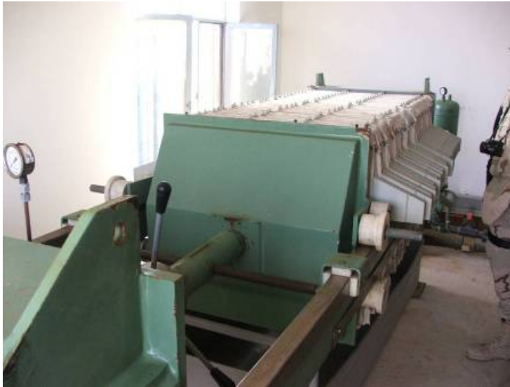
Site Photo 4. Filter press for waste water treatment plant