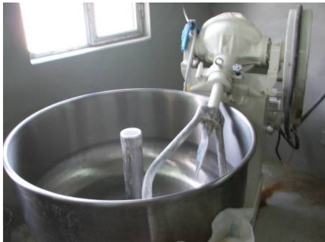
Site Photo 28. Mixer used in bakery

In order to provide the Iraqi Army soldiers with fresh bread, a bakery was designed and constructed. The contractor furnished the bakery with industrial sized equipment, such as a mixer (Site Photo 28) and oven (Site Photo 29).