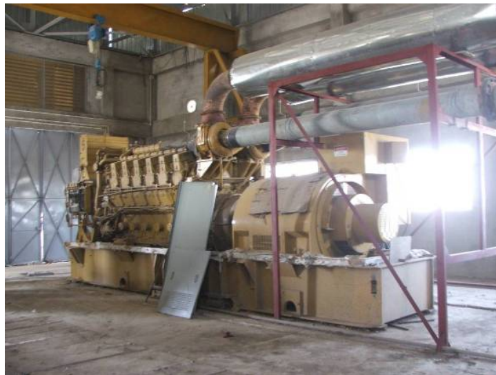
Site Photo 30. 2.5 MW Electrical generator provided as government furnished equipment

We observed warranty items, such as cracks in the exterior stucco walls (Site Photo 32), which need repair.