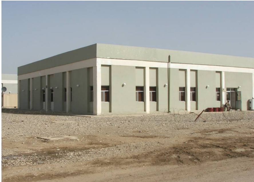
Site Photo 19. Outside of dining facility building

dining facilities, as shown in Site Photo 22. The dining facilities were in use for their intended purpose during the site assessment.