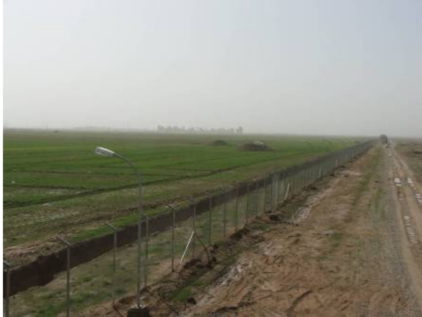
Site Photo 8. View of fence and trench from observation post