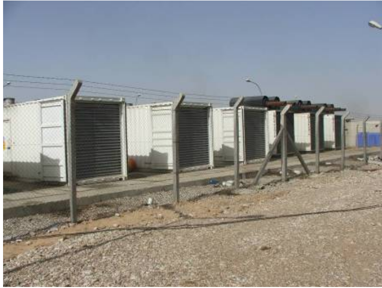
Site Photo 12. Eight 1MW electrical generators

Underground utilities appeared adequately installed and were functional. The contract required the burying of the utility lines. After reviewing the contractor's construction site photographs and performing our own visual inspection, the lines appeared to meet the contractual requirements.