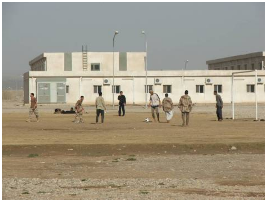
Site Photo 7. Iraqi soldiers using soccer field