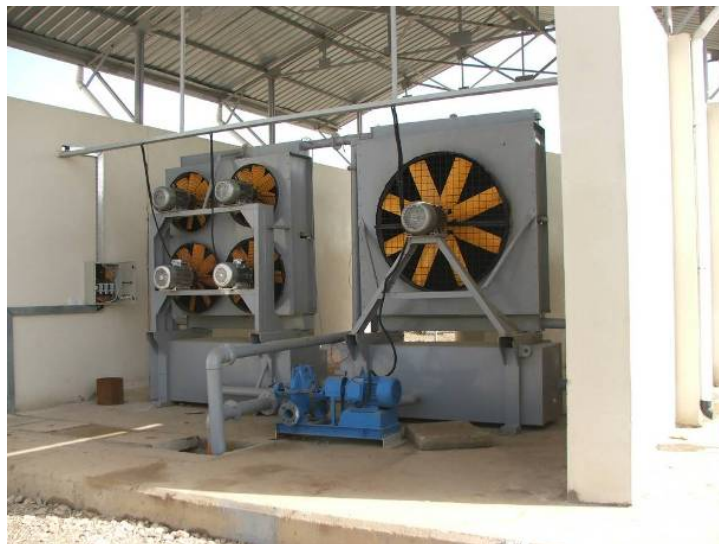
Site Photo 31. Generator building cooling system