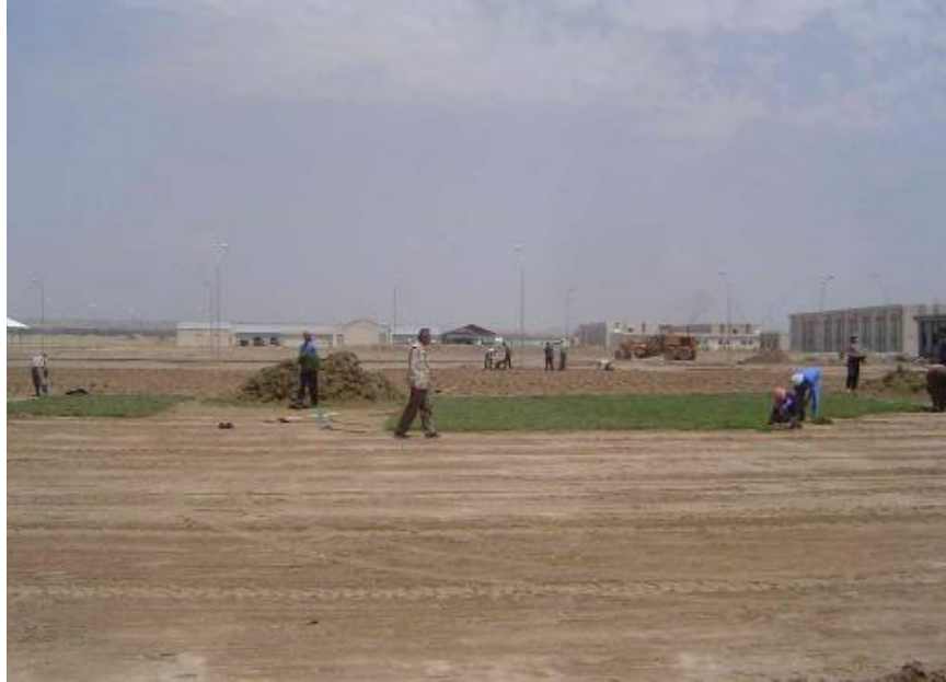
Site Photo 6. Soccer field under construction