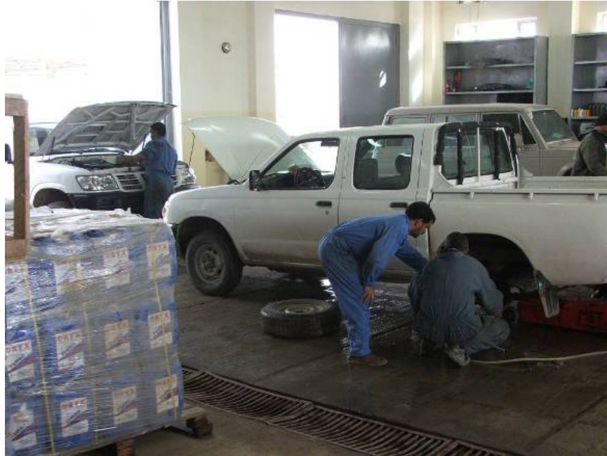
Site Photo 15. Six bay maintenance facility in use