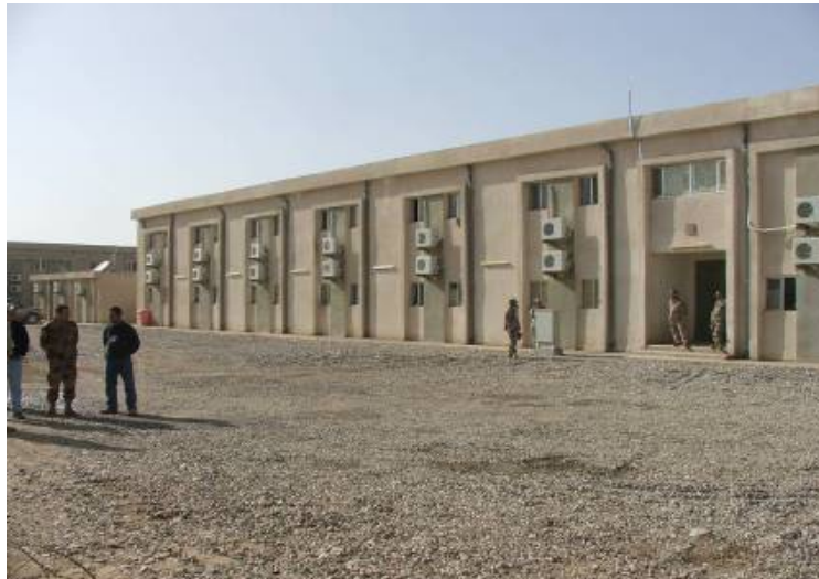
Site Photo 17. Exterior view of enlisted barracks

The barracks appeared to meet the requirements of the contract. We observed lighting, fans, electrical outlets, laminated glass windows, fire alarm and air conditioning systems, which appeared to be functional and meet contract requirements. Site Photos 17 and 18 show the outside of the barracks and a bunkroom in the enlisted barracks.