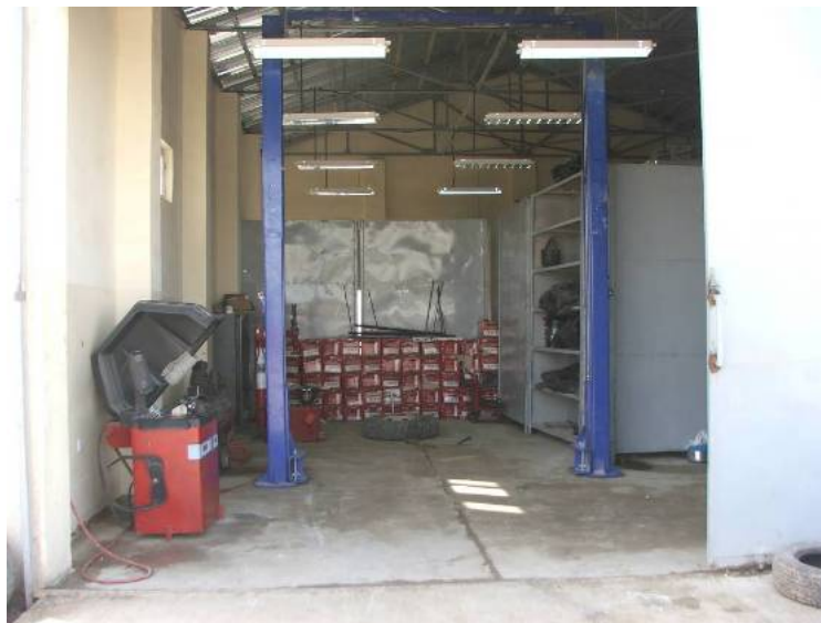
Site Photo 16. Maintenance shop bay