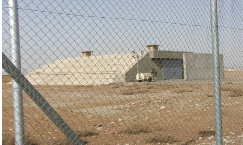
Site Photo 10. Ammunition supply point