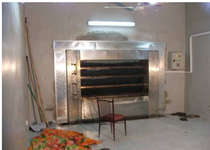
Site Photo 29. Oven in bakery