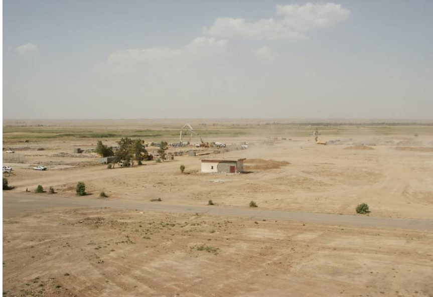
Site Photo 1. Preconstruction location of future 2 nd Brigade Base