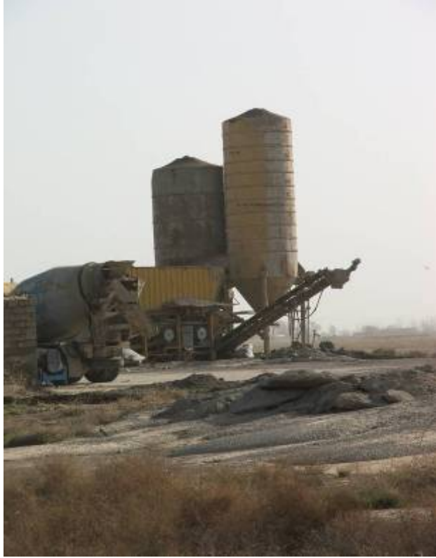
Site Photo 33. One of the remaining on-site concrete batch plants