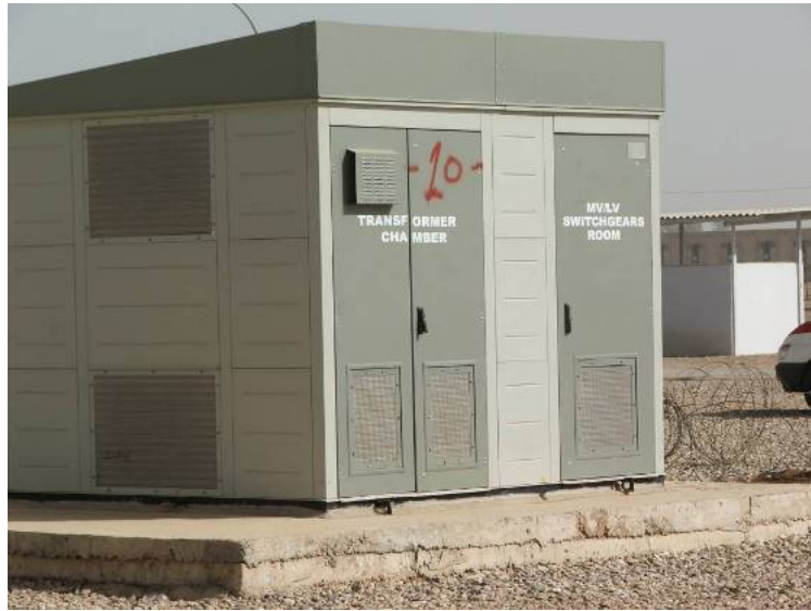
Photo 13. Electrical transformers and switchgears