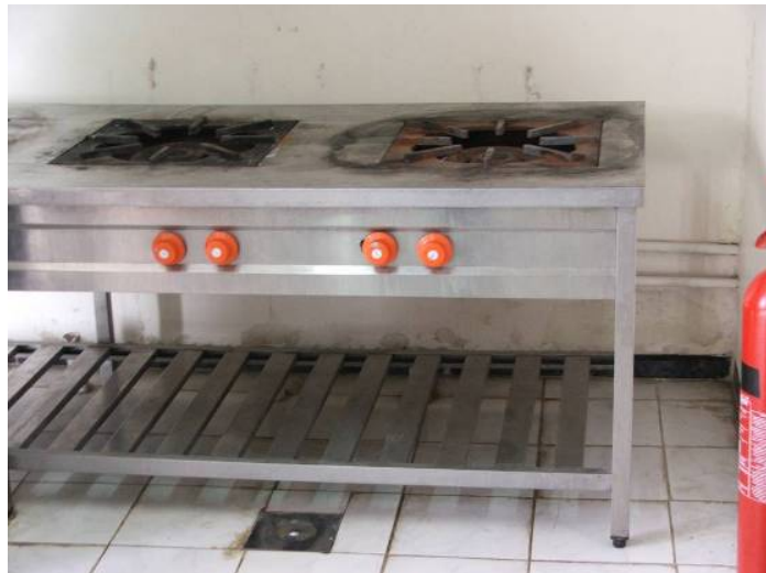
Site Photo 22. Propane stove in dining facility