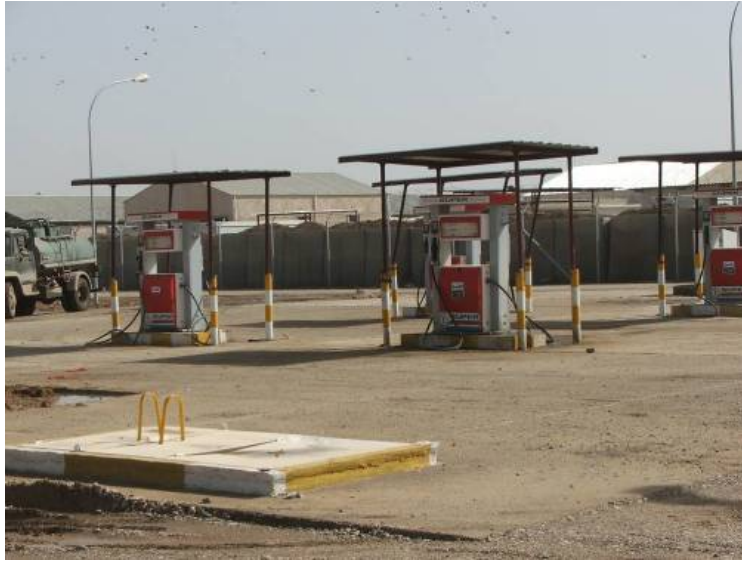
Site Photo 25. Gasoline station

gasoline pumps, and two underground tanks. The gasoline station appeared to meet the specifications of the design and to be well constructed.