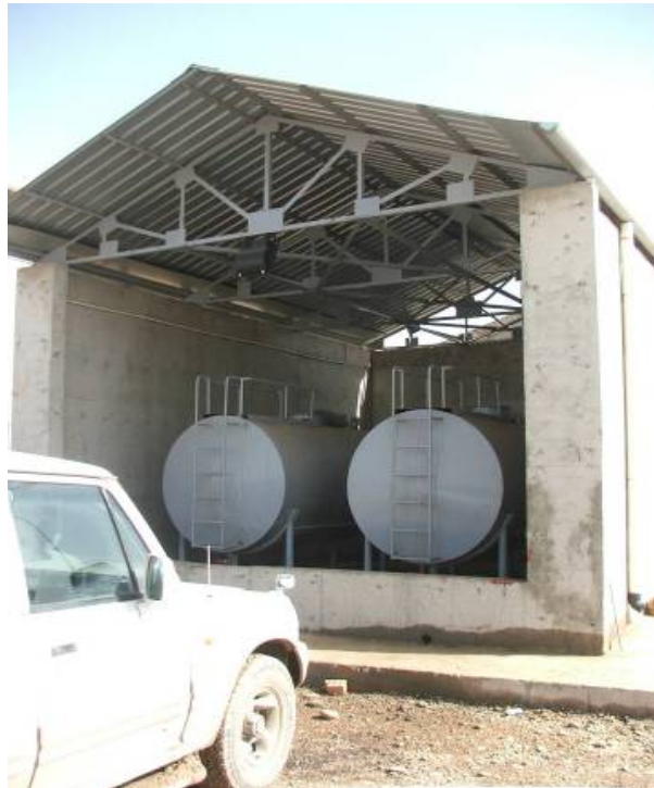
Photo 14. Central fuel supply