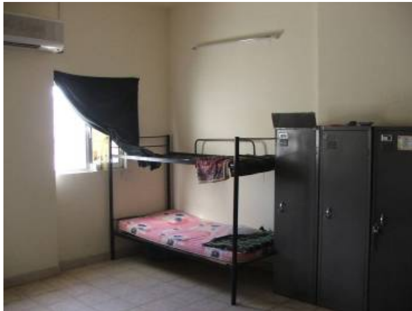
Site Photo 18. Sleeping quarters of enlisted barracks