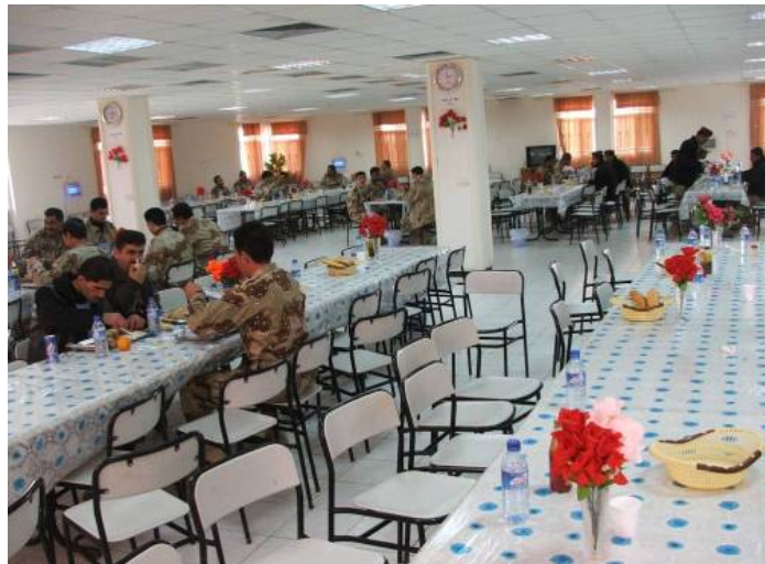
Site Photo 20. Dining facility in use