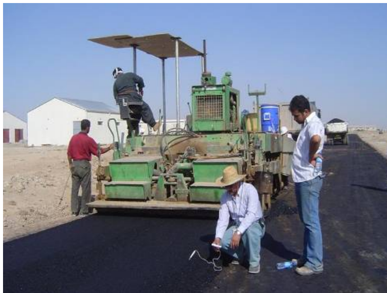
Site Photo 5. Asphalt road under construction

The asphalt roads, concrete sidewalks, parking areas, gravel pads, parade grounds, and soccer fields appeared to meet the contract requirements and were in-use.