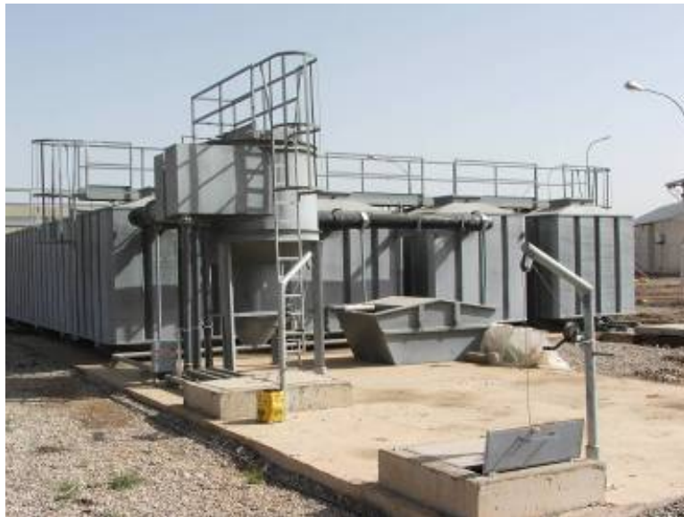
Site Photo 2. Waste water treatment plant

At the time of the assessment, the selection and fabrication of the wastewater treatment system was complete and the system was in-use (Site Photo 2). The treatment system used physical, biological, and chemical processes to purify the water before discharge. Site Photos 3 and 4 show the flow diagram and a filter press for the wastewater treatment plant, respectively. The wastewater treatment plant appeared to meet the contract requirements.