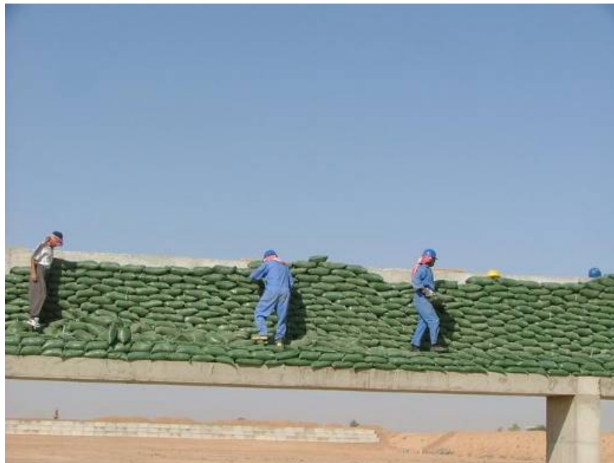
Site Photo 11. Small arms range baffle under construction

At the time of the site assessment, the design and construction of three small arms ranges was complete. A TO modification required the use of a baffle system designed to minimize ordnance from being fired over the firing range backstop. We observed the small arms ranges constructed with baffles so that projectiles could not go over the backstop berms. Site Photo 11 shows one of the small arms ranges and baffle system. The lower section of the picture is the target area and berm with Iraqi workers installing green sandbags on the concrete baffle.