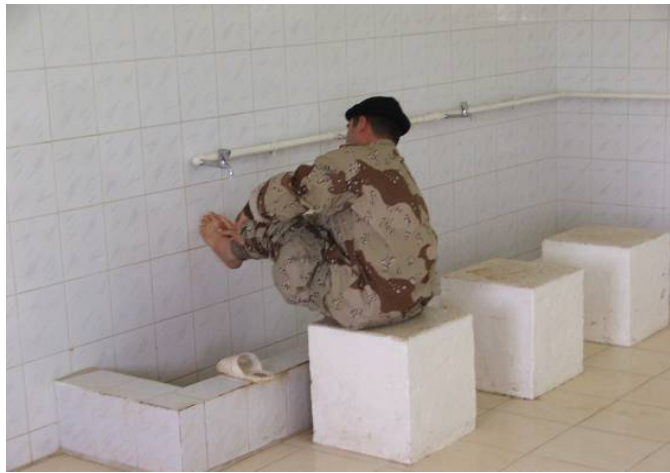
Site Photo 27. Restroom next to the mosque