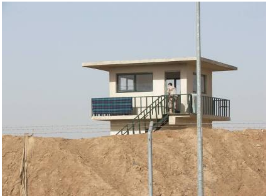
Site Photo 9. Observation Post