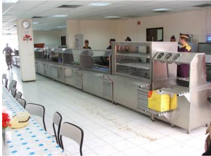
Site Photo 21. Dining facility food line