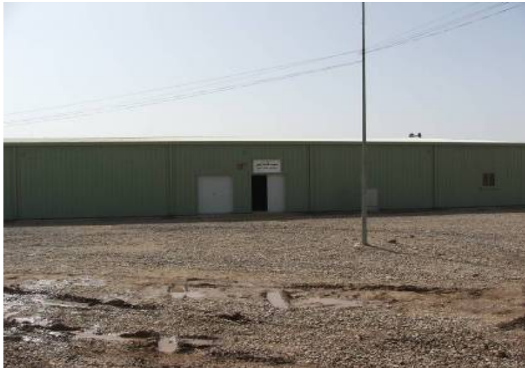
Site Photo 26. Front view of mosque

At the time of the assessment, the mosque design and construction were complete and the mosque was in-use (Site Photo 26). The SORS required the mosque comply with local customs. In keeping with local Iraqi tradition of not entering the mosque with dirty feet, the contractor provided a separate restroom next to the mosque, which allowed the Iraqi Army soldiers the opportunity to wash their feet prior to entering the mosque (Site Photo 27). It appears the mosque did meet the specifications of the design.