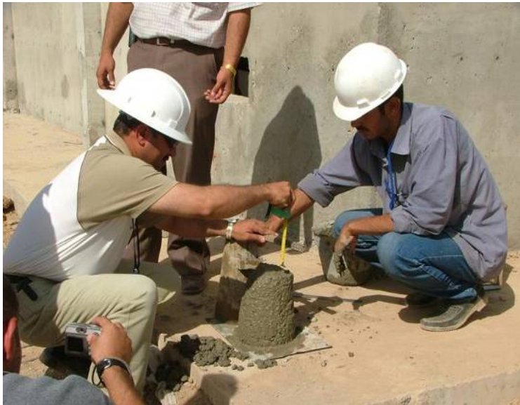
Site Photo 34. Field QC testing during construction