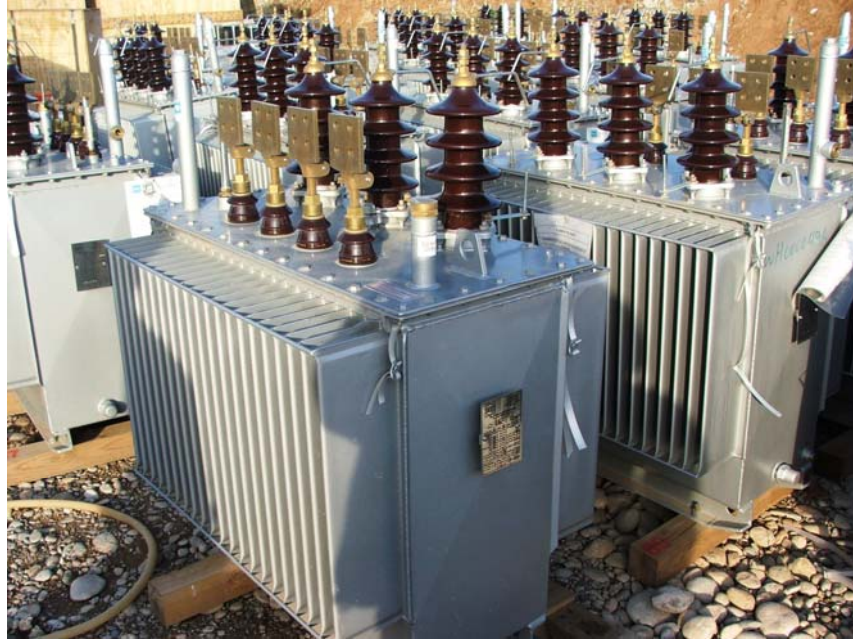
Site Photo 10. 11kV - 400V/230V transformers at contractor's storage facility

In addition to Hasarok, the assessment team also visited the contractor's material storage facility located in another area in Erbil. There, we viewed the remaining transformers as seen in Site Photo 10. We examined transformer factory plate data, and verified that the transformers met contract requirements.