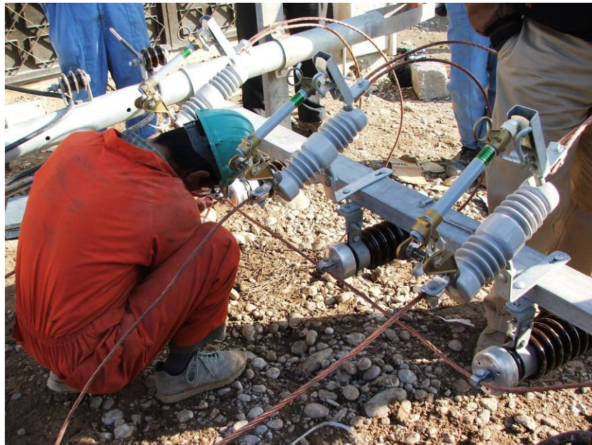
Site Photo 9. Preparing fuse cutouts on H-Pole prior to setting

During our site visit, the contractor was preparing one H-pole on the ground prior to setting it in place. Site Photo 9 shows the contractor working on the three fuse cutouts. The contractor at that time was also tying off the insulated low voltage cable to each of the two sides of the H-pole.