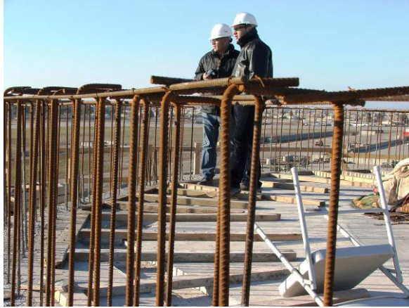
Site Photo 6. ATC tower concrete base

At the time of our site visit, the reinforced concrete base supporting a portion of the tower cab including the walkway was in place, but the cab had not yet been installed. Site Photos 6 and 7 show the concrete base for the tower cab and the walkway that will circle the cab. The reinforcing steel shown in each picture is part of the 1 m high reinforced concrete base that will support another part of the tower cab.