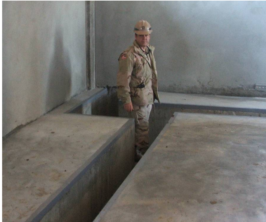
Site Photo 12. Recessed cable raceways in the substation

The floor plan included a room for electrical switchgear, as well as separate rooms for controls, a transformer, and a generator. To accommodate the placement of electrical cables and connection to equipment, recessed raceways were located in the concrete floors. Site Photo 12 shows the raceways.