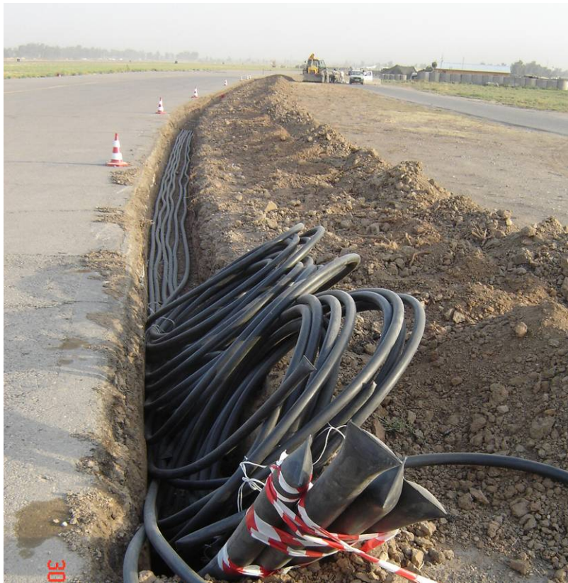
Site Photo 15. Conduit installation for NavAids – Photo provided by USACE

The luminaries for taxiway and runway edge lighting were required to be installed onto breakaway mountings. The design also required the electrical cable connecting the lights and other NavAids to the power source to be encased in PVC conduit. Site Photo 15, provided by the USACE, shows the trenching and PVC conduit installation for various NavAids, including taxiway edge lighting.