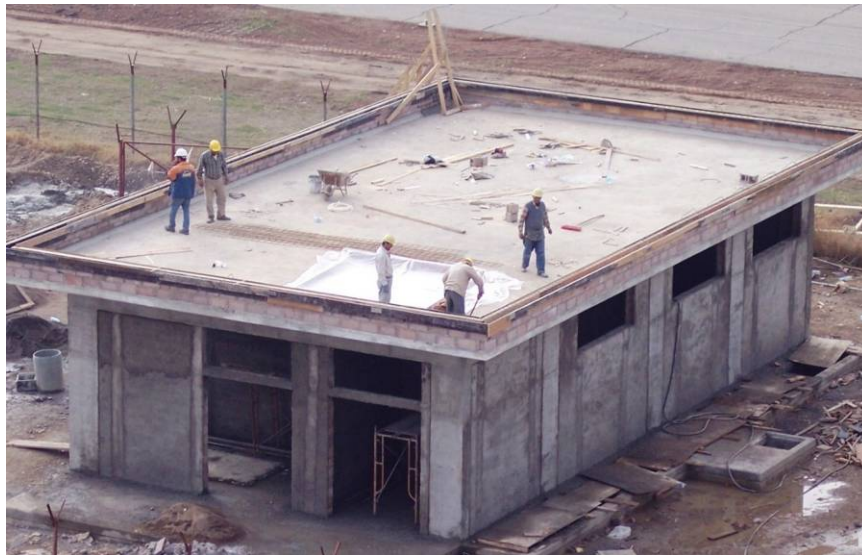
Site Photo 11. Substation 1 during construction

The same building design was utilized for each substation. The substations were designed as a single level, 8.8 m by 16.5 m rectangular reinforced concrete structure with exterior and interior concrete block walls as shown in Site Photo 11.