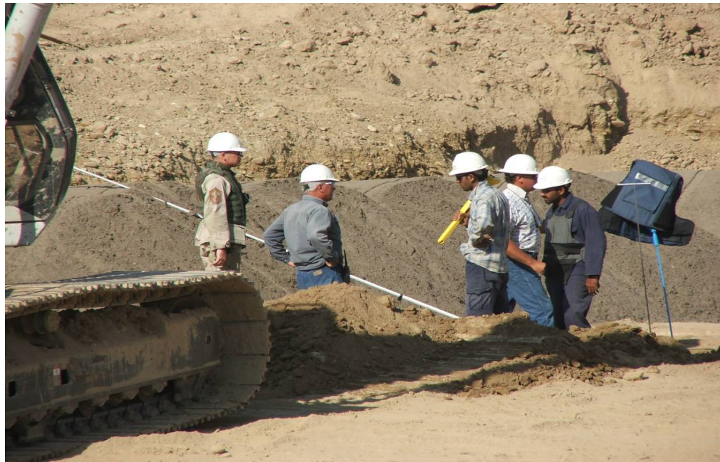
Site Photo 9: Government Construction Representative and Contractor Supervisors Assessing the Source of a Liquid Petroleum Gas Smell