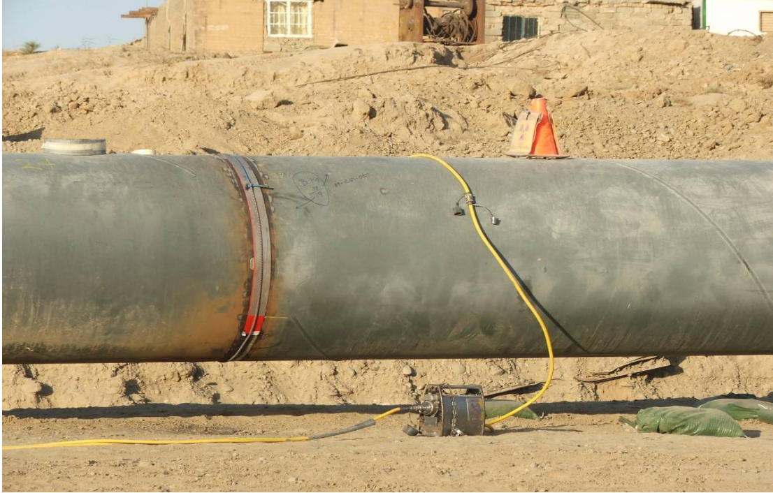
Site Photo 6: Radiography (x-ray) Test In Progress on 40"Pipe Weld