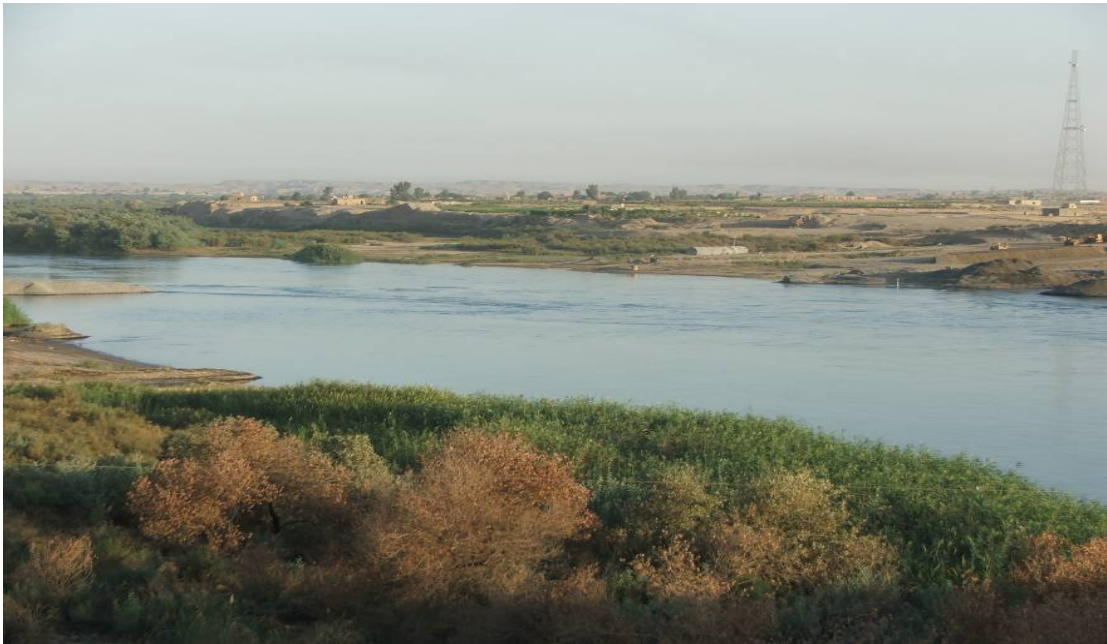
Site Photo 1: Al Fatah Tigris River Crossing

Photo 2 shows the excavation of the Kirkuk Manifold site. The excavation appears consistent with design requirements.