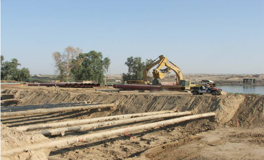
Site Photo 3: Excavation of Baiji (west side) manifold site

are existing pipelines that were not part of this project. The excavation appears consistent with design requirements.