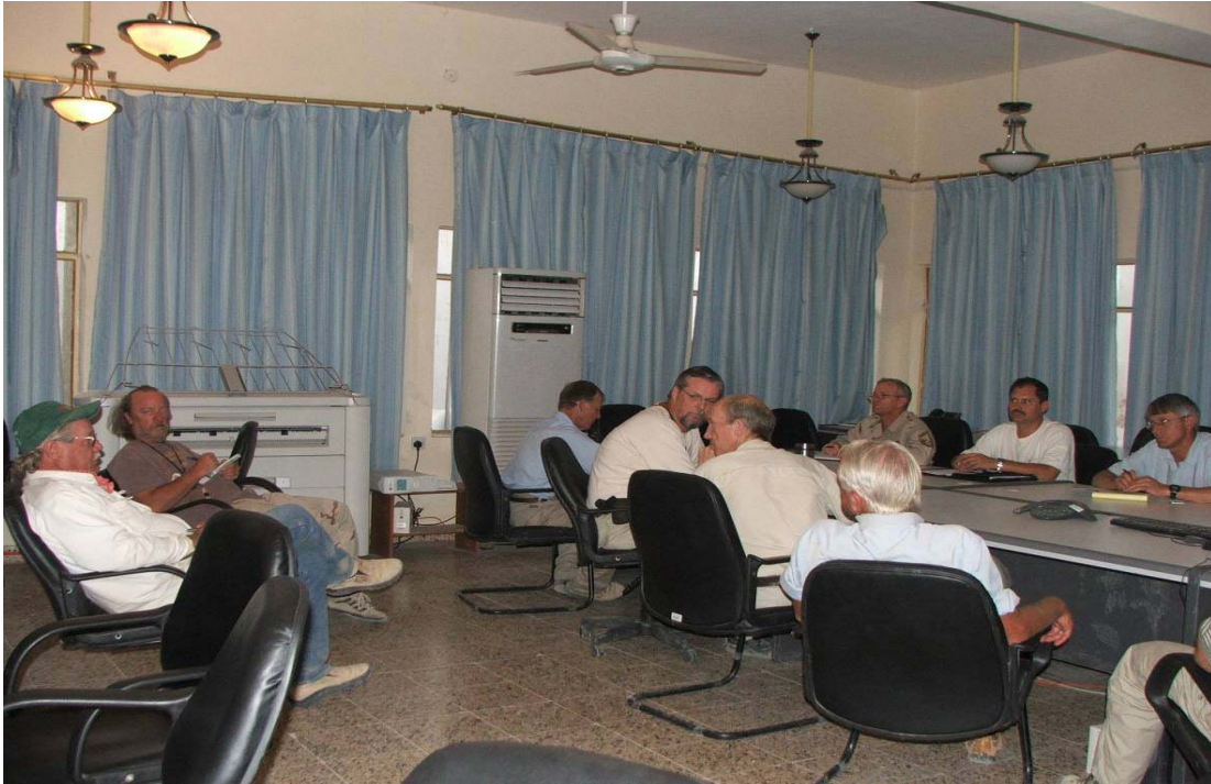
Site Photo 10: Participants listen to the Welding Supervisor's Daily Report