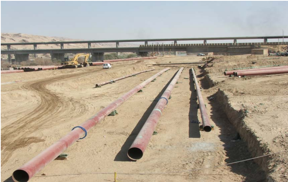
Site Photo 5: Pipelines to be connected to the Baiji Manifold