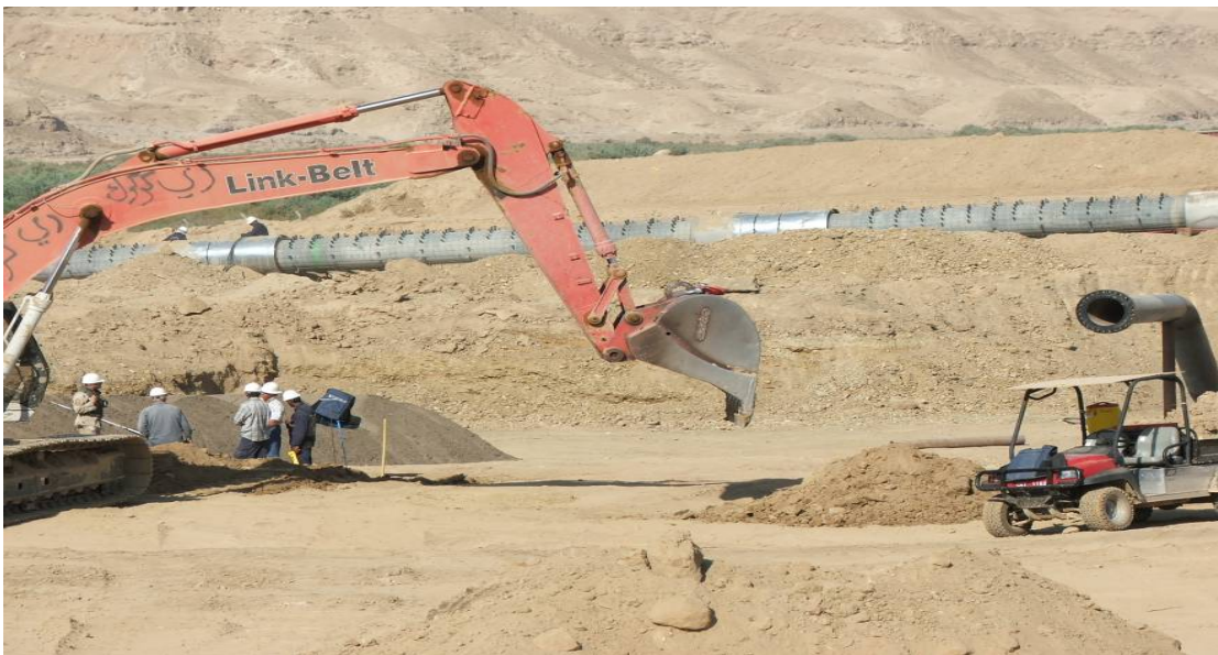
Site Photo 2: Excavation of Kirkuk (east side) Manifold Site

The design dimensions for the Baiji Manifold Vault are 19 m long and 5.2 m wide. The surface of the vault is to be approximately 4.5 m above the lower surface of the pipelines after pipeline placement. During the site visit, the assessment team verified that the excavation of the Baiji Manifold site was nearly complete. Site Photo 3 shows the excavation of the Baiji Manifold site. The pipelines shown in Site Photo 3