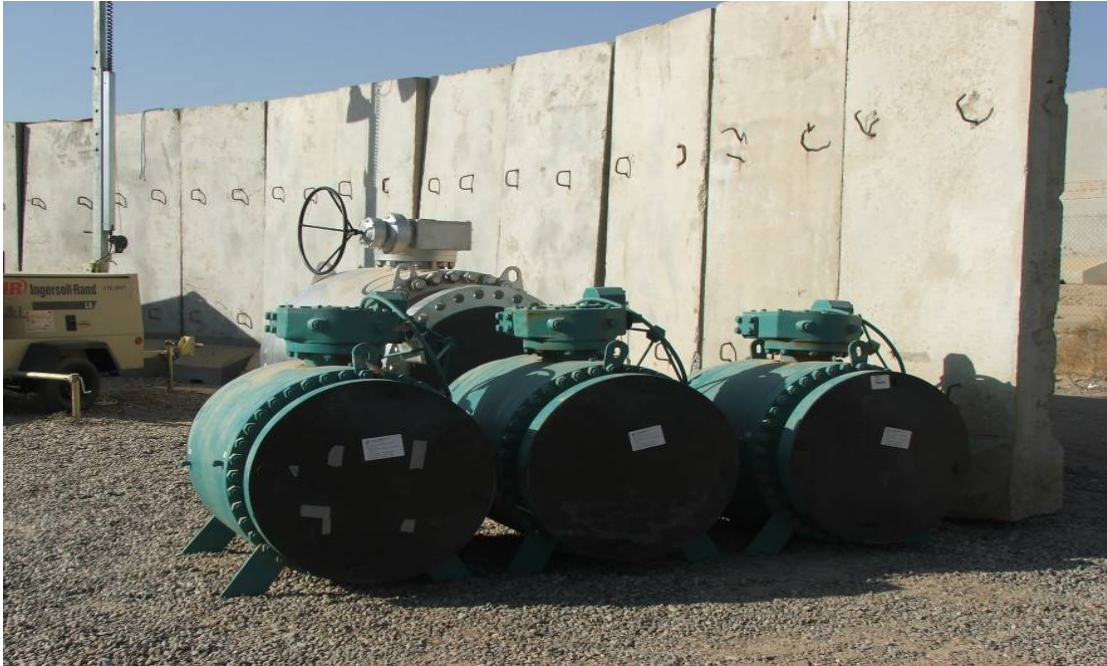
Site Photo 4: Pipeline Valves to be used for Manifold Construction