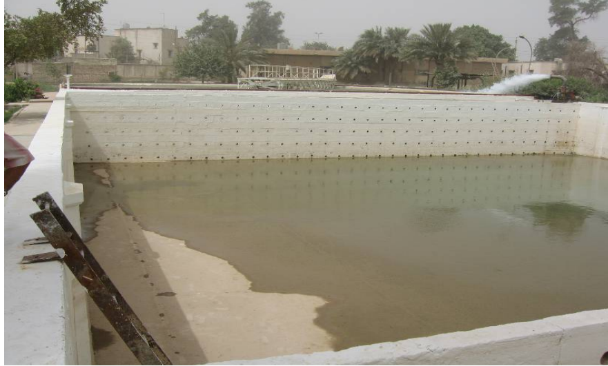
Site Photo 2: Train 1 settling tank – drained