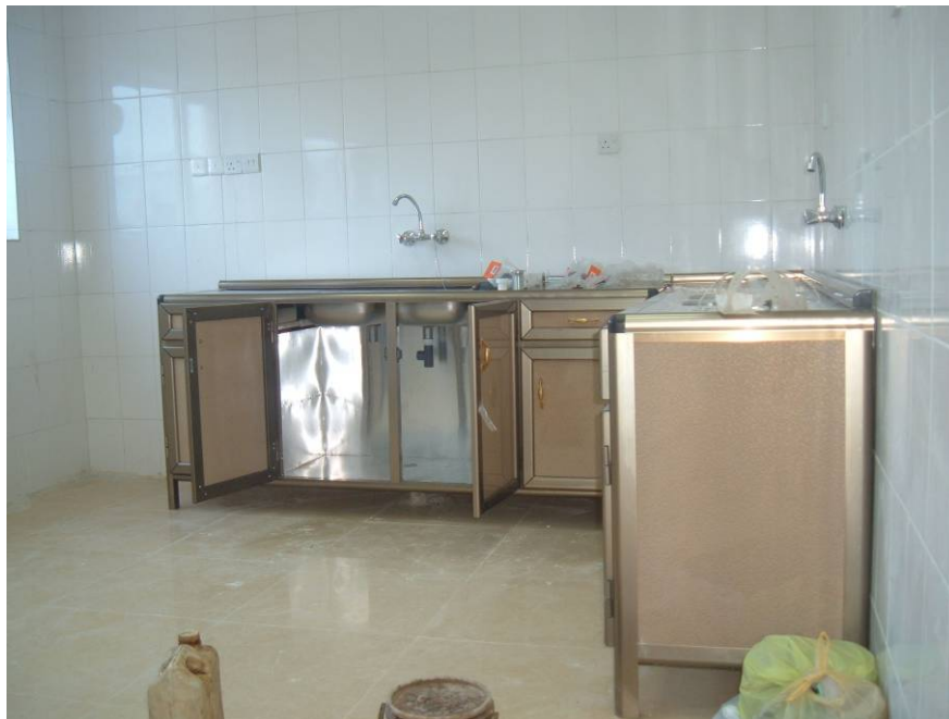
Site Photo 7: Admin/Lab building – interior lab room