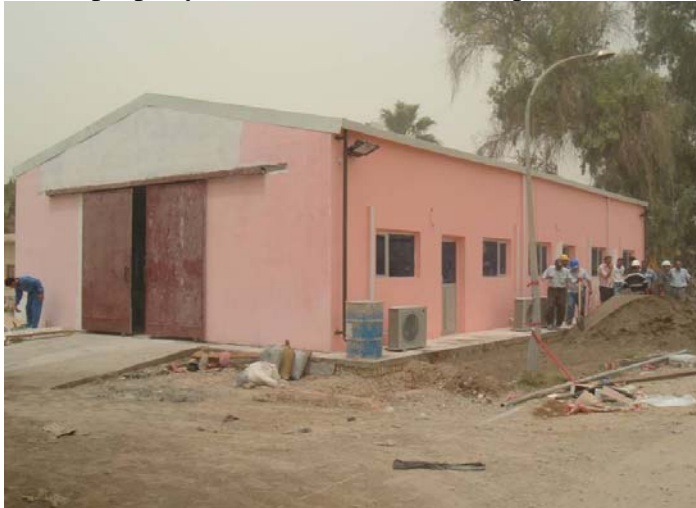
Site Photo 6: Admin/Lab building – new construction

The original SOW called for a new administration building for office and laboratory space. Our site assessment determined that construction was almost complete (Site Photos 6 & 7). Construction, mechanical, and electrical tasks had been completed, with only minor cosmetic work remaining. Final work required to complete the building was being accomplished at the time of our site visit. The building appeared to be constructed properly and to meet task order specifications.