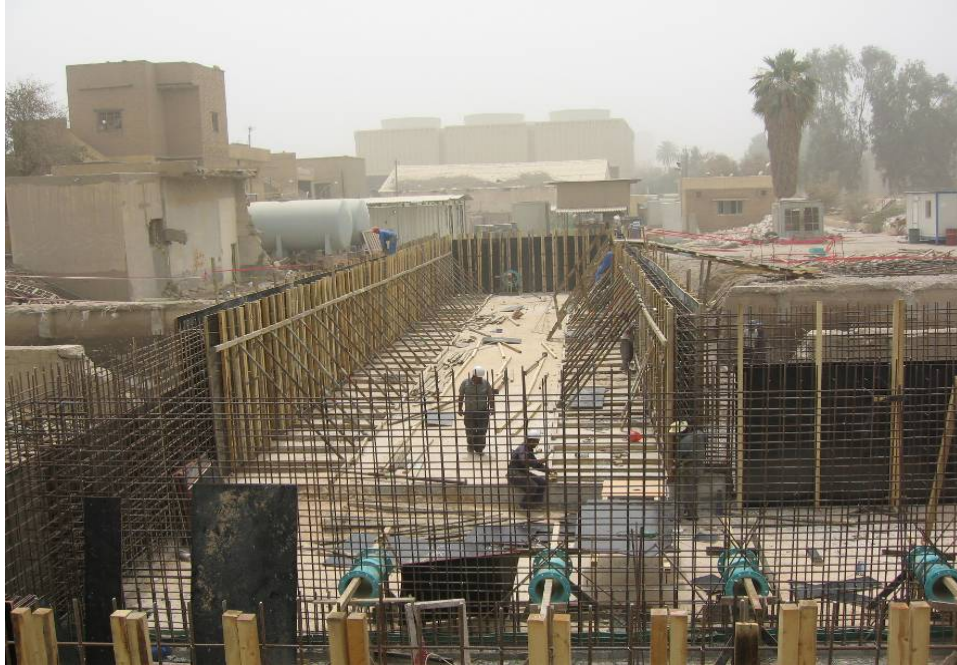
Site Photo 8: Filter building concrete form and re-bar placement (Wet well foreground – dry well background)