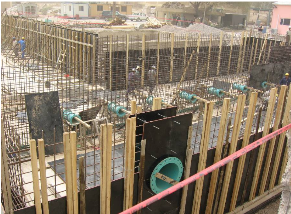
Site Photo 9: Filter building concrete form and re-bar placement (Wet well foreground – dry well background)