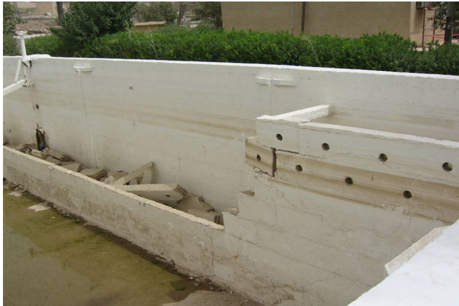
Site Photo 3: Train 1 settling tank showing collapsed effluent weir wall