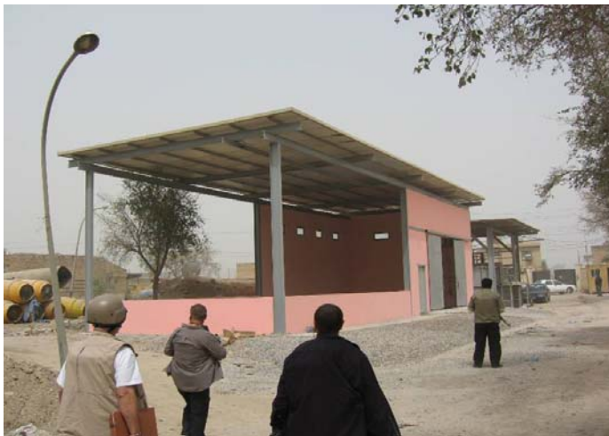
Site Photo 5: Chemical building – new construction

The original SOW called for an 18.3 meter (m) by 9.2 meter new chemical building to house the new alum system equipment and storage for a 10-day supply of alum. The site assessment disclosed that the construction of the chemical building (Site Photo 5) had been completed. The concrete floor of the building was observed to have a rough uneven surface which may be attributed to the concrete setting up before finishing could be completed. The building appeared to be constructed properly and to meet task order requirements; however, the quality of the concrete could not be verified.