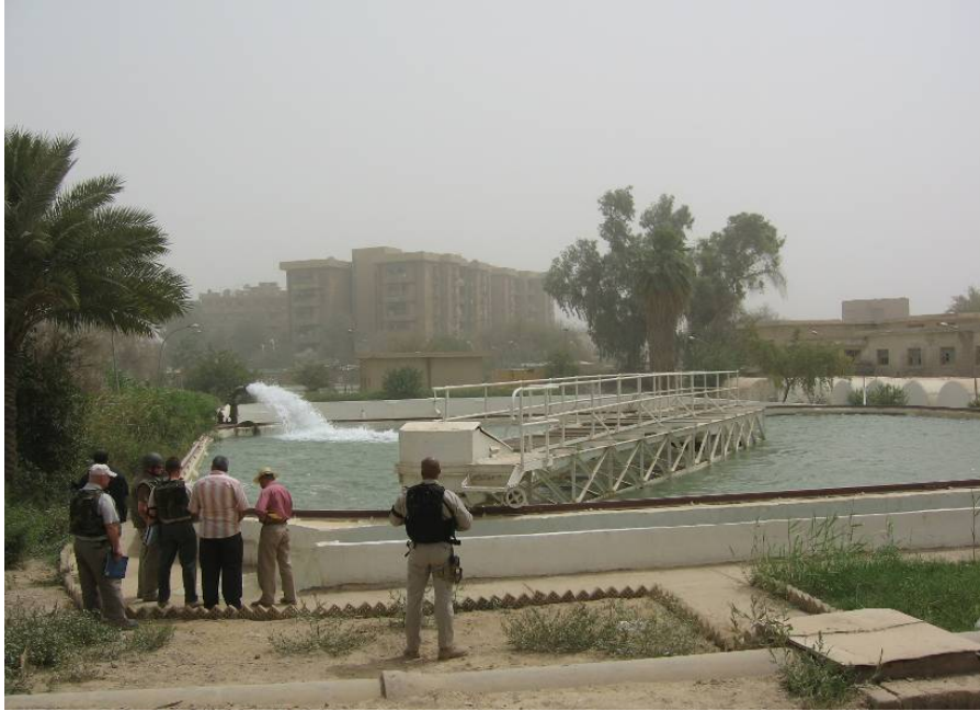
Site Photo 1: Train 1 clarifier tank

FluorAMEC, LLC Project Manager confirmed that the clarifier tank was cleaned but not sealed because of plant operational shutdown issues and stated that the sealing of the cracks was no longer planned as part of this project.