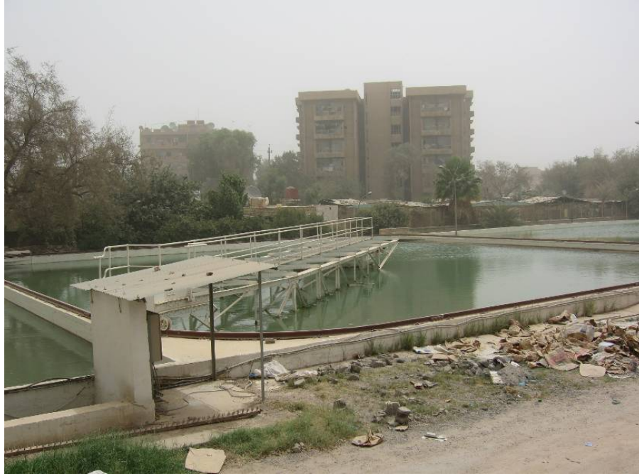
Site Photo 4: Train 2 clarifier tank (foreground) & settling tank (background)