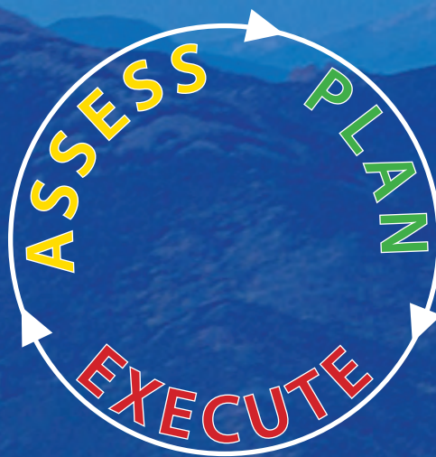
Figure A-1 – Academy Strategic Planning Process

The strategic plan drives the Academy's budget submission and serves as a guide in responding to current year budget cuts and internal resource changes and realignments. The body of initiatives our mission elements develop to achieve our strategic objectives will serve as the Academy's campaign plan.