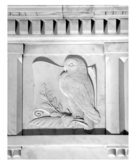
15. Owl Wisdom and Meditation