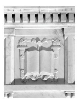
7. Book & Torches Education and Knowledge