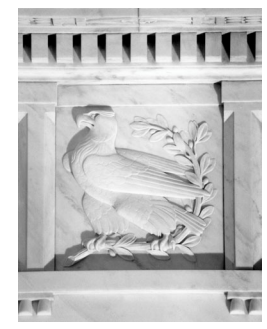
14. Eagle Bird of Freedom; Superiority and Swiftness