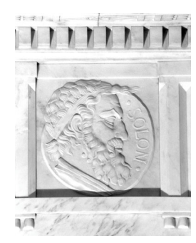
12. Solon Athenian Lawgiver and One of Seven Sages of Greece