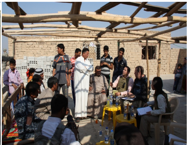
Interview with community leaders and villagers in Al-Zuhoor Village, November 18, 2010.