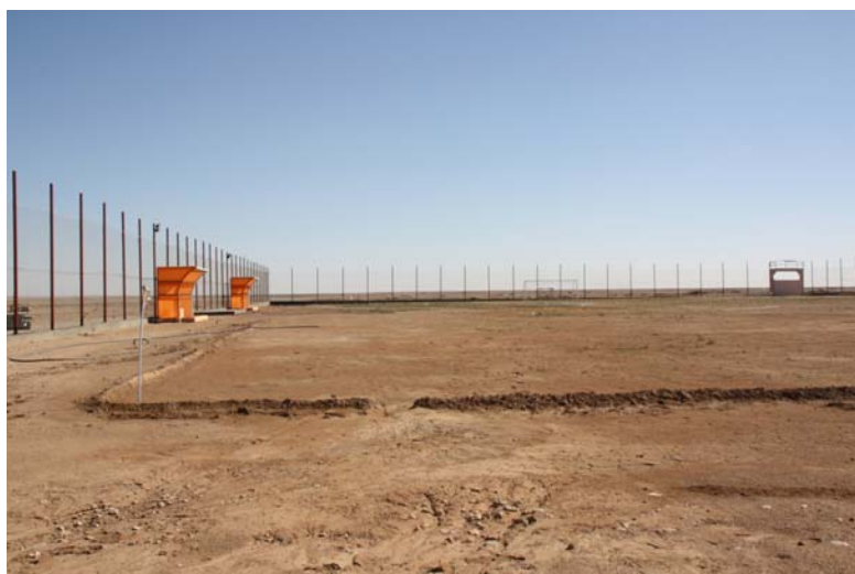
Figure 3—Football (Soccer) Stadium in Anbar Completed under the CAP III

Source: SIGIR, photo taken on February 3, 2011.