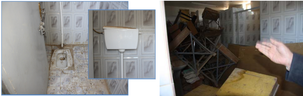
Figure 4—Pictures of a School in Anbar Paid with CAP III Funds, as of February 2011

As a result, some of the projects may not be adequately maintained after CHF and USAID leave. For example, in February 2011 SIGIR visited a school in Anbar province (project #2 in Table 6), which was completed in August 2009. We found that although the school is being used as intended, it did not have working electricity or running water. According to notes from CHF’s Monitoring and Evaluation Unit, the Education Directorate was responsible for the school’s maintenance, but we found no agreement in the file. The project files show a “project site delivery form” was signed by CHF personnel, community members, the contractor, the school principal, and an Education Directorate representative agreeing that the project had been completed. None of the documentation shows evidence of an explicit understanding or agreement of who would be responsible for long-term sustainment.