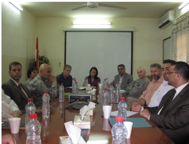
Interview with Governor of Babil, October 20, 2010.