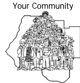
Select one or just few of its many needs!

2) Remember that Congress has already declared that the PNS categories represent "national problems of local concern." Your needs statement should concentrate on describing how your project can help meet the need(s) you select in your local community , based on local data, quotes from authoritative local sources, etc.