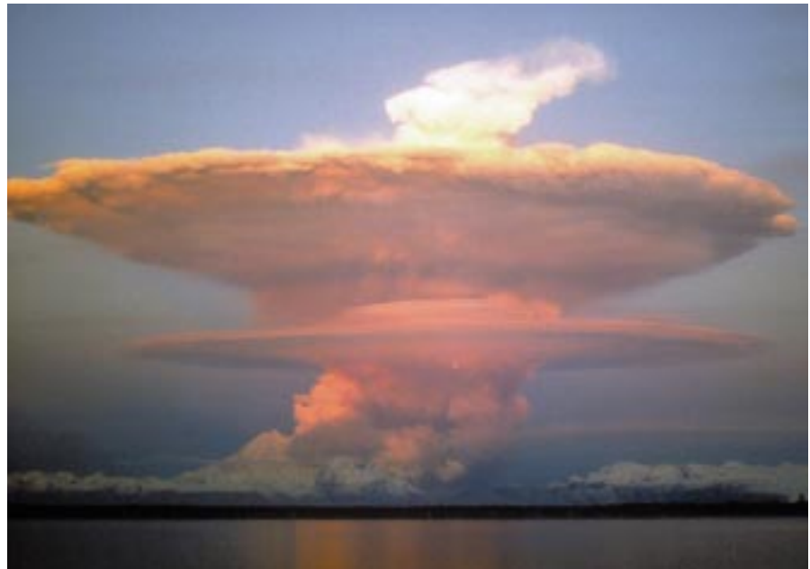
During a 1989–90 series of eruptions, Redoubt Volcano, Alaska, spewed enormous clouds of ash. Ash blown from this volcano on December 15, 1989, nearly caused a 747 jetliner (KLM Flight 867) carrying 231 passengers to crash. Partly in response to this near-fatal incident, the U.S. Geological Survey organized the first International Symposium on Volcanic Ash and Aviation Safety. This 1991 conference in Seattle, Washington, focused attention on ways to reduce the risk volcanic ash poses to the world's rapidly increasing air traffic.

The world's busy air traffic corridors pass over hundreds of volcanoes capable of sudden, explosive eruptions. In the United States alone, aircraft carry many thousands of passengers and millions of dollars of cargo over volcanoes each day. Volcanic ash can be a serious hazard to aviation even thousands of miles from an eruption. Airborne ash can diminish visibility, damage flight control systems, and cause jet engines to fail. USGS and other scientists with the Alaska Volcano Observatory are playing a leading role in the international effort to reduce the risk posed to aircraft by volcanic eruptions.