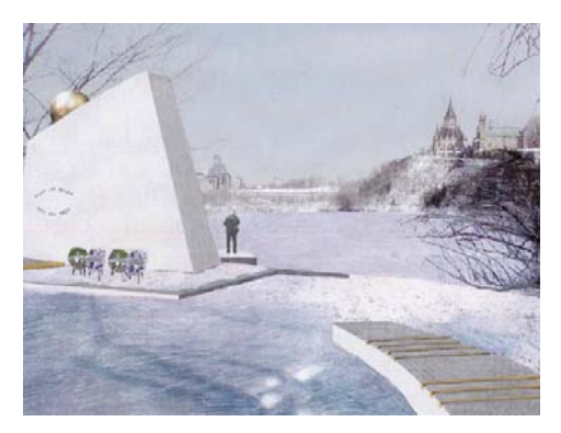
Winning design for the Navy Monument

The $1.5 million memorial will be located on the bank of the Ottawa River at the west end of Parliamentary Hill and is scheduled to be completed by May 2011.