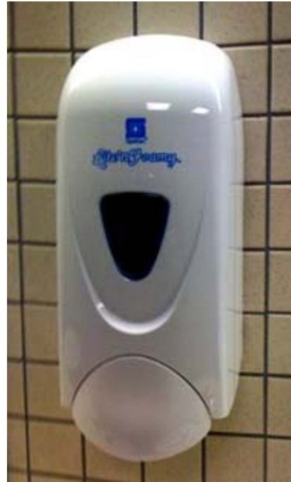
ABOVE: Boston Logan International Airport – Spotted in the women’s restroom and having 85% biobased content: Lite’n Foamy hand wash dispenser.

If you see a BioPreferred certified product while out and about, snap a picture and send to biopreferred@usda.gov . Please include your name and contact information, along with the location, date seen and product name.