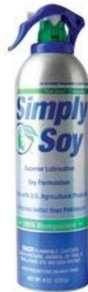
ABOVE: Simply Soy

BioPreferred is tweeting about biobased products, program news and industry topics. Visit the BioPreferred Twitter page and follow us.