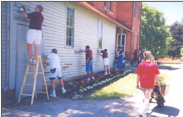
Volunteers work to preserve the Oberlin Heritage Center