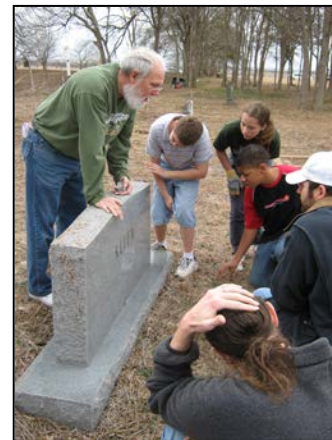
Texas Historical Commission RIP Guardian Program protects historic cemeteries