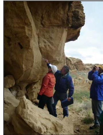
New Mexico SiteWatch volunteers record archaeological remains