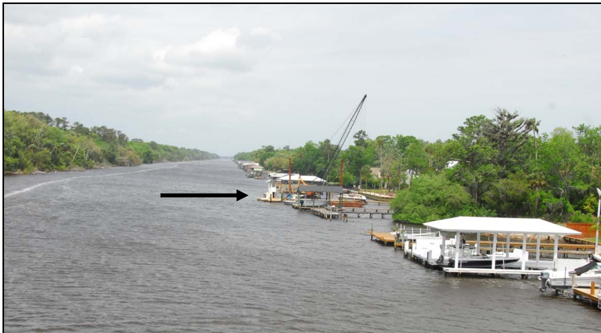
Figure 4. Photo of ICW looking north, showing residences with docks extending into east side of waterway. Arrow points to accident site and to push boat struck by recreational boat. At low tide, mudflats form along both shorelines. Two miles south of accident site, low tide was at 1909 on April 12.

On the east side of the cut, the shore is developed private property, while on the west side, the shore is mostly wooded and undeveloped. Many of the residences on the eastern shore have private docks that extend into the waterway (but not into the designated channel), similar to the dock under construction at the accident site (figure 4). The aerial photograph in figure 5 shows other docks extending into the waterway near the accident location, but because the photograph was taken before construction began at the accident site, the dock involved in the accident is not shown.