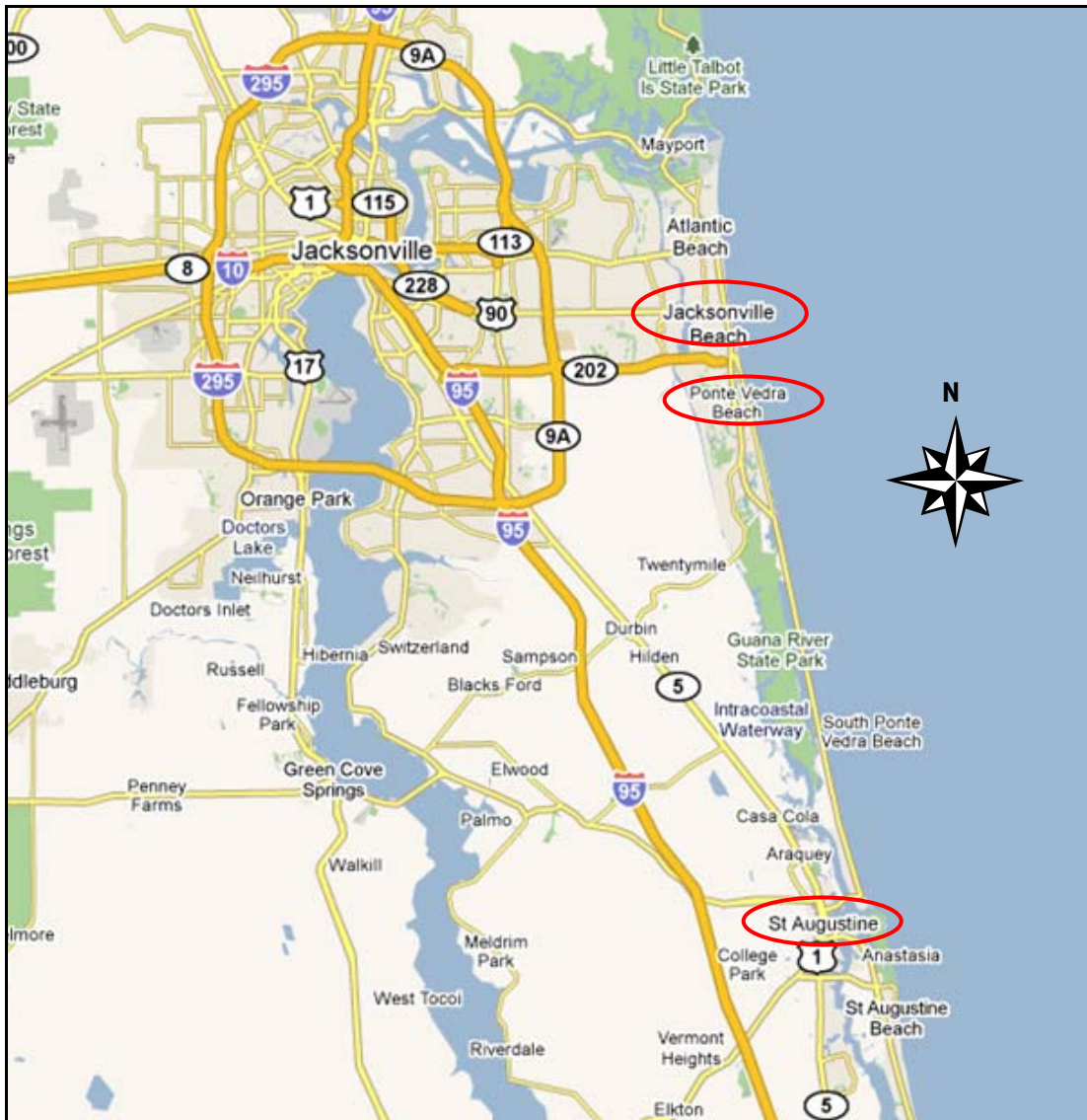
Figure 1. Map of central Florida highlighting Jacksonville Beach, Ponte Veda Beach, and St. Augustine.