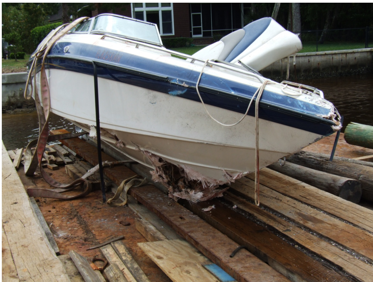
Figure 6. Photo of recreational boat after accident, showing structural damage to bow area.

Damage. The recreational boat came to rest with its bow out of the water and extending about 3 feet into the starboard side of the push boat's deckhouse (see next section). The boat sustained major structural damage to the stem of its bow just below the waterline and about 6 feet aft of the nose (figure 6). The damage extended to the wooden stringer system. Other hull damage consisted of scrapes and chips in the bow area.