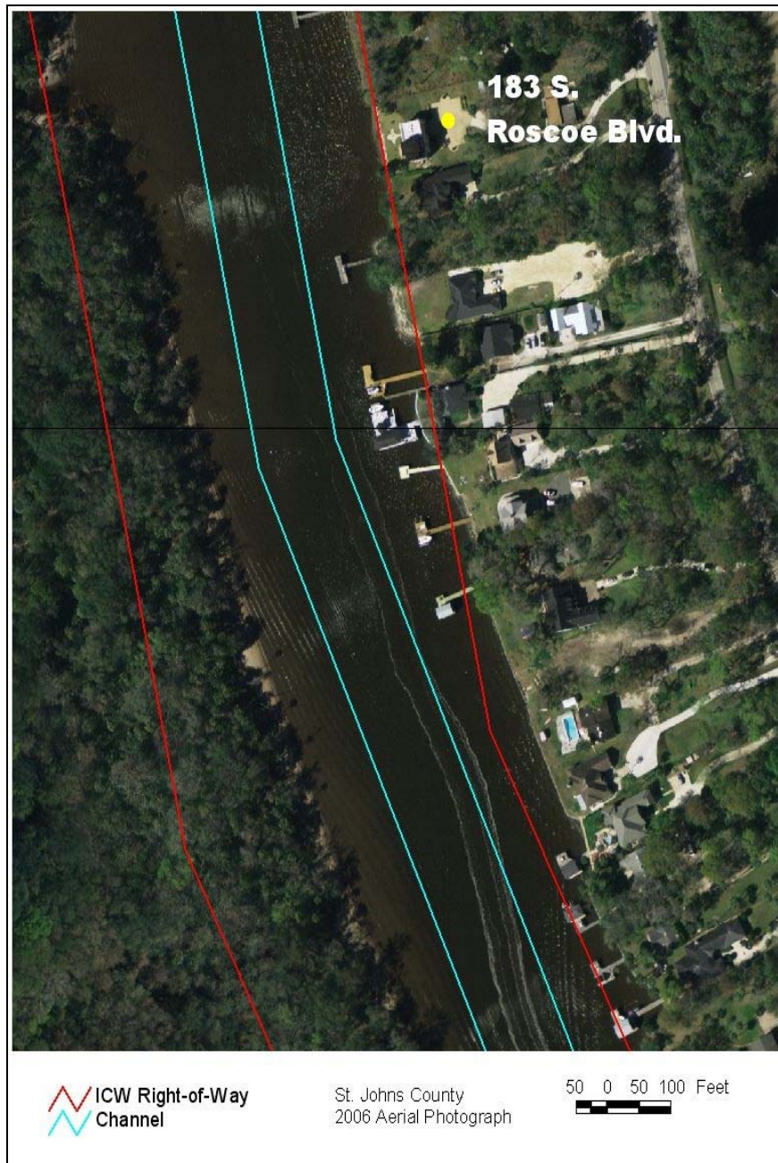
Figure 5. Aerial photograph of accident area in 2006. Shown are channel (light blue) and right-of-way (red) boundaries. Address printed on photograph (183 S. Roscoe Blvd.) is that of accident site.