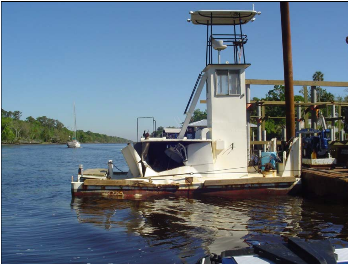
Figure 7. Photo of Little Man II after accident, showing damage to hull and deckhouse.

Damage. The Little Man II sustained damage to the starboard side of the hull and the enclosure for the engine space (figure 7). The initial point of impact by the recreational boat was about 15 feet aft of the push boat's bow. The damaged area on the starboard side of the push boat began about 10 feet aft of the bow and extended for about 15 feet. The hull sideshell was set in a maximum of about 10 inches over the length of the damaged area, and the deck in the area of the damaged sideshell was buckled upward. The 1/4-inch steel plating at the starboard side bulkhead of the deckhouse was buckled inward and torn loose where the bow of the recreational boat had entered the engine space, and several welded areas of vertical and horizontal joints of the plating were fractured. The vertical section of the exhaust pipe from the starboard propulsion engine was crushed and pushed aft several inches.