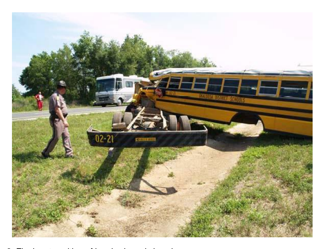
Figure 2. Final rest position of bus body and chassis.

coming to final rest. In addition, the bus body separated from the chassis at a point just beyond the engine unit rearward. (See figure 2.)