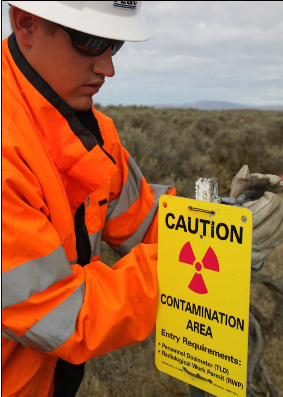
A worker secures a sign to indicate hazards and requirements at the BC Control Area. In Zone B of the 13-square-mile area, CHPRC is conducting radiological down-posting surveys and down-posting from radiological to contaminated areas where appropriate.