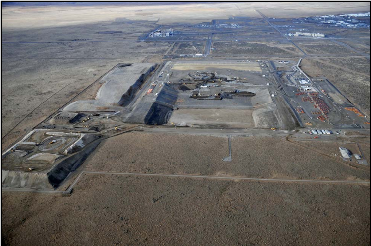
This aerial photo of the Environmental Restoration Disposal Facility was taken January 14. Excavation of super cell 9 is complete.