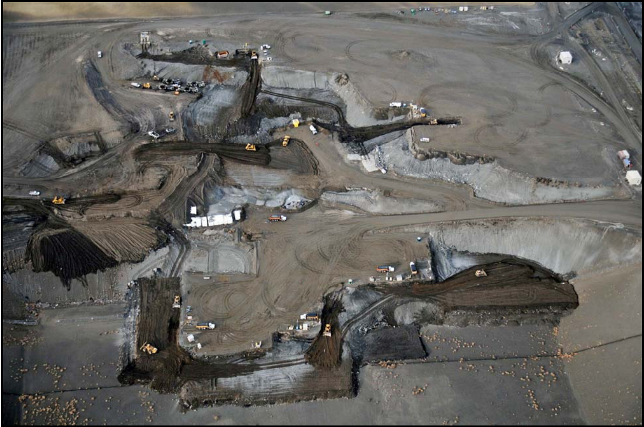
This aerial photo of cells 5 and 6 and cells 7 and 8 at the Environmental Restoration Disposal Facility was taken January 14.