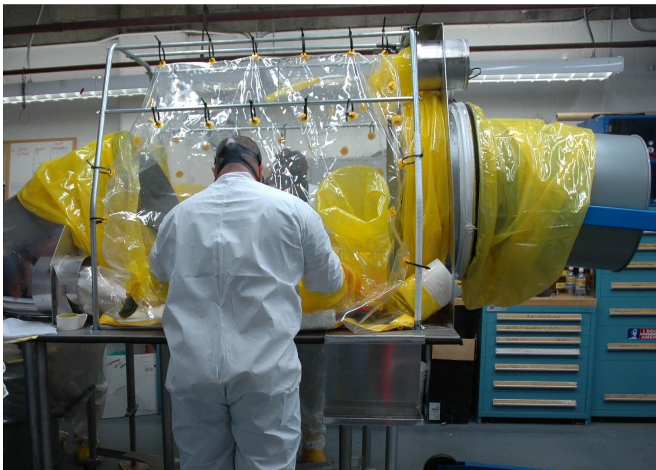
An NCO performs mock-up processing of waste in a glove bag. New NCOs were given an opportunity to work within the system in a clean environment without any chemical or radiation hazards present to better prepare themselves for the upcoming repackaging they will be performing.

By funding the hiring of more personnel, the Recovery Act support will allow the T-Plant Project and its repackaging activities to move forward at a much quicker rate than initially projected.