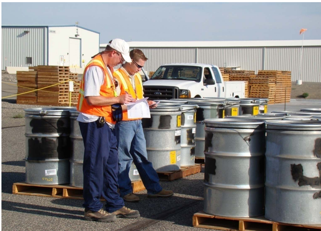
A CWC operator and Cavanagh Services Group (CSG) shipper inspect the marking and labeling of each waste package for the TSCA-LLW shipment.

The recent shipment of TSCA-LLW consisted of three boxes and 58 drums that have been in storage at the Central Waste Complex (CWC) since the late 1980s and contained miscellaneous debris components that contain or were suspected of containing PCBs. Without financial support from the Recovery Act, removing this and other stored TSCA-LLW waste would not have become a priority until 2013, with an estimated completion date around 2015, in addition to limited funding and several jobs lost. Once the waste has been removed, there will be less waste surveillance and fewer weekly inspections required. This will result in lower dose rates because employees will spend less time performing fieldwork around toxic substances and will reduce the potential for environmental release.