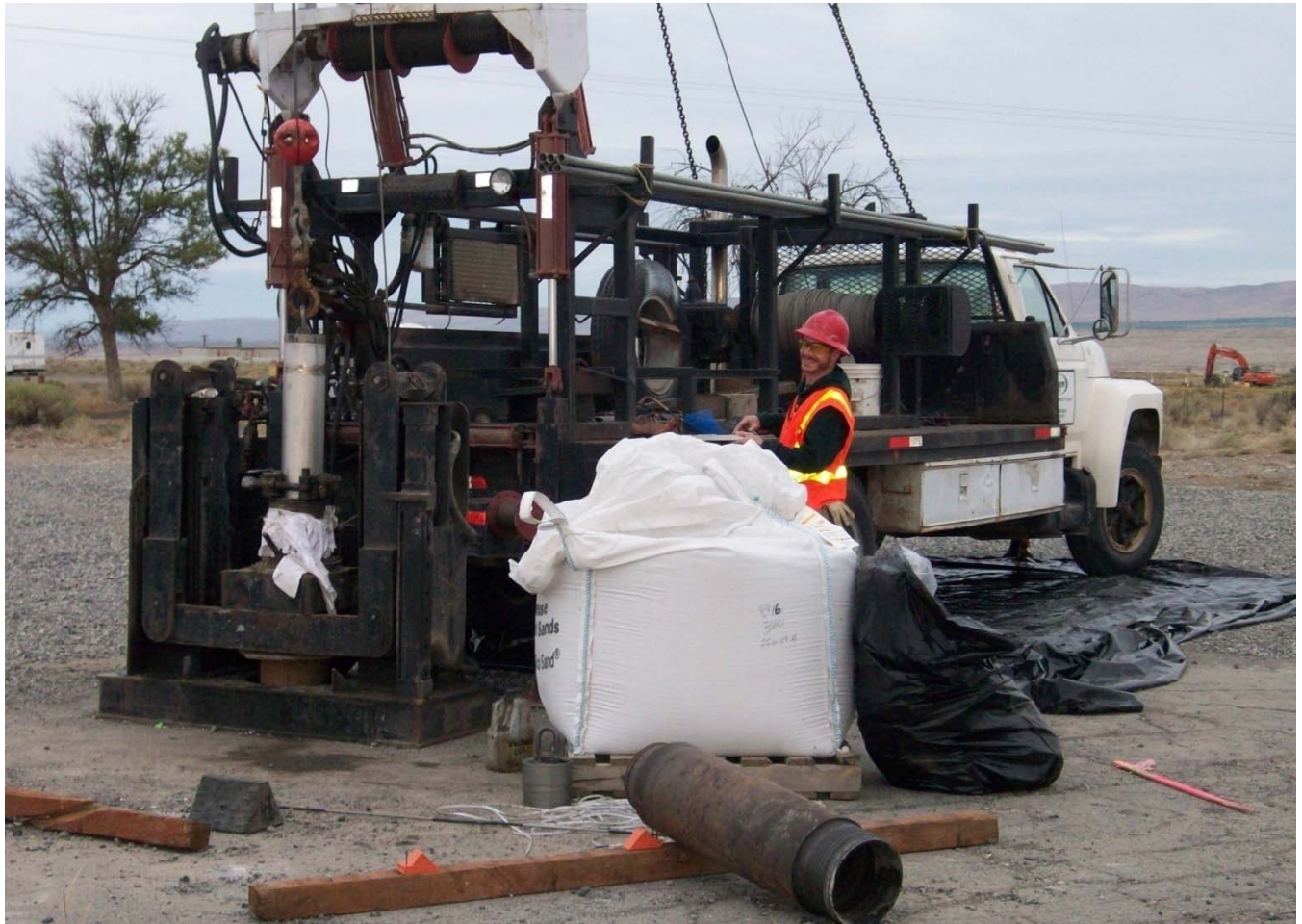
A worker from the subcontractor Layne Christensen performs well construction and water sampling preparation at the 100-HR-3 (H Area) site. The well will be one of several to support the 100-HR-3 DX Pump and Treat Facility.