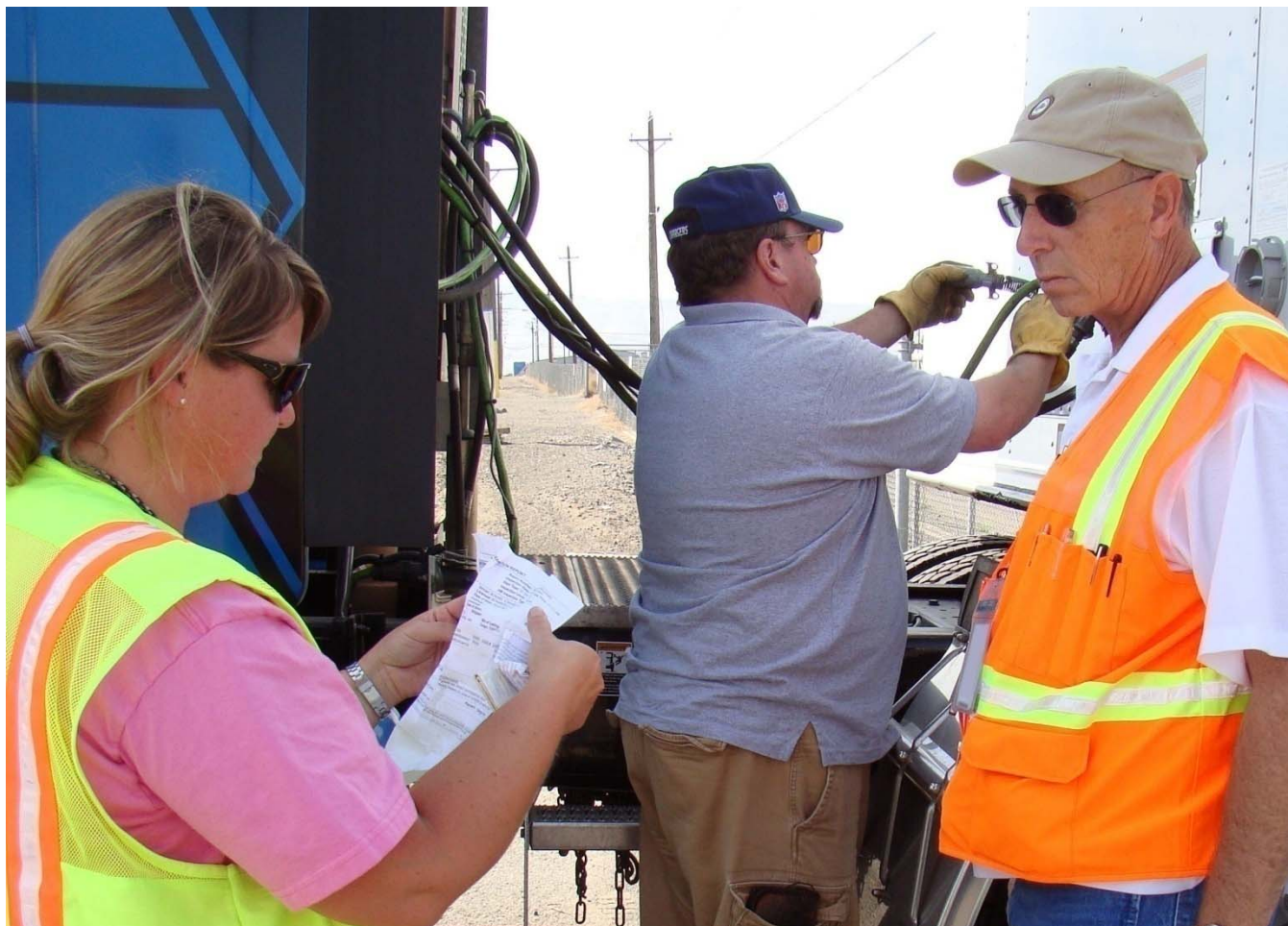
A CSG shipper inspects the tractor and trailer inspection records prior to releasing the shipment.