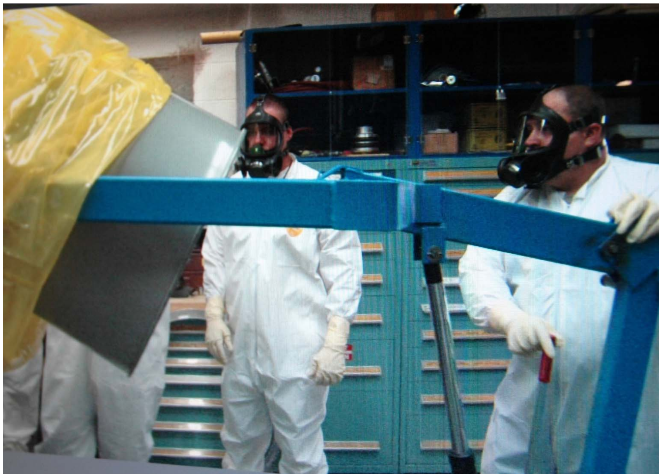
NCOs "mating" a mock-up drum to a glove bag to empty the contents and ready the glove bag for processing.