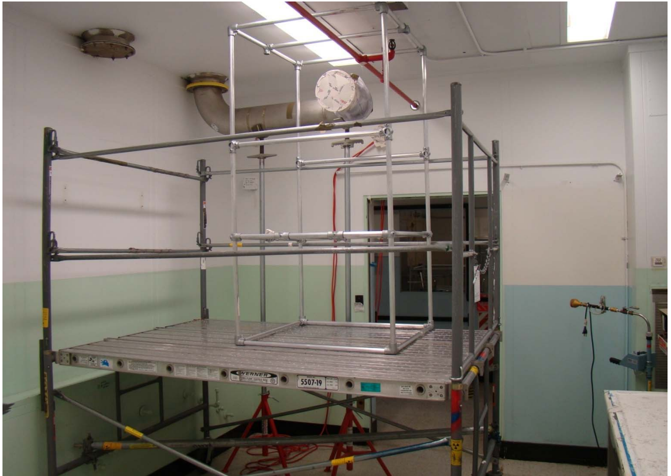
Room 154 of PFP's Analytical Laboratory after the removal of glove boxes and hoods and prior to the removal of the remaining ventilation ducting.