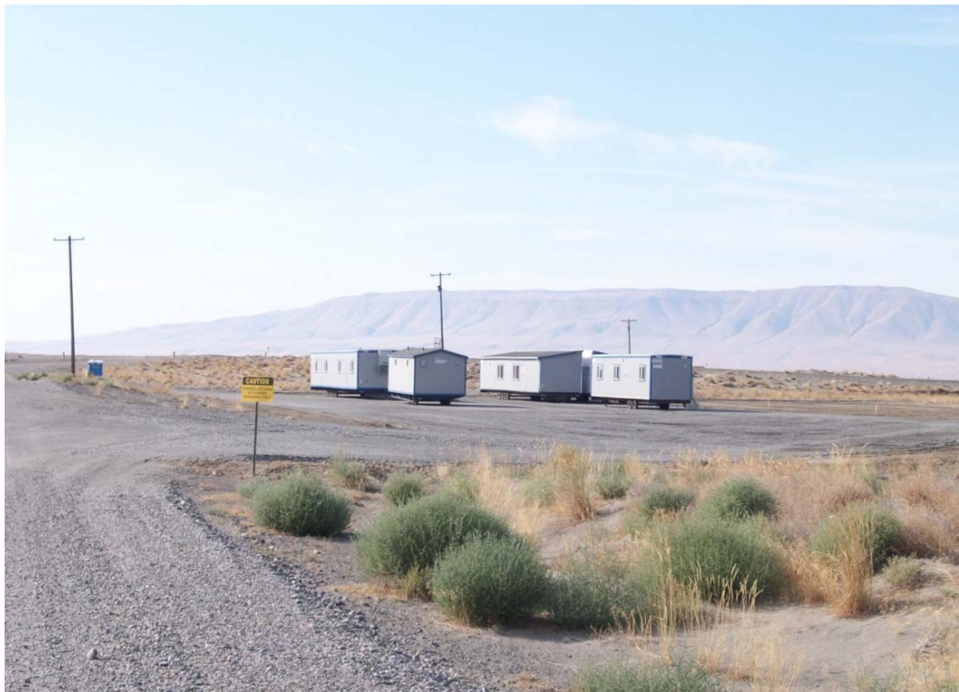
The Borrow Area before and after trailers and equipment mobilization. The site will now be used to support remediation efforts in the BC Control Area.