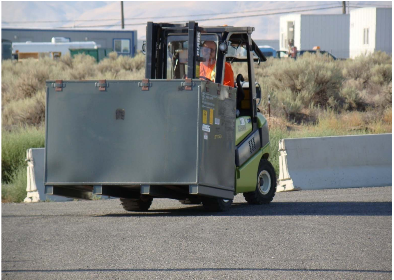
A CWC operator transports one of the TSCA-LLW packages from the storage building to the staging area prior to loading and shipping.