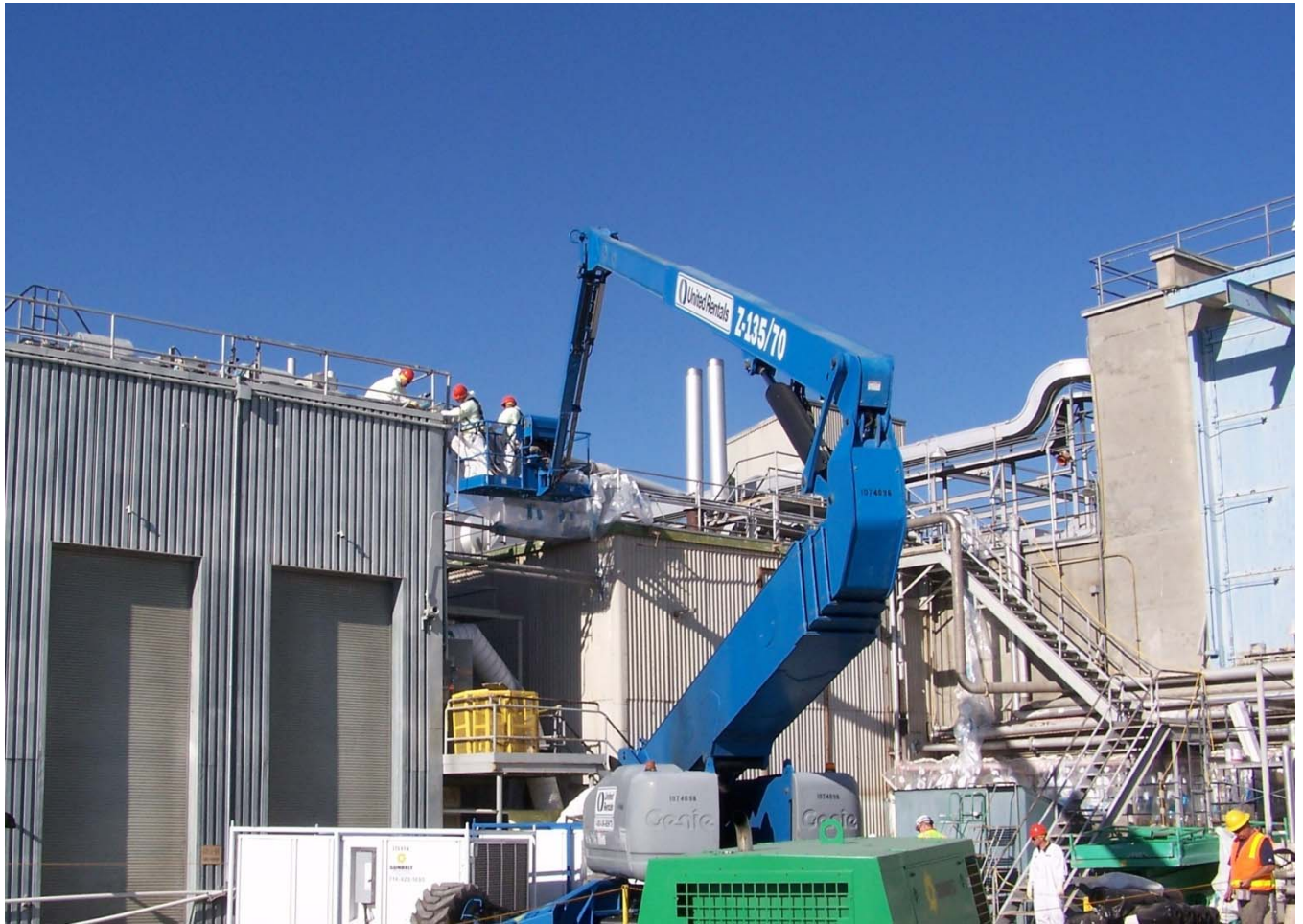
Workers install containments to support asbestos abatement on the exterior of the 224-UA building.