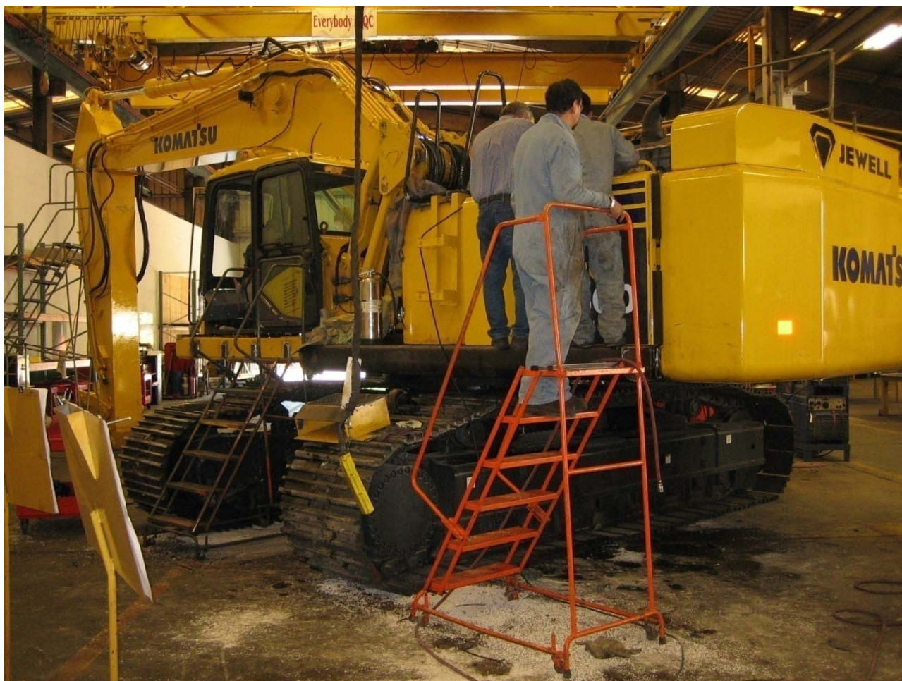
A 60-ton high reach excavator is undergoing modifications at the vendor facility. Potential modifications include such items as installation of demolition glass in the cab; modifications to the hydraulic systems for easier maintenance and servicing in contamination areas; modifications that allow more versatility for use of demolition attachments; and additional protection from flying and ground debris.