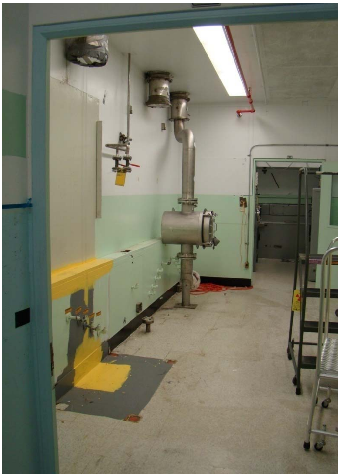
Room 134 of PFP's Analytical Laboratory after removal of four laboratory hoods and ventilation ducting. Recovery Act funds are helping CHPRC empty this room and several others throughout PFP, as workers perform accelerated removal of glove boxes and hoods to ultimately prepare the facilities for demolition.