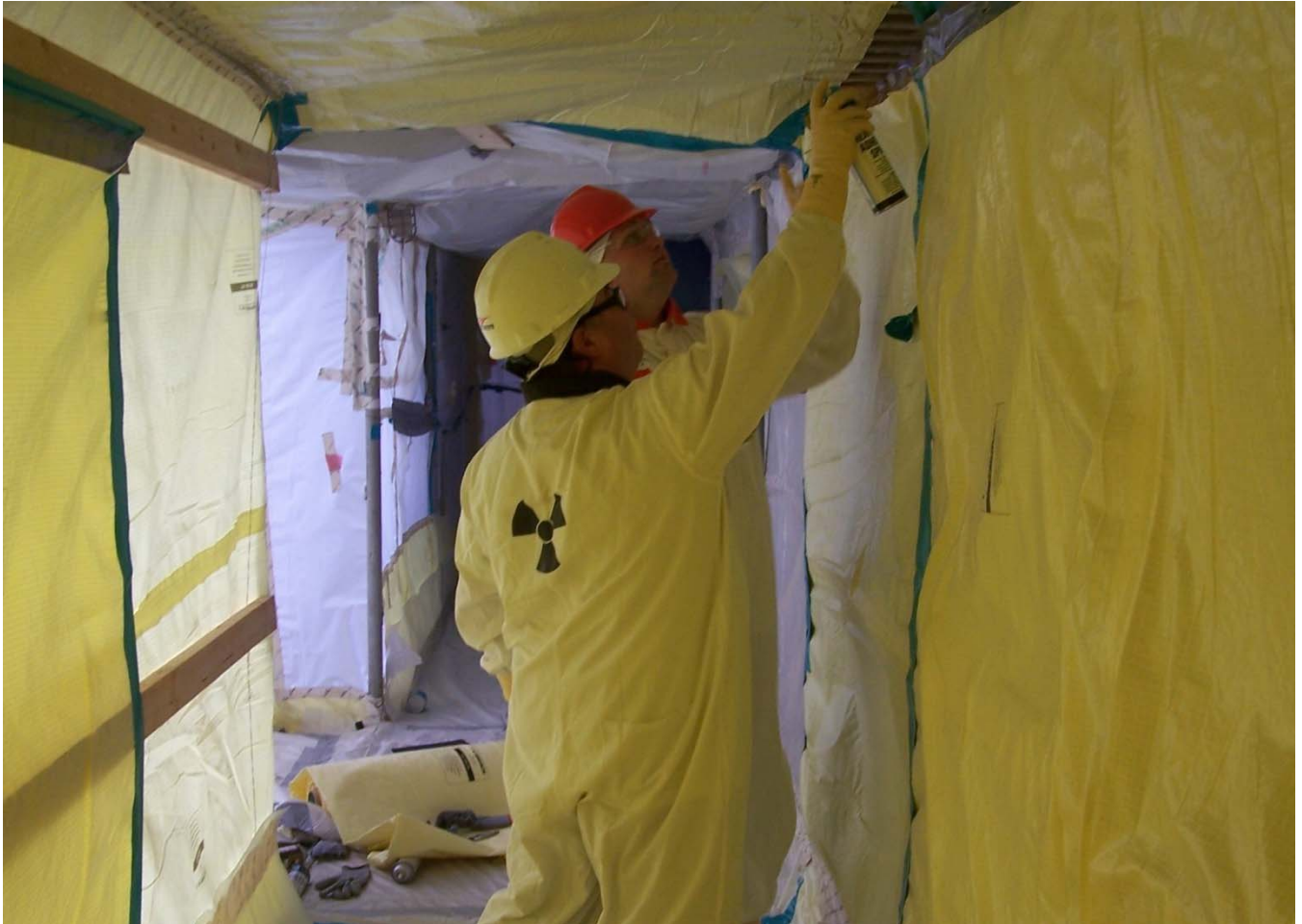
Insulators building an asbestos containment in the 224-UA facility. Containments allow for insulation in large areas of the building to be abated more efficiently. The plastic enclosures will have negative air machines installed that keep the containment under a negative air pressure throughout the abatement phase.

Procurement of heavy equipment to accelerate D&D of facilities on the Central Plateau is also continuing. This past week bids were awarded for purchase of a small front-end loader and a backhoe, and bids were received from interested suppliers for a 90-ton high-reach excavator and a hydraulic hammer for the 60-ton excavator previously awarded.