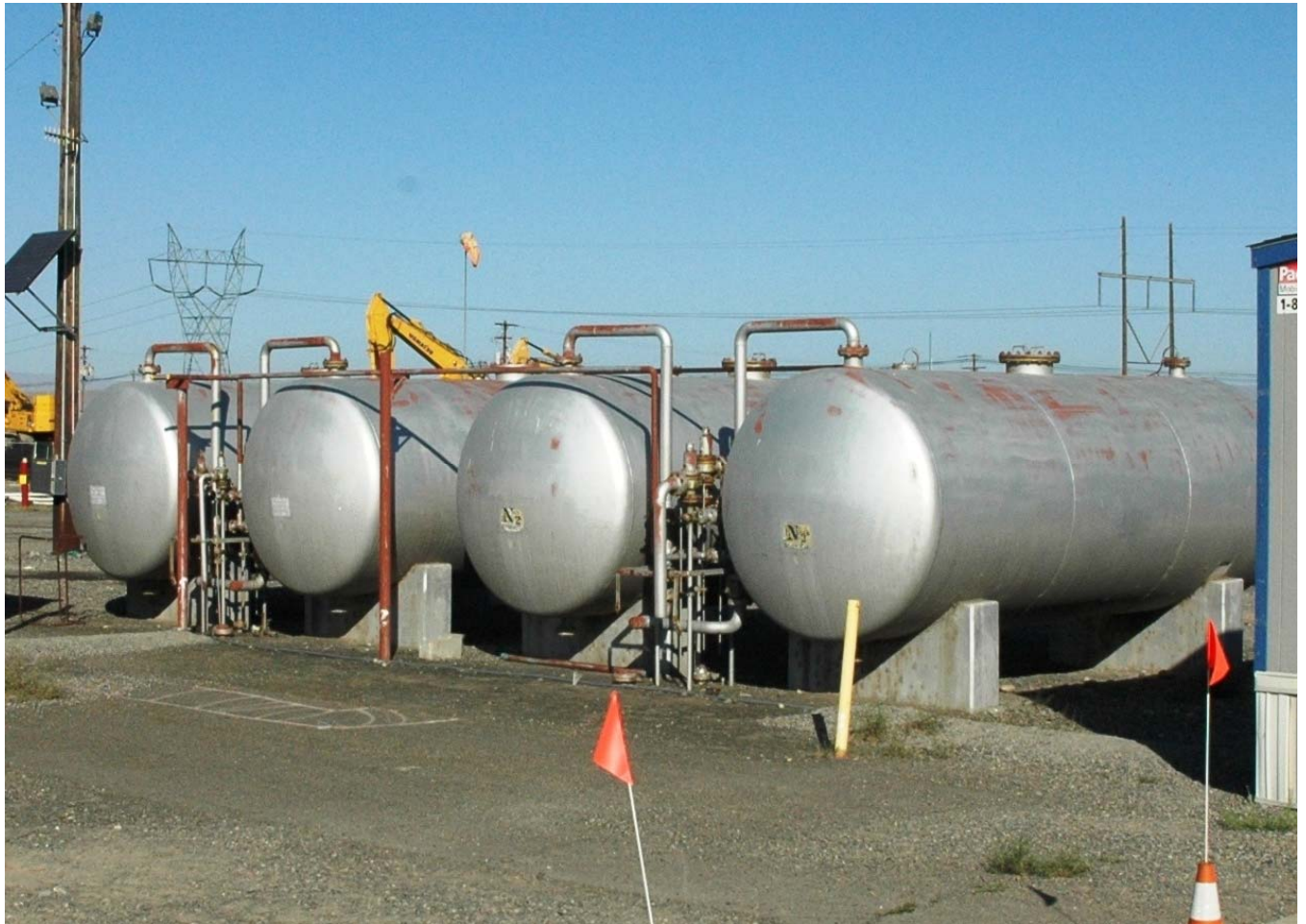
Going . . . The 110KE Gas Storage Facility in the 100K Area before demolition. Demolition began in early September with the support of Recovery Act funds and as part of the overall effort to remove ancillary facilities associated with the KE and KW reactors.