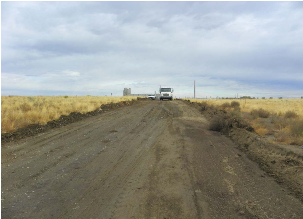
The haul road before and during construction. Workers performed re-grading and re-graveling of the existing roadway area to avoid further disruption to the environment and to limit driving and fire hazards. The road will support the Multi-Incremental Sampling Project to be performed at the 216-S-19 Pond.