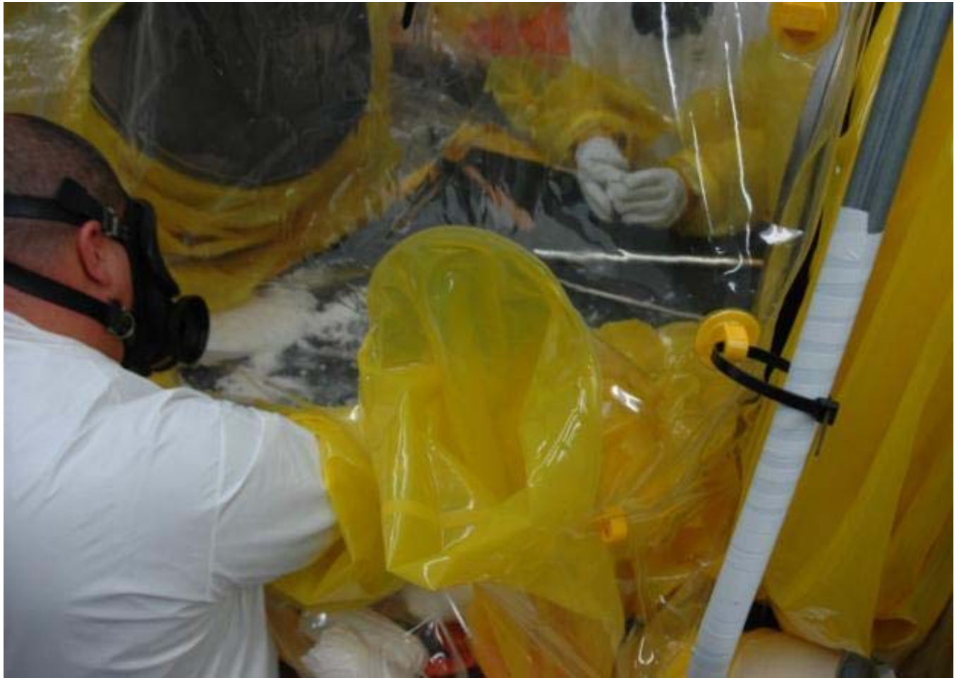
An NCO performs mock-up repackaging in a glove bag. While the training environment was free of radiological hazards, trainees wore protective gear to resemble working conditions and requirements at T Plant.