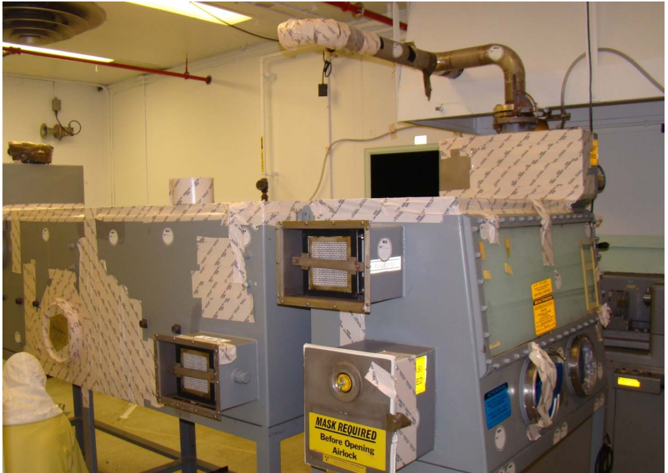
In room 137 of the 234-5Z Building at PFP, workers are isolating three glove boxes from the building ventilation system, one of several steps for preparing a glove box for removal.