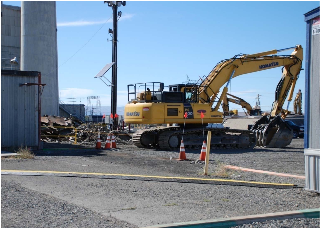
Gone. During the week ending Sept. 11, 110KE Gas Storage Facility has been removed and the site was graded. The size-reduced waste (to the left of the backhoe) is staged for shipment to ERDF.