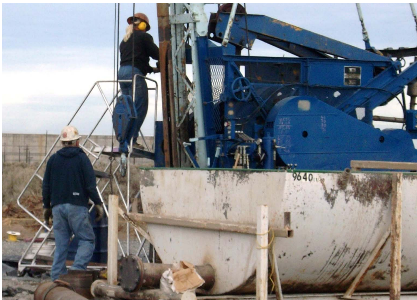
Workers from the subcontractor Blue Star perform drilling preparations at the 200-ZP-1 site, where wells will be drilled to support the 200 West Groundwater Treatment Facility.