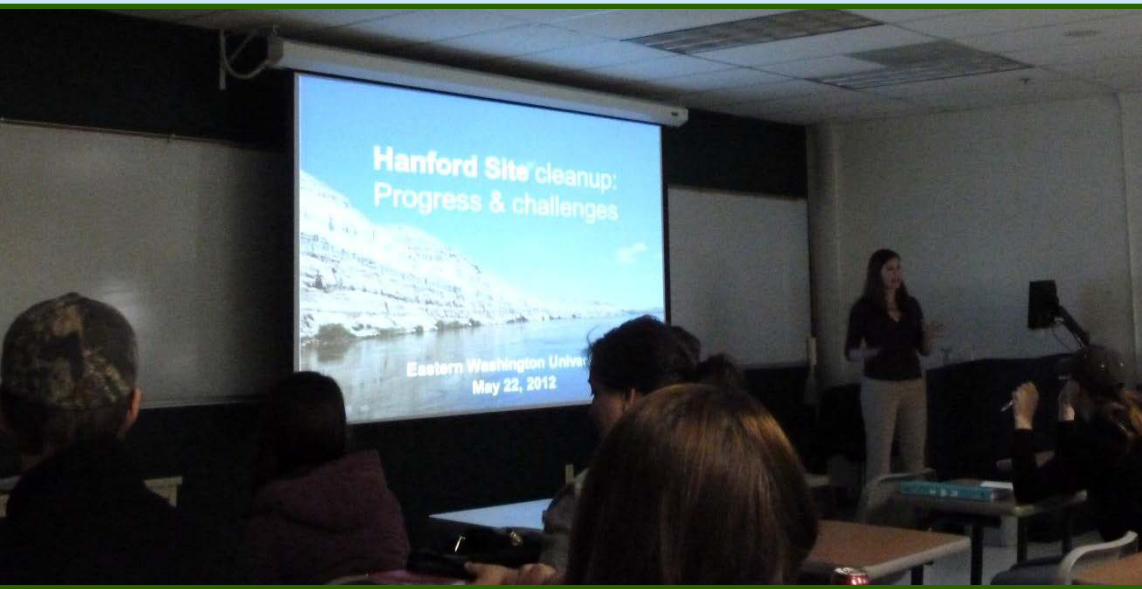
Environmental science class