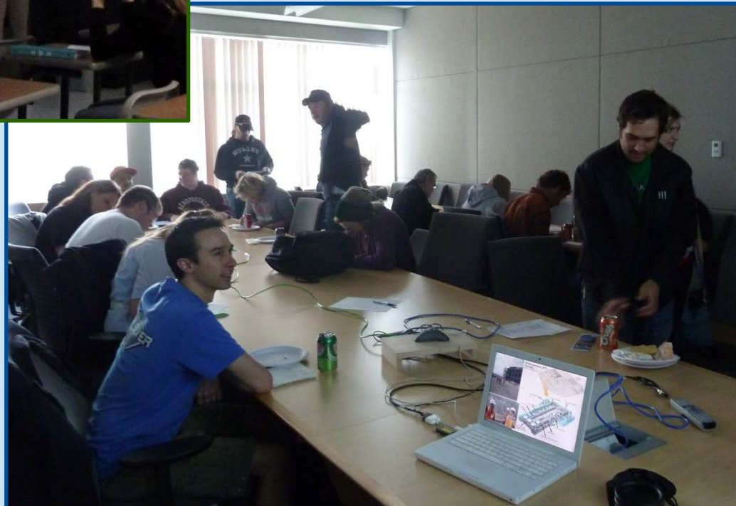
Student section of the American Society of Mechanical Engineers