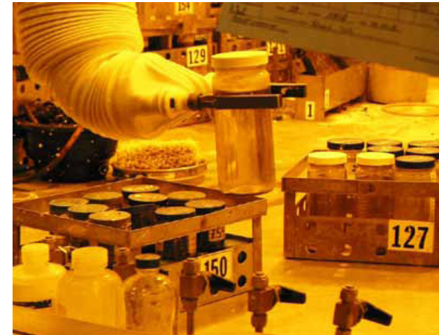
222-S Hot Cell