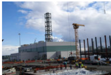
Low Activity Waste Facility

79% design complete 46% procurement complete 38% construction complete