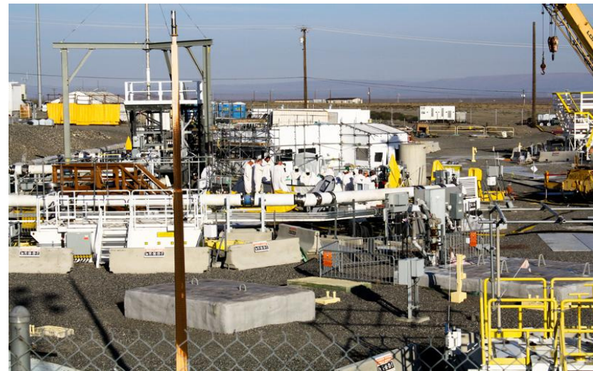
C-Farm Exhauster Stacks