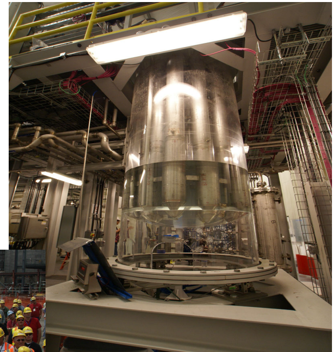
Pulse Jet Mixer