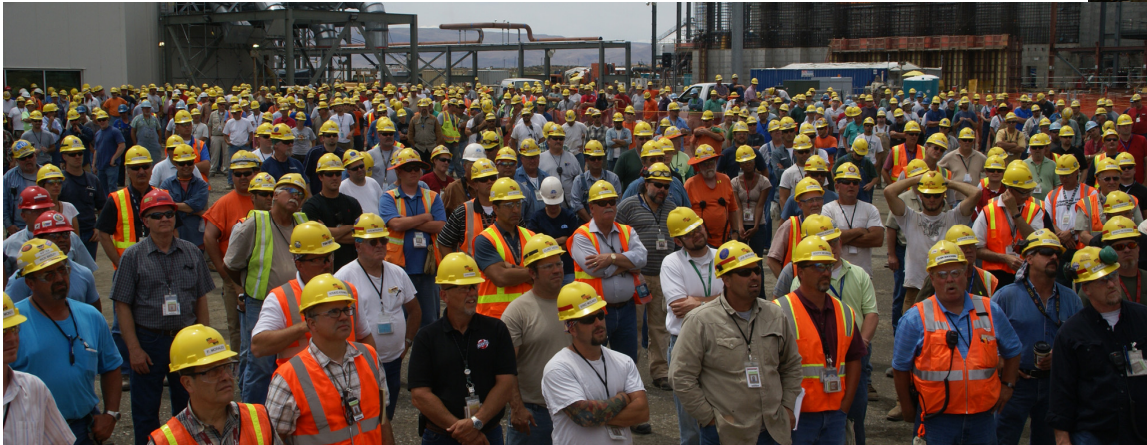
WTP All Hands