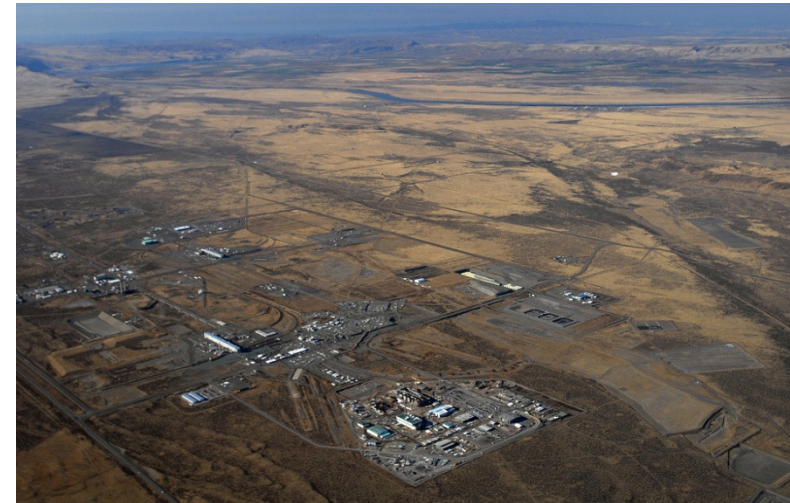
WTP Aerial View