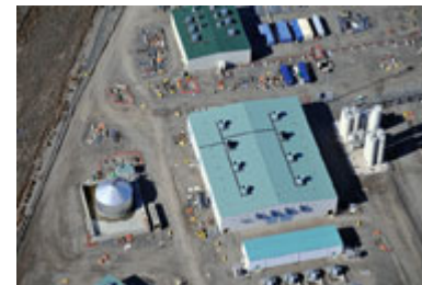
Balance of Facilities

88% design complete 85% procurement complete 65% construction complete