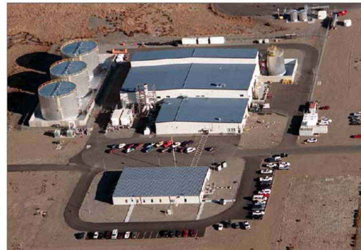
Effluent Treatment Facility