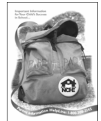
Parent Pack Pocket Folder

This sturdy, laminated folder provides a place to keep important records and documents related to your children's education. The folder also includes information on the rights of children and youth experiencing homelessness and helpful tips about enrollment and disenrollment. These posters are available in Spanish and English at no charge and can be ordered by calling 800-308-2145 or by visiting www.serve.org/nche/online_order.php .