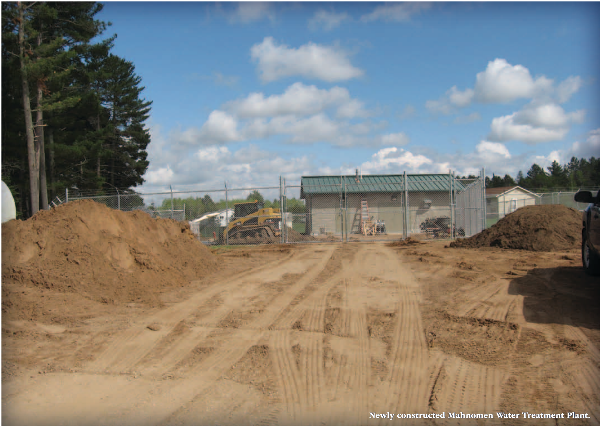
Newly constructed Mahnomen Water Treatment Plant.