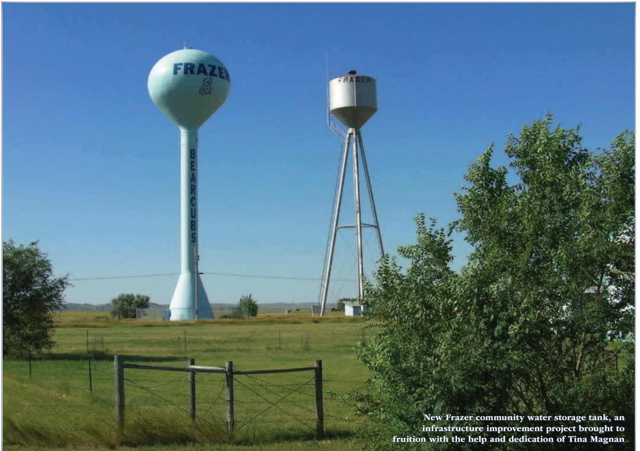
New Frazer community water storage tank, an infrastructure improvement project brought to fruition with the help and dedication of Tina Magnan