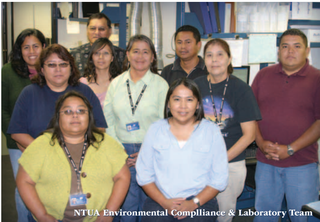
NTUA Environmental Compliance & Laboratory Team