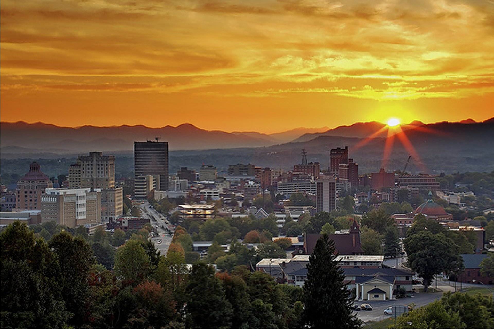
Asheville – County Seat