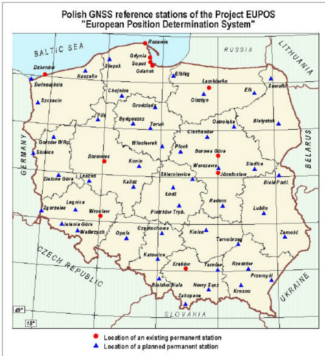
Fig. 2. Location of the GNSS stations of the Polish part of EUPOS network