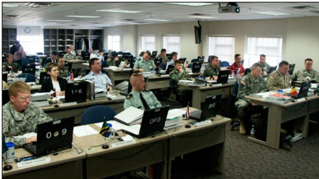
Activation of the Professional Development On-line Certification Application and Tracking system will assist future students with career planning.

The DoD guidelines describe the certification portion of the personnel initiatives. The International Affairs Certification and Career Development Guidelines (IAC&CDG) are established primarily for personnel performing International