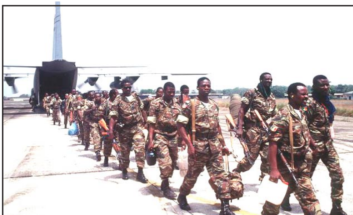
GPOI is a five-year international initiative with the primary goal of training and equipping 75,000 military troops, a majority of them African, for peacekeeping operations by 2010.

He said, "State will obligate much of this funding through current contracts, but has transferred $27.34 million to DSCA. Currently DSCA Country Program Directors are working with the combatant commands to definitize requirements. To date, 17 of 29 requirements packages have been sent to State for approval, and five Letters of Offer and Acceptance, prepared by the military departments, have resulted so far."