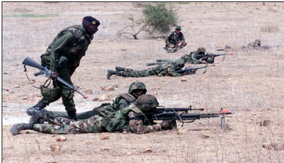
U.S. special forces assist Kenyan soldiers during one of that country's many combat training exercises.

GPOI is a multilateral, five-year international initiative with the primary goal of training and equipping 75,000 military troops, a majority of them African, for peacekeeping operations by 2010.