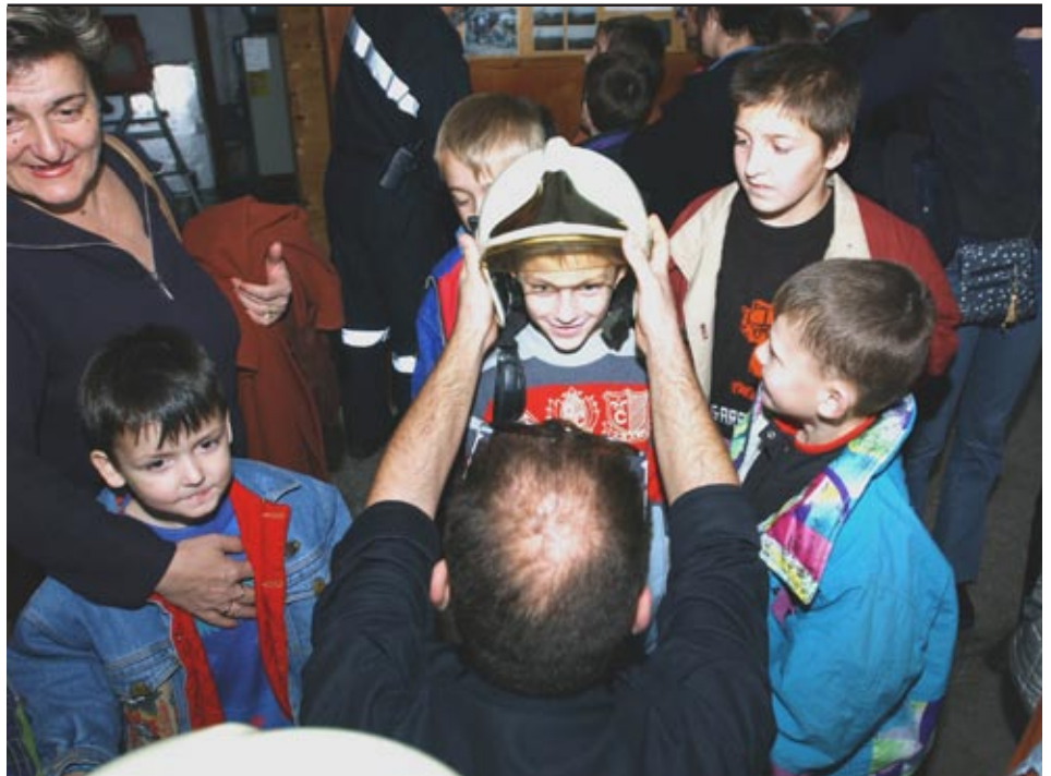
A few years ago angry mobs were staging protests throughout Bosnia and Herzegovina. Today, the country has become more unified despite its diverse, ethnic mix.

Despite having European forces overseeing the peace in his country and ongoing diplomatic discussions over land rights,