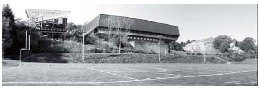
Visitor's Center, Roland Field House, Billard Gym

Many factors contribute to development of leaders of character. Not only does the Coast Guard Academy maintain responsibility for the intellectual and professional development of cadets, but it is also devoted to each cadet's physical development and wellness. This is accomplished through physical education classes, athletic activities during the sports period, and an institutional commitment to physical fitness. The physical education program emphasizes professional competencies and lifetime fitness and wellness.