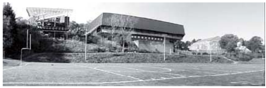
Visitor's Center, Roland Field House, Billard Gym