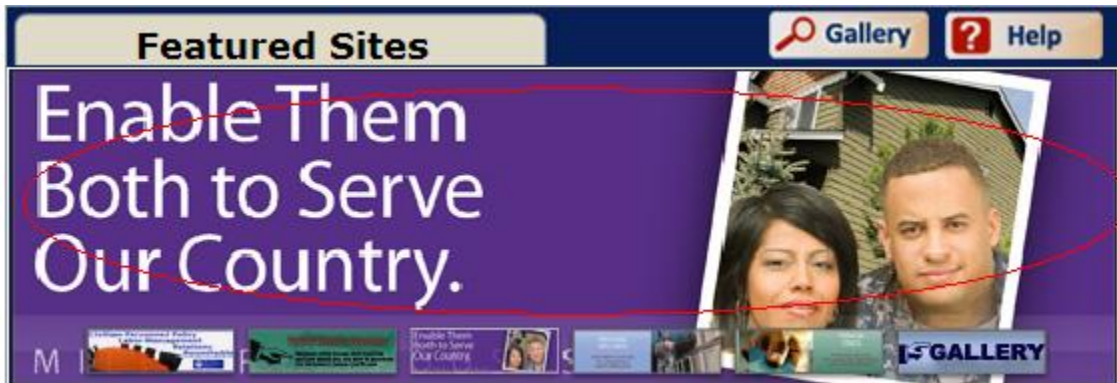
Sub Banner Icon