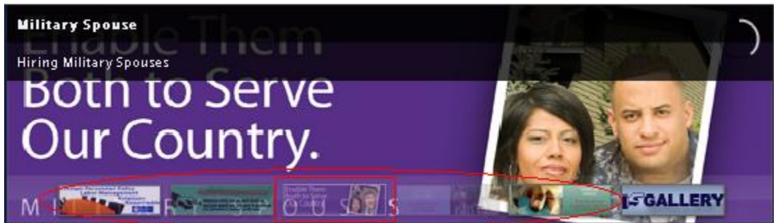
Sub Banner Icon