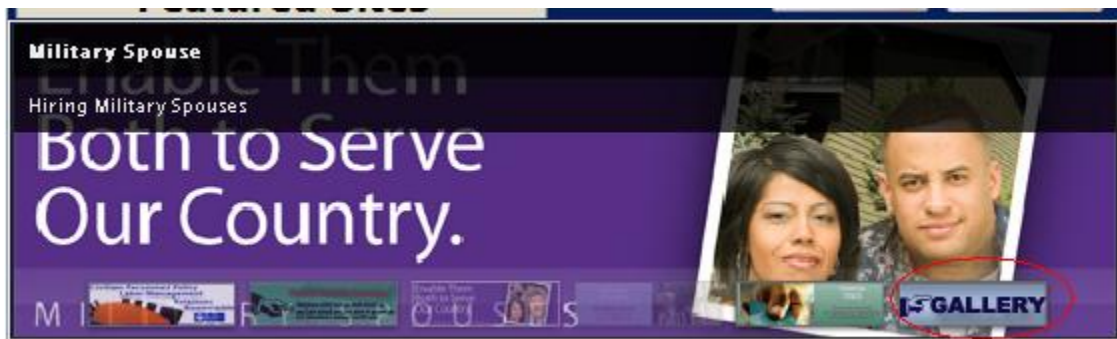
Sub Banner Gallery Icon