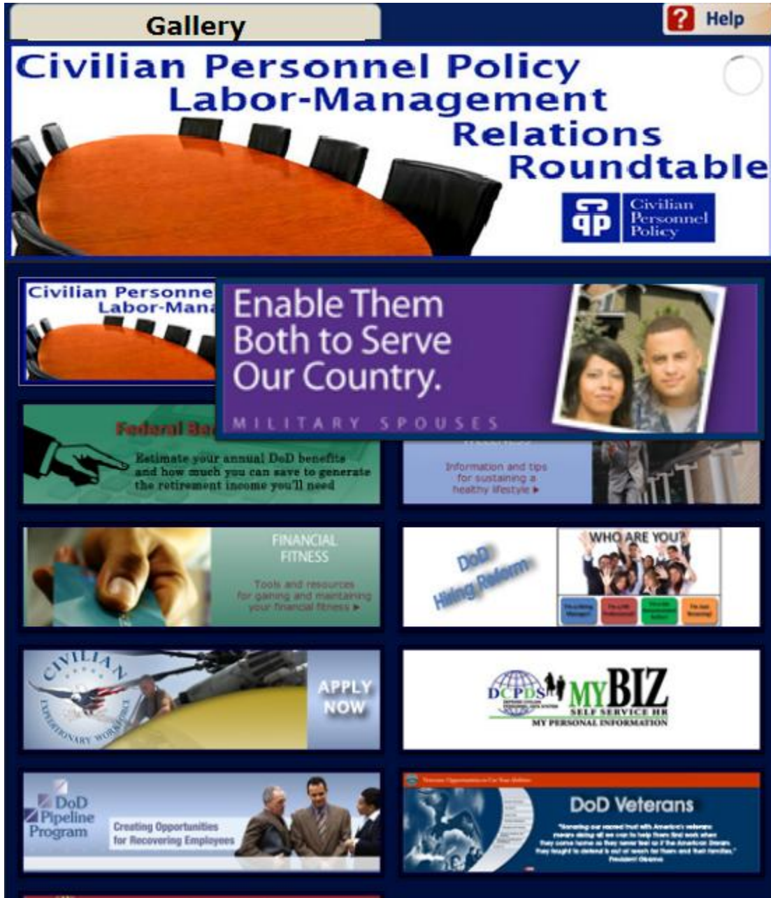
Mouse over Sub Icon of Feature Site