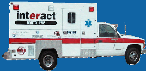
Research/Testbed Ambulance Prototype