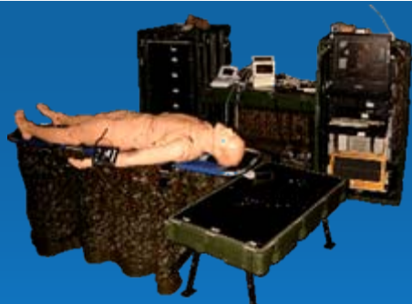
Deployable Telemedicine System