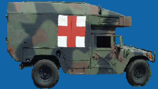
U.S. Army HMMWV Ambulance Prototype