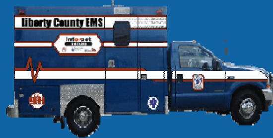
Liberty County Field Ambulance