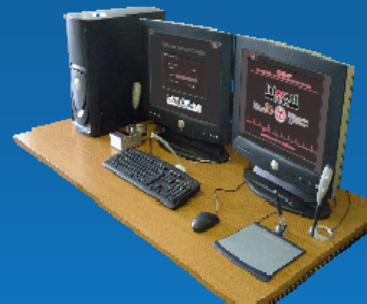
Physician Workstation Prototype