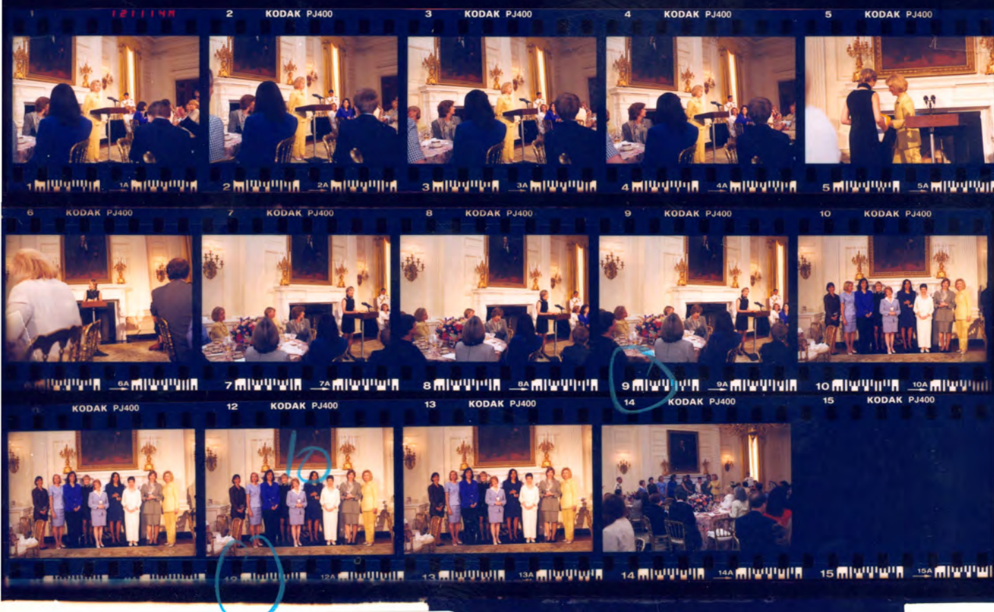
HRC at Redbook Magazine Awards luncheon.