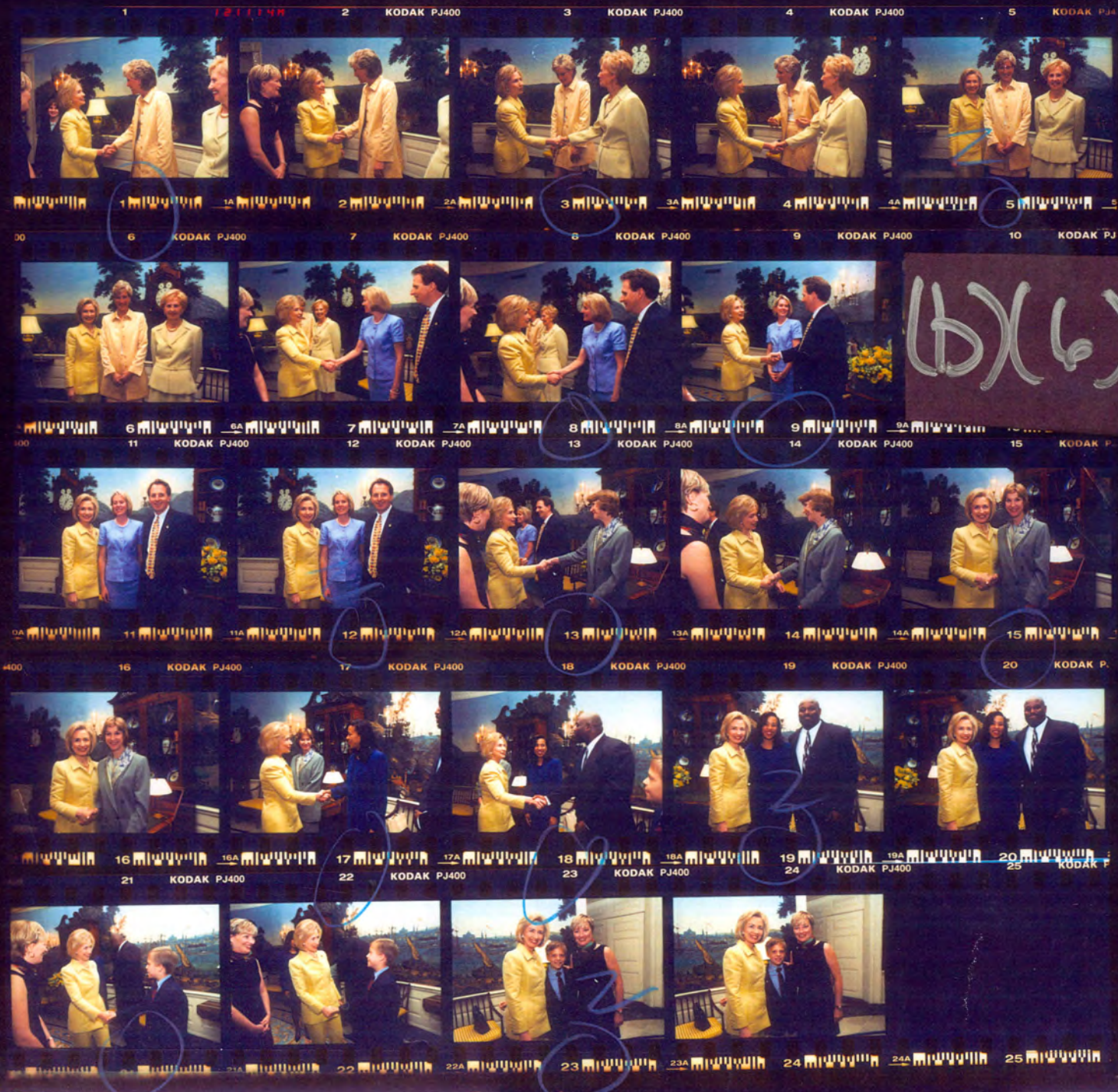
HRC with winners of Redbook Magazine Awards.