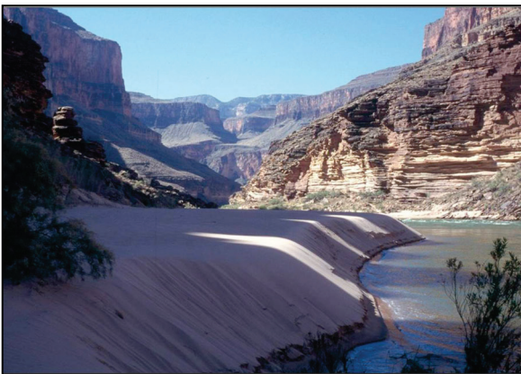
Sand beach along the Colorado River with multiple cultural values