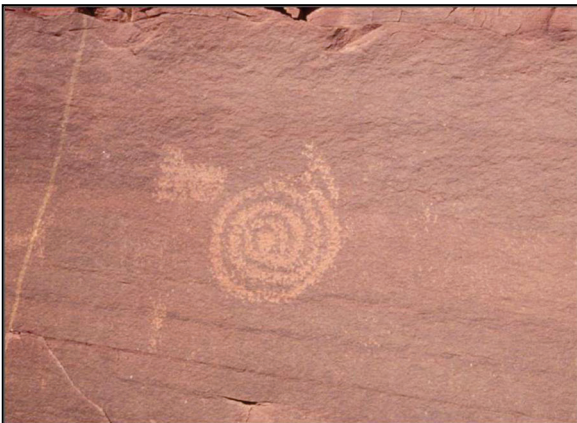
Prehistoric petroglyph in Grand Canyon

Within Glen and Grand canyons, most of the historic properties are not actually listed on the National Register of Historic Places, but are nonetheless recognized as eligible for listing. This recognition conveys the same degree of protection as if they were formally listed and requires the federal agencies to evaluate how their management and other activities may affect the properties.