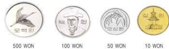
(approx.45, .09, .045, .009 cents, respectively)

The Korean won comes in four denominations of paper currency (1000 won, 5000 won, 10,000 won, and 50,000 won) and 4 minted coins (10 won, 50 won, 100 won and 500 won).