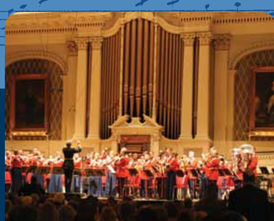
The Marine Band will perform in Mechanics Hall in Worcester, Mass., on Thursday, Oct. 18.

Washington Township Schools 529 Hurfville-Cross Keys Road Sewell, NJ 08080 (856) 589-8500 ext. 7113