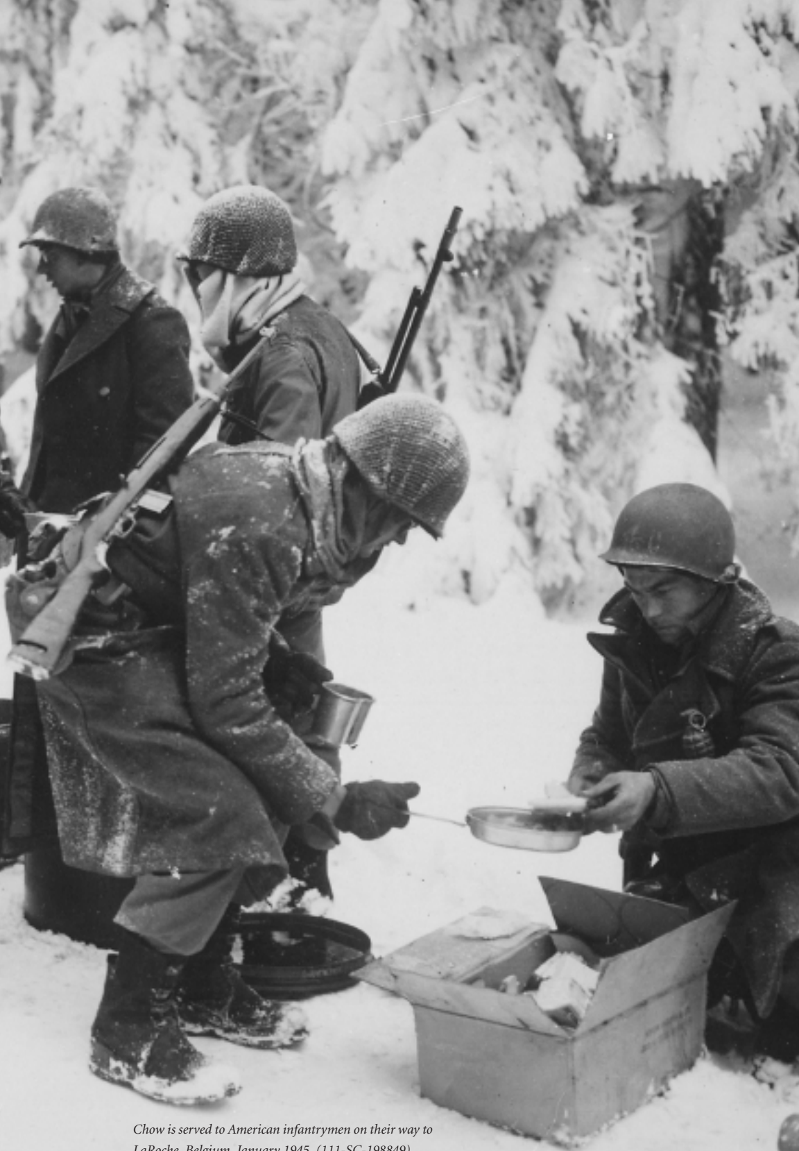
Chow is served to American infantrymen on their way to LaRoche, Belgium, January 1945. (111-SC-198849)