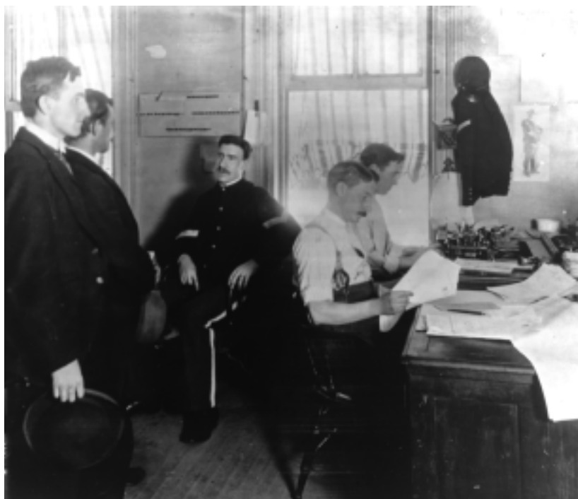
Recruits wait while clerks fill out Army enlistment papers, ca. 1898. These papers are found in entry 91, Enlistment Papers, RG 94, Records of the Adjutant General's Office.

For medical information, consult carded medical records found in RG 94, entries 529 and 530 covering the years 1821–85 and 1894–1912 respectively. These cards relate to Regular Army personnel admitted to hospitals for treatment and may include information such as name, rank, organization, age, race, birthplace, date entered service, cause of