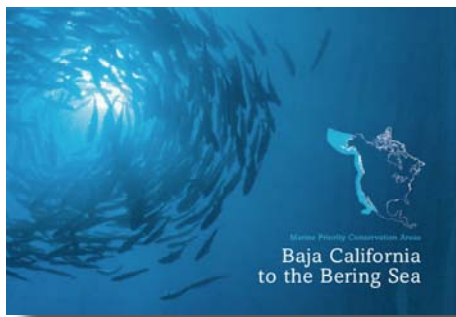
Marine Priority Conservation Areas: Baja California to the Bering Sea (2005)

The NAMPAN partnership has produced several technical products and conducted technical workshops and symposia, including: