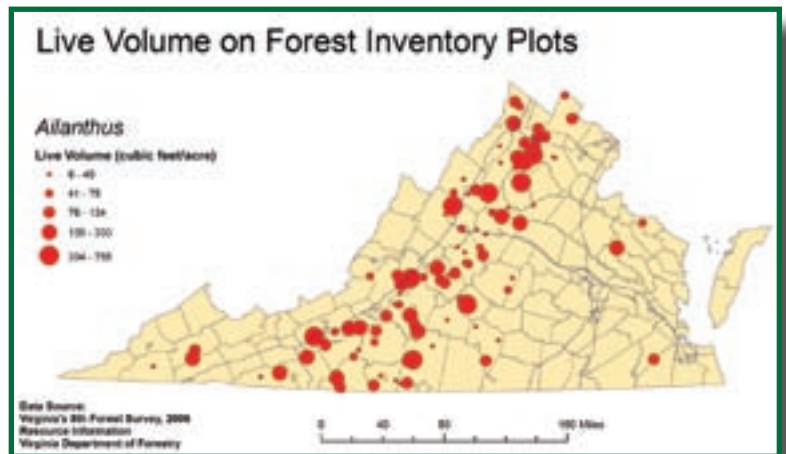
Figure 1. FIA plot data for Ailanthus volume distribution in Virginia.

As in many states, Virginia is increasingly dealing with