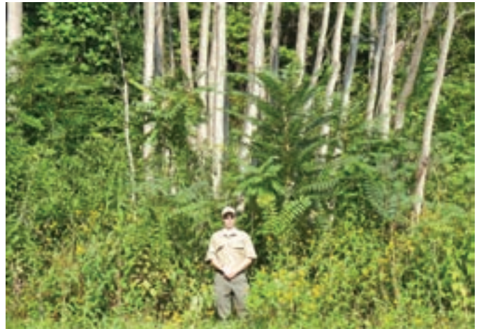
Figure 2: Ailanthus trees often grow in clumps that sprout from the same root system and are clones of each other, or each tree may have germinated independently from seed.

slows after age 20 to 25. Once established, Ailanthus density expands mainly by root sprouting. An acre of land can become dominated by root sprouts from the same individual tree. Sprout growth slows considerably if they become shaded. Cattle, deer and rodent browsing, as well as defoliation by ermine moth caterpillars, may strip seedlings and saplings of their foliage.