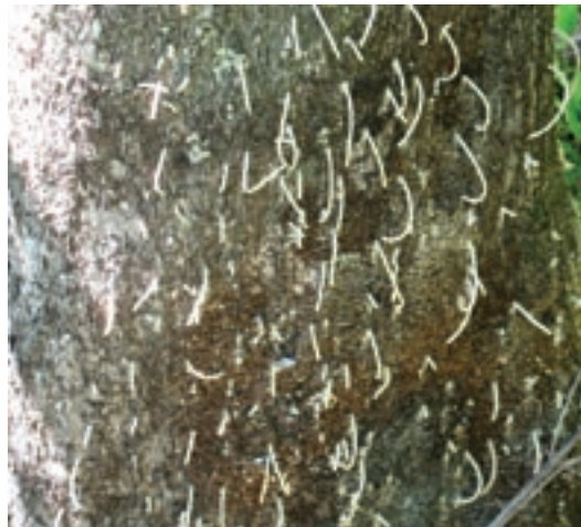
Figure 6. Emergent frass tubes result from boring of ambrosia beetles, which can attack Ailanthus following treatment with herbicides.