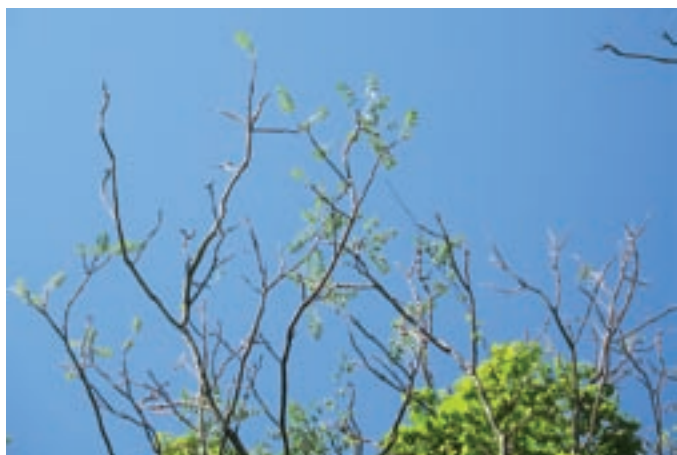
Figure 5. Example of stunted thin foliage of treated Ailanthus the spring following a September basal spray of triclopyr in oil (Garlon 4).