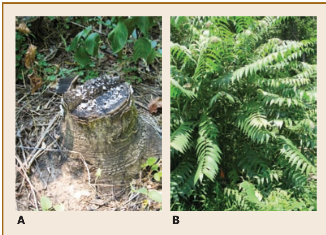
Figure 3: Typical treated and untreated tree-of-heaven stumps one year after cutting: A) Stump from stem treated with Garlon 4 basal spray one week prior to cutting; B) Prolific stump sprouting when stump is cut without an herbicide application.

Application of herbicide to the cut stumps must be conducted immediately after cutting, within five minutes to 15 minutes of the cut with water soluble formulations, or longer with oil mixtures, to ensure uptake of the chemical before the plant seals off the cut area. The mixture may be painted on with a paint brush or sprayed on using a spray bottle or backpack sprayer. A mixture of 20 percent to 25 percent Garlon® 4 in an oil-based carrier is effective (Figure 3). In this case, the whole stump surface and sides to the ground line would be sprayed.