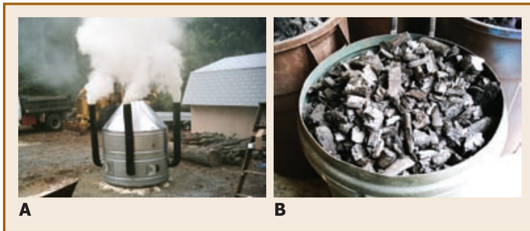
Figure 7: Department of Forestry charcoal kiln and Ailanthus charcoal.

As part of a project to develop value-added products from small diameter and waste wood, several batches of Ailanthus slabs and branches were used to make charcoal (Figure 7). The quality of the charcoal was good, especially that made with slabs. Several food items at different events were cooked using the charcoal with extremely positive results. To maximize charcoal quality and quantity, some air drying of the wood is necessary due to high moisture content of green material.