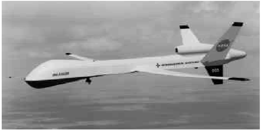
The modified Altair version of the Predator B, shown in this computer-generated image, will have an extended wing and tail, upgraded avionics and redundant controls designed which will allow it to carry earth science payloads for more than a day at altitudes as high as 52,000 feet.

The first Predator B prototype uninhabited air vehicle (UAV) is powered by a Honeywell TPE-331-10T turboprop engine, derated to 700 shaft horsepower, driving a rear-mounted three-blade controllable-pitch propeller. The Predator B is 36 feet long and has a wingspan of 64 feet, about 16 feet longer than the Predator. It is distinguished from its smaller cousin by its Y-shaped tail, with a ventral vertical fin. It is designed for a maximum gross takeoff weight of 6,400 lbs. The first turbine-powered aircraft built by GA-ASI, the Predator B is designed to fly as long as 25 hours at up to 200 knots indicated airspeed at altitudes as high as 45,000 feet, while carrying payloads of up to 750 lbs. The aircraft are designed to meet Federal Air Regulations Part 23 requirements.