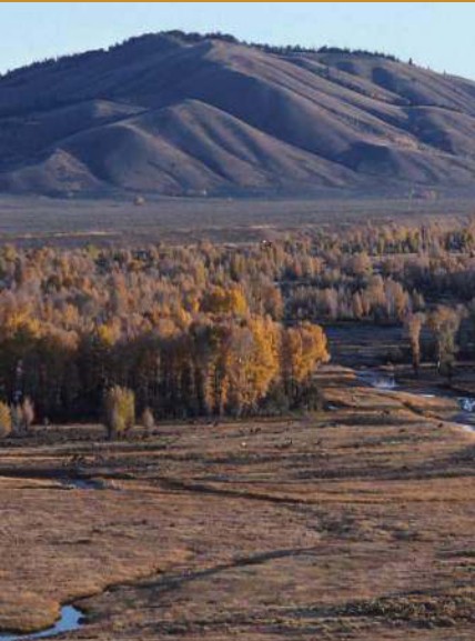
Streams and riparian zones can be damaged by flood events, drought, invasive species, overgrazing, and recreation, and are frequently selected for restoration actions. Near Jackson, Wyoming.