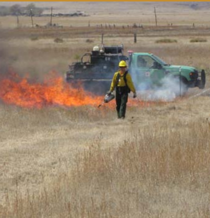
Trained US Forest Service fire management personnel apply fire treatments to RMRS study sites on the Kiowa National Grassland, near Clayton, New Mexico.