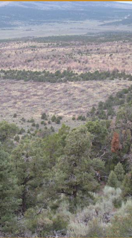
Top: Overview of the treatments at the SageSTEP Marking Corral site in eastern Nevada near Ely. The Mechanical, Chainsaw Cut Treatment is in the foreground, and the Prescribed Fire Treatment is in the background. Each treatment covered over 1,000 acres.