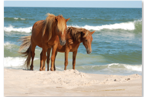
Assateague Island ponies