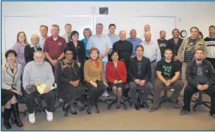
Mohave County Energy Careers Alliance