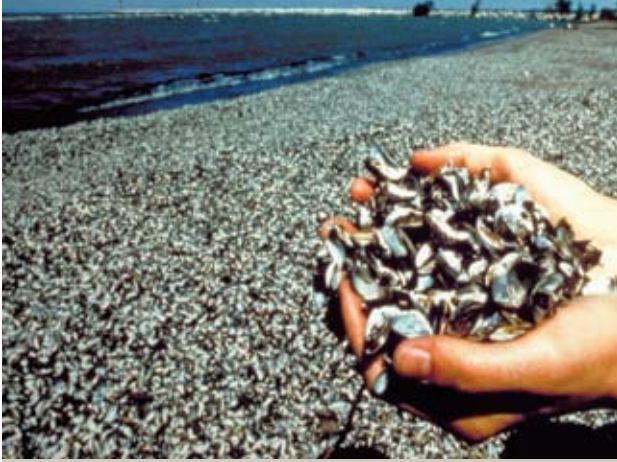
Zebra and quagga mussels reached the United States via ships ballast water in the later 1980s and have been spreading across the continent ever since. In 2007, these species were detected in the West for the first time.