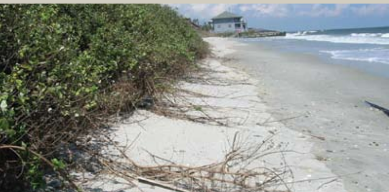
Randy Westbrooks, USGS

SOLUTION: Enact and coordinate effective regulations to require that ballast water be treated before it is discharged to a standard that protects the environment and thus stops future invasions.