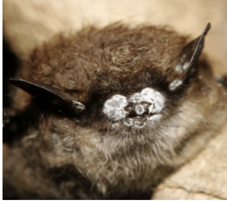
*Little brown myotis with growth of the fungus causing WNS on its rostrum