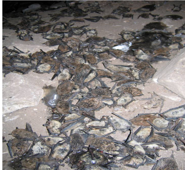
*Little brown myotis carcasses littering floor of Aelous Cave, VT