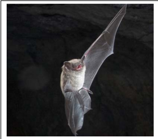
*Healthy Little brown myotis in flight