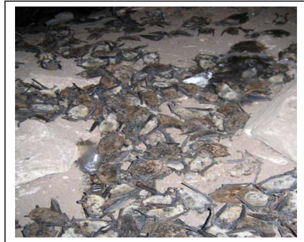
*Little brown myotis carcasses in Aelous Cave, VT in 2009