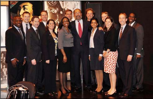
Fellows with Mr. Dick Parsons at Apollo Theater

Our final day in New York started with a wonderful breakfast with WHF alumni. We really appreciated meeting everyone and hearing about their experiences in the city. Afterwards, we quickly walked the two blocks to Tweed Court House to meet Joel Klein, Chancellor of the New York City Department of Education. Chancellor Klein was the fourth urban school superintendent that we've met this year, and he provided a fascinating contrast to the others from Chicago, Detroit and Washington, DC. Our next stop was to meet Ray Kelly, Commissioner of the New York City Police Department. A dapper dresser, Mr. Kelly was kind and calm and certainly fit the part of the two-time Commissioner.