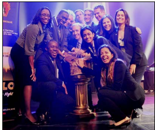
Fellows on Apollo Theater stage

Our final stop of the trip was to the Apollo Theater on 125 th Street. Dick Parsons, Chairman of Citigroup and Chairman of the Board of the Apollo Theater Foundation, sat down with us to talk about his experiences from Washington to New York and from finance to entertainment. He then led us downstairs, where we watched hopeful artists rehearse for Wednesday's Amateur Night. It was a beautiful and inspiring end to a fabulous trip.