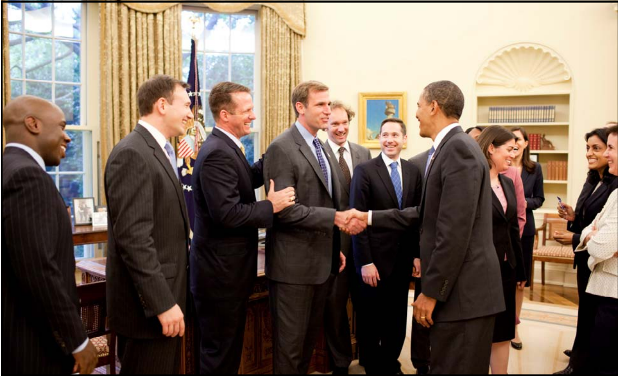
Fellows meet with President Obama in the Roosevelt Room and Oval Office.

“I often say that the beauty of serving others is that anyone can do it. You don’t have to be President, and you don’t have to be a pro football player. All you need to do is to have a desire to make a difference, to give back to your community and to contribute to your nation.” — President Barack Obama