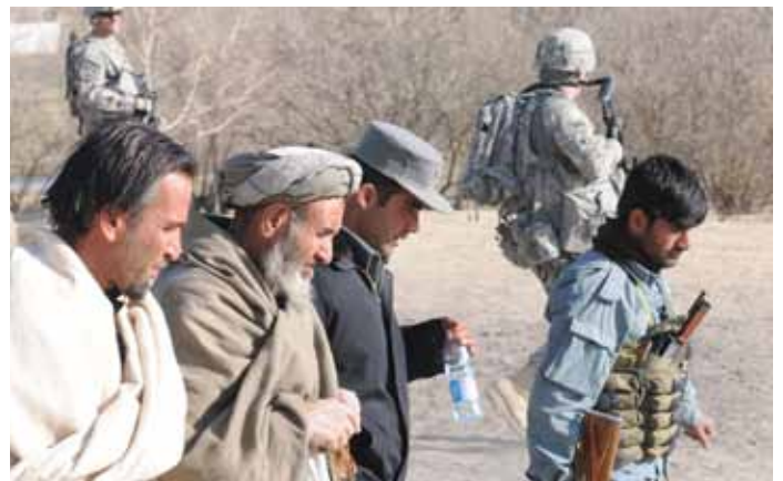
Afghan police officer and U.S. soldiers with village elders, Afghanistan (, Dec. 2010).

Camp mayors often have limited experience in fulfilling their installation and contractor-management functions, yet an organization with the necessary expertise already exists. Despite having developed this expertise through years