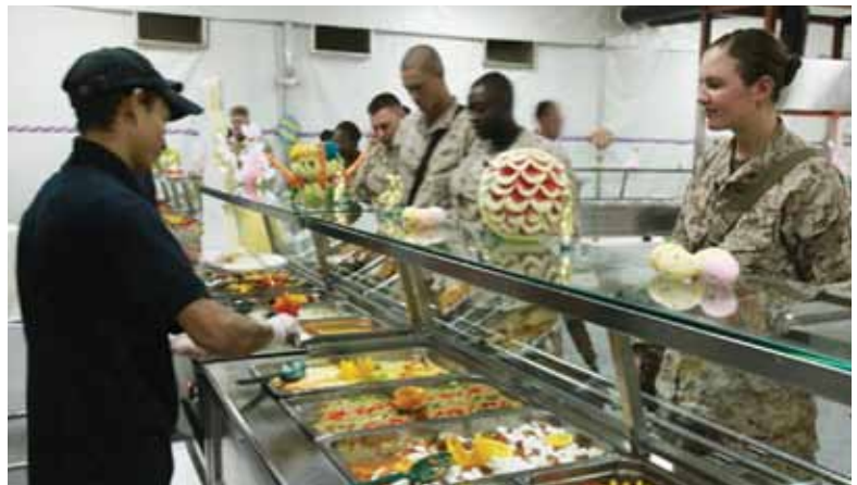
Contractor serving lunch at Camp Leatherneck, Afghanistan.

Real competition is an effective government tool to obtain the best value for taxpayers' money and to encourage contractor productivity and innovation.