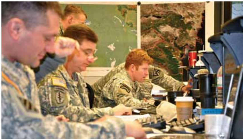
Training exercise at Army Command and General Staff College (Army photo, 2010).