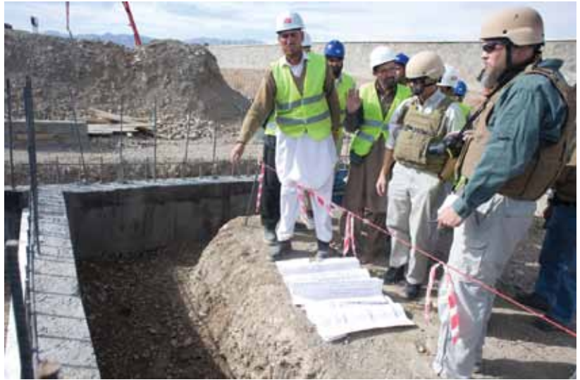
USAID representatives at hospital construction site, Afghanistan (U.S. Air Force photo, Nov. 2010).

agreements with the Department of Justice. As a part of these agreements, the contractors often concede to a statement of facts and admit to certain misconduct. However, these agreements often allow contractors to avoid prosecution, and contractors may make the admissions only with the caveat that they cannot be used in a future suspension or debarment proceeding. Such arrangements allow contractors with a history of misconduct to remain eligible for future government contracts.