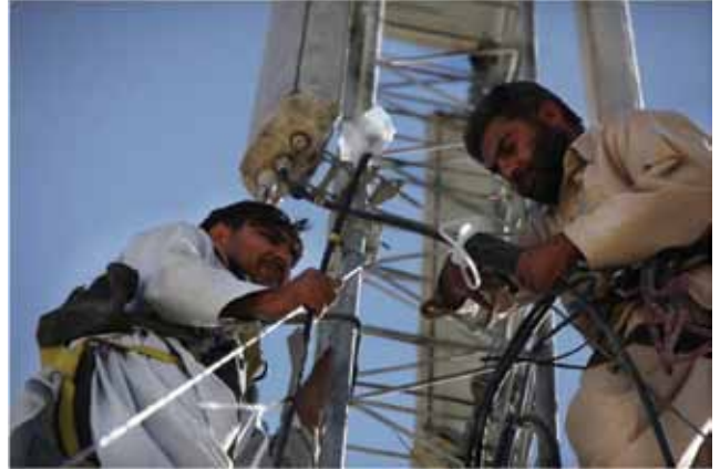
Afghan contractors working at new cellular telephone tower, Helmand province, Afghanistan.

Many contractors with business-system deficiencies are still insufficiently incentivized to correct deficiencies in a timely manner. Following a Commission hearing in 2009, DoD proposed a new rule to define system requirements and stimulate contractor compliance. In the National Defense Authorization Act of fiscal year 2011, Congress authorized DoD to withhold payment to contractors with inadequate business systems as a means of protecting U.S. government interests and compelling contractor compliance. The promise of these initiatives has not been fully realized, and the new authority cannot serve as a meaningful incentive unless payments are actually withheld.