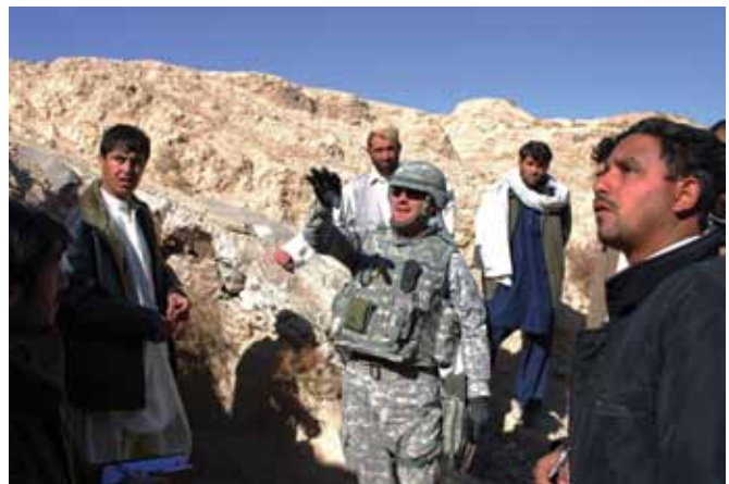
Provincial Reconstruction Team at erosion-control project near Qalat, Afghanistan (U.S. Air Force photo, Dec. 2010).

The contracting flexibilities allowed by law, including exemptions from most competition requirements, are useful at the onset of a contingency. However, as the contingency-contracting environment matures, agencies should introduce more competitive practices. Competitive approaches would include looking for opportunities to transition to fixed-price contract types that will broaden the pool of qualified contractors and ensure more equitably balanced risks.