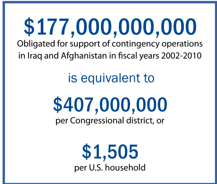
Figure 2: Contract and grant obligations

Each section contains specific, actionable recommendations that should be implemented in the near term to be most effective in countering the problems identified in the analysis of issues.