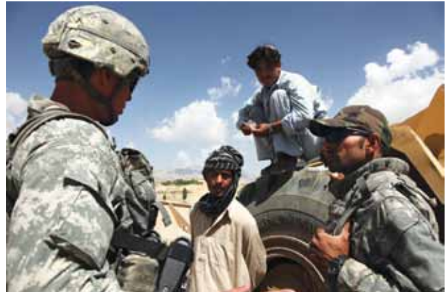
Army officer with Afghan contractors.