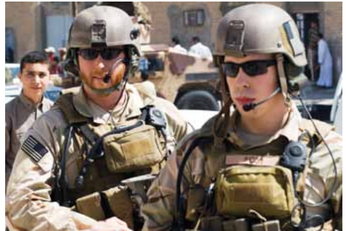
Civilian security contractors at hospital in Basra, Iraq (U.S. Navy photo, March 2009).

The trend toward contracting out security also reflects the government's human-resource constraints. With Congressionally mandated overall force-strength ceilings, and with limits on military force-strength "in theater," DoD has had to choose between using military personnel or security contractors for force protection. The State Department has limited numbers of diplomatic security agents in its Bureau of Diplomatic Security, while USAID has no organic security capability.