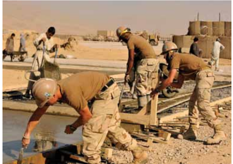
U.S. sailors and Afghan contractors building helicopter landing pads at base in Afghanistan (, Nov. 2010).

part of the “total force” for contingency operations. But the declared total-force policy that includes contractors is at odds with agencies’ failure to plan for their reliance on contractors. During Commission discussions with the Defense Assistant Deputy Undersecretary (Program Support), he suggested the need for joint planners to include contractors in the military’s time-phased force-deployment requirements. DoD’s failure to meaningfully emphasize operational contract support in the 2010 Quadrennial Defense Review (QDR) was a lost opportunity to signal its importance for future strategic planning and execution.