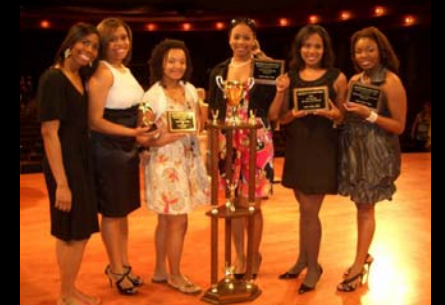
New Faculty Orientation, August 18, 2009