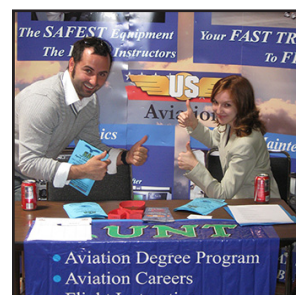
For more information about the Aviation Logistics program, email mktgrepc@unt.edu or call (940) 565-3120.