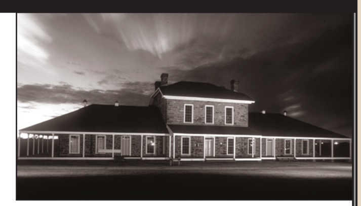
Today, Fort Richardson State Park, Historic Site and Lost Creek Reservoir State Trailway contains 454.16 acres with fort site structures including seven original historic buildings which have been restored along with two replica fort buildings.

Kiowa Chief Kicking Bird and a large war party ambushed 56 troopers from the 6th Cavalry at Little Wichita. Even though heavily outnumbered, the cavalrymen fought off their attackers. Medals of Honor were awarded to 13 men of the 6th for gallantry. Source: Nola Davis, TPWD artist.