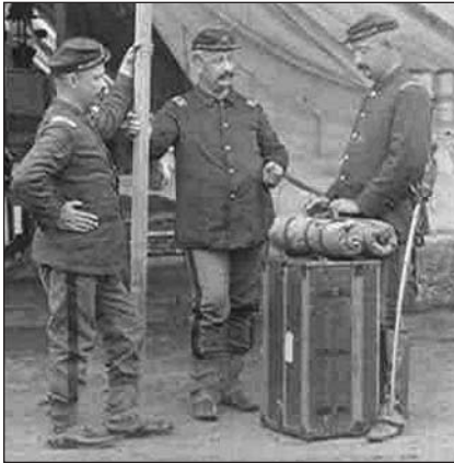
22nd Infantry captains in camp.