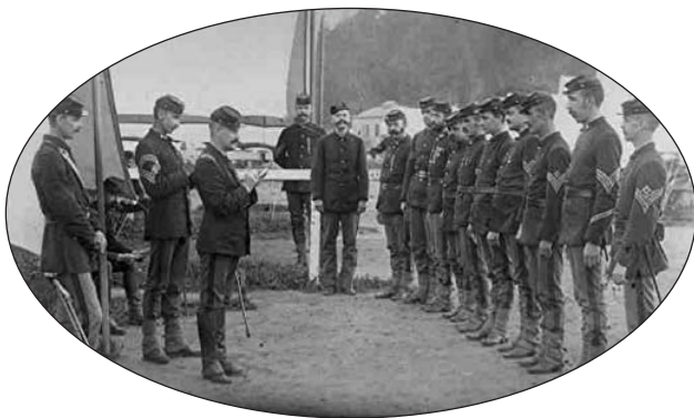
First sergeants of the 22nd Infantry receiving orders in camp.